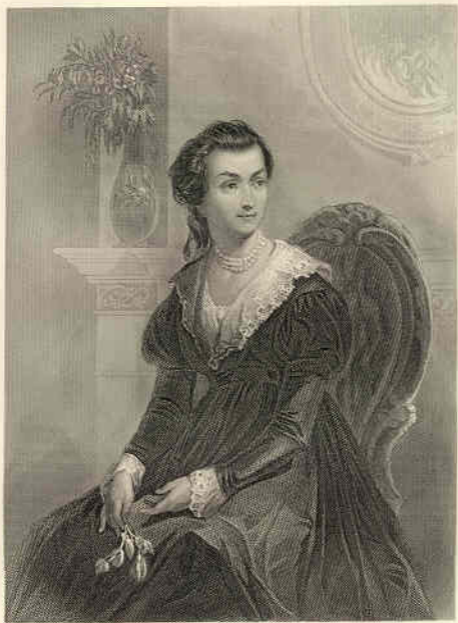
MRS. JOHN ADAMS.