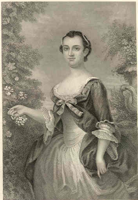
MISS GEORGE WASHINGTON.