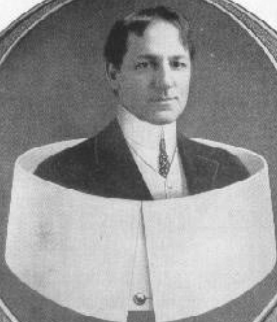
MINTO 2½ in.