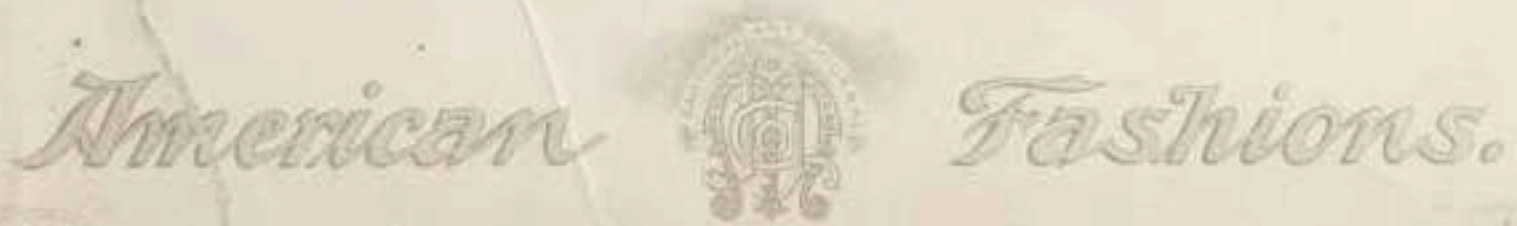
ILLUSTRATION TO 'THE EDITORIAL ART JOURNAL'