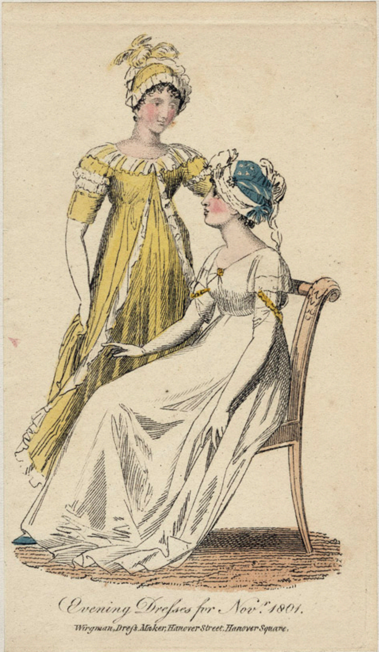
Evening Dresses for Nov. 1801.