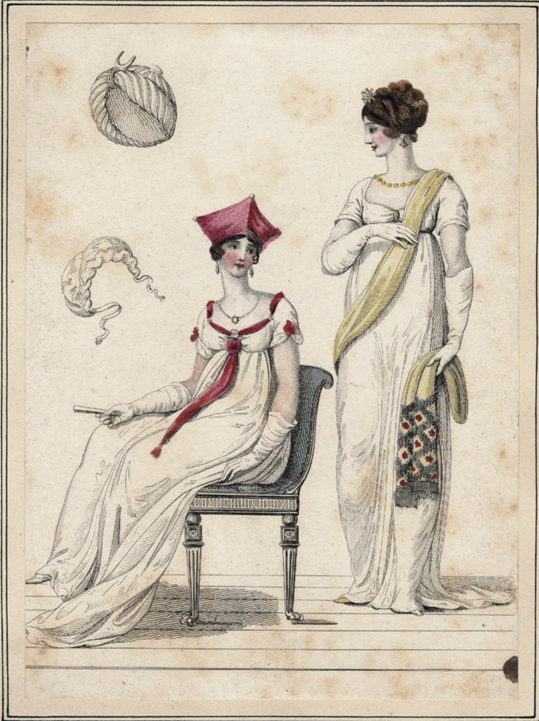
La Belle Assemblée