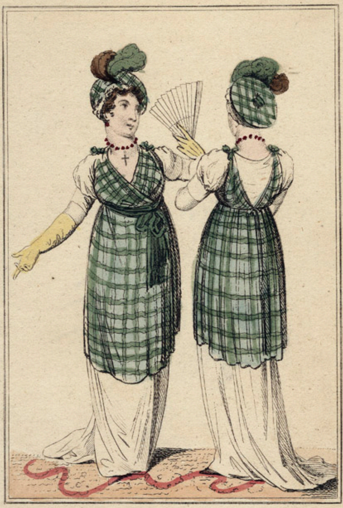
Afternoon Dress for Feb. 1801.