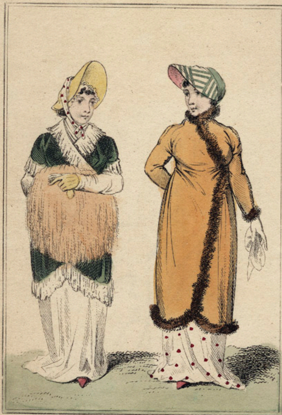
Morning Dress for Feb. 7 1801.

Ladies Museum PUBLIC LIBRARY LOS ANGELES, CAL.