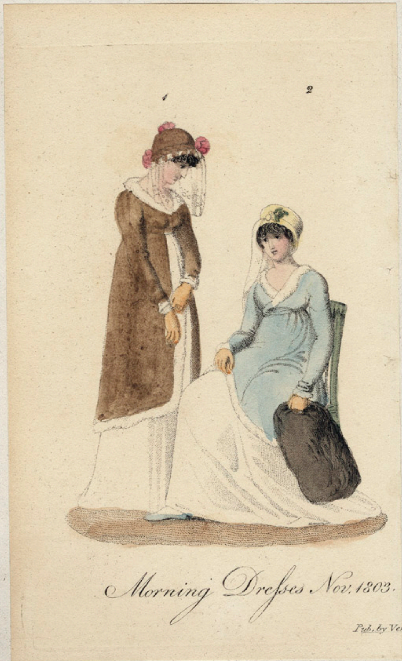
Morning Dresses Nov. 1803.