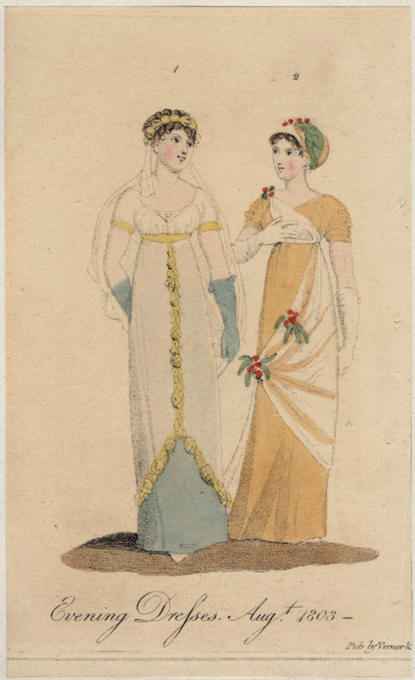
Evening Dresses. Aug. 1803 -