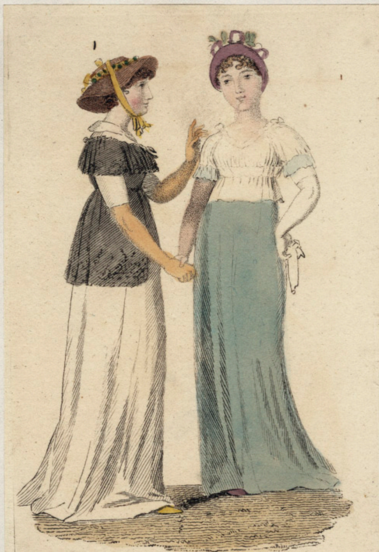
Morning Dress for Oct. 1801. Kepp. Millener, Pall Mall.