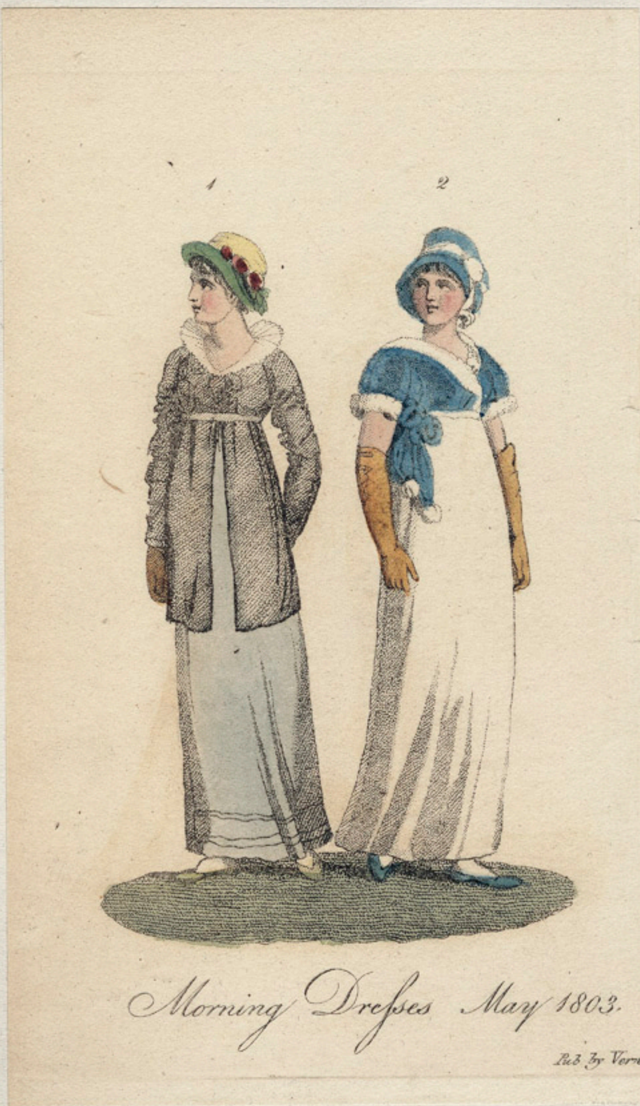
Morning Dresses May 1803.