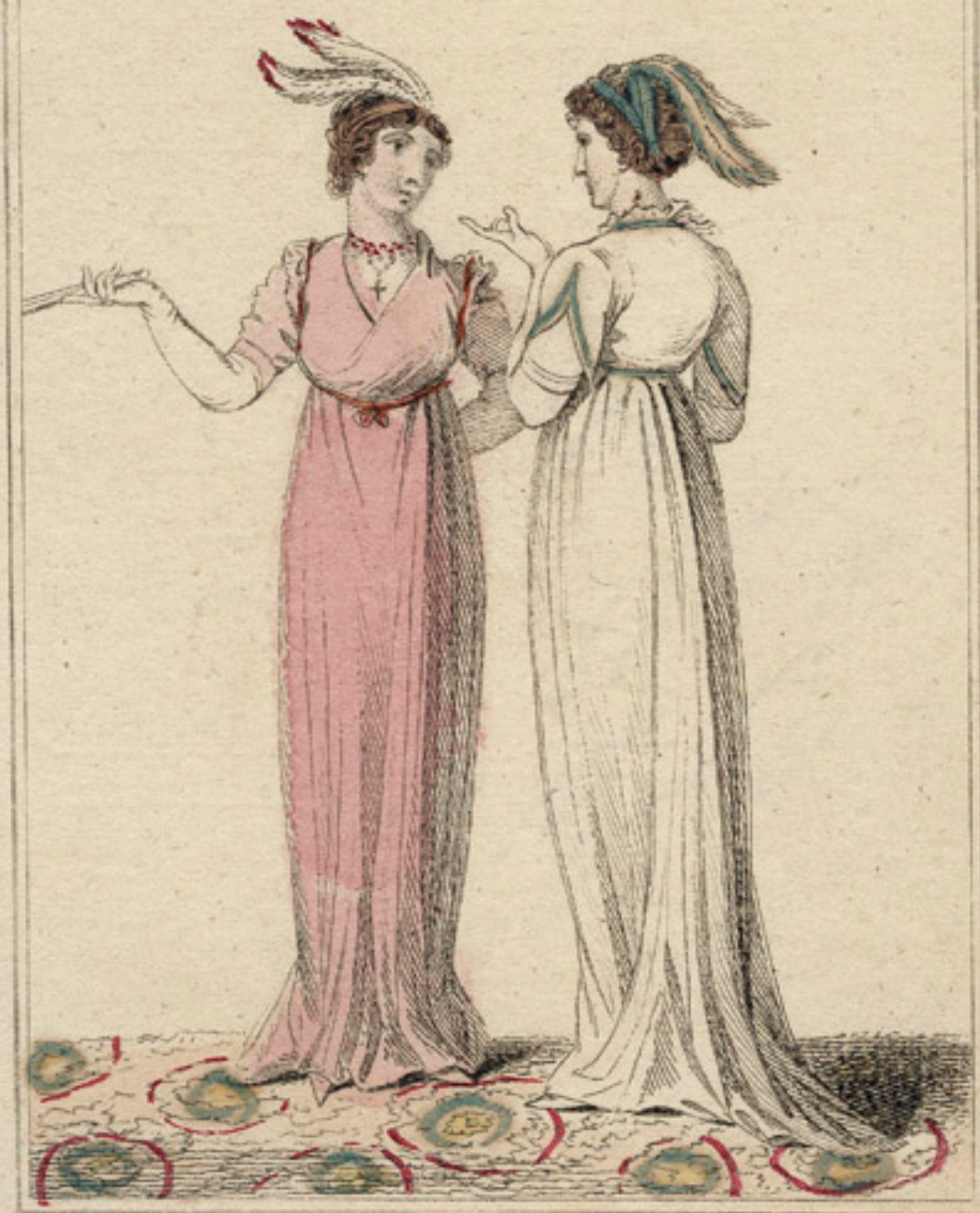
Afternoon Dress for June, 1801.