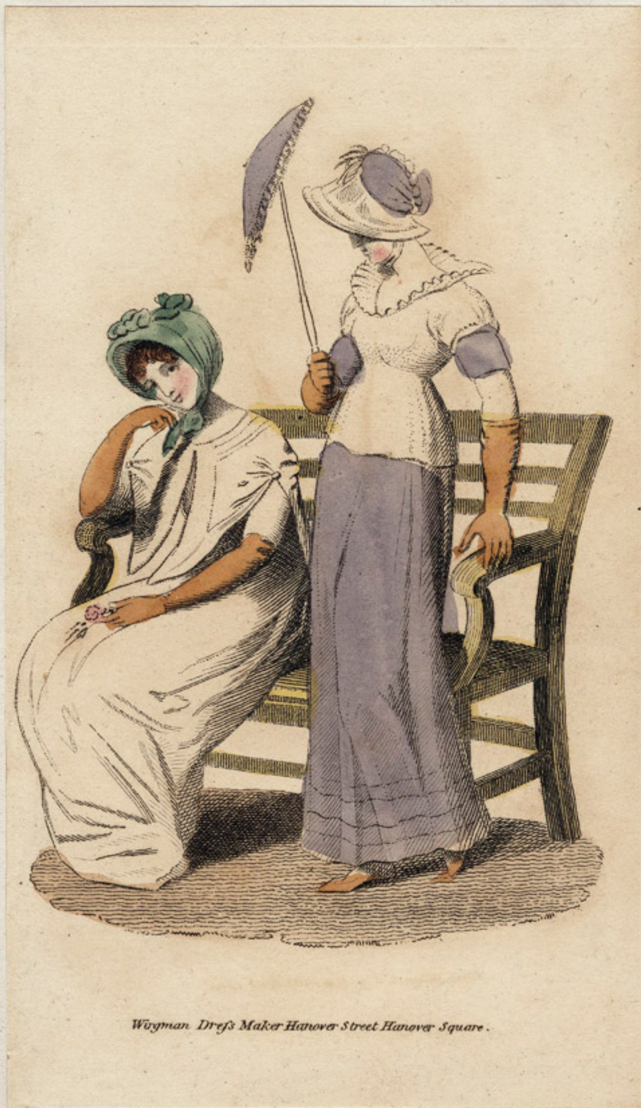
Wigman. Dress Maker Hanover Street Hanover Square.