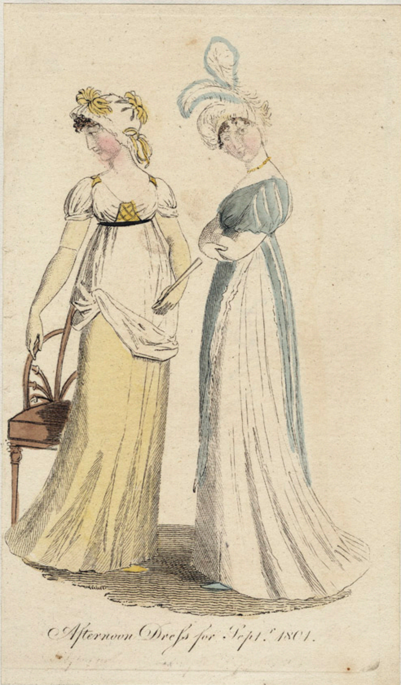
Afternoon Dress for Sept. 1801.