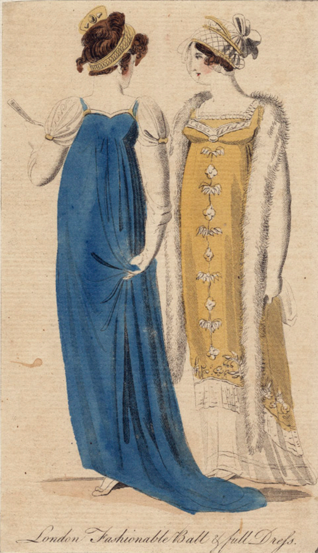
London Fashionable Ball & full Dress.