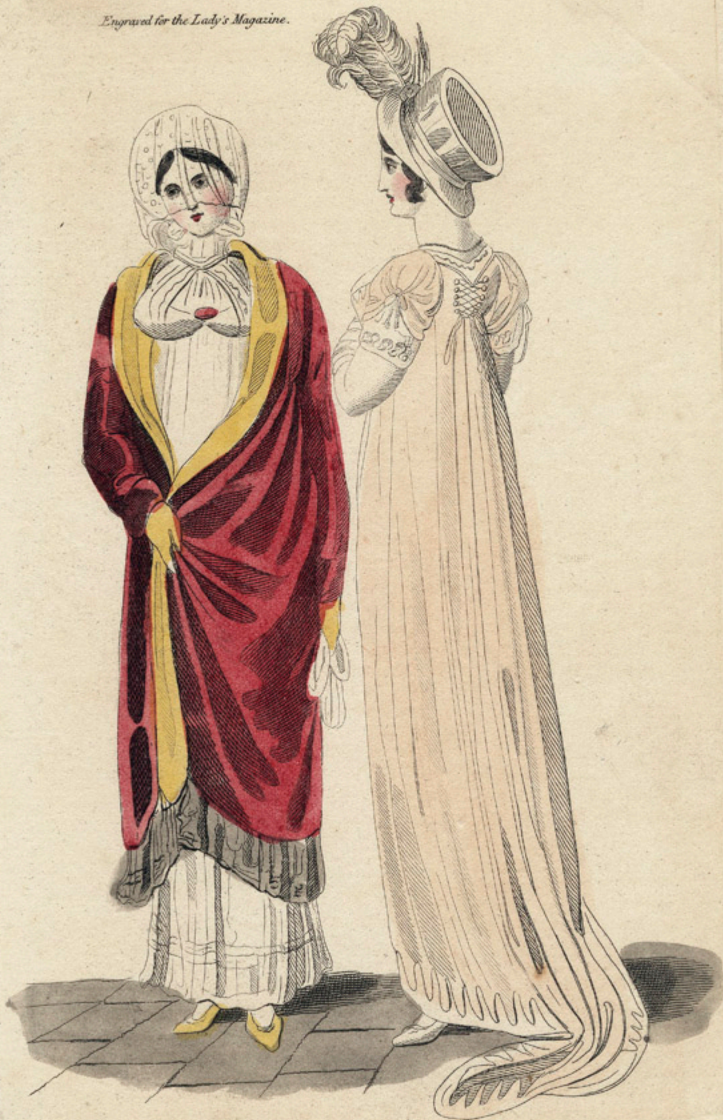
Fashionable walking & full Dress.