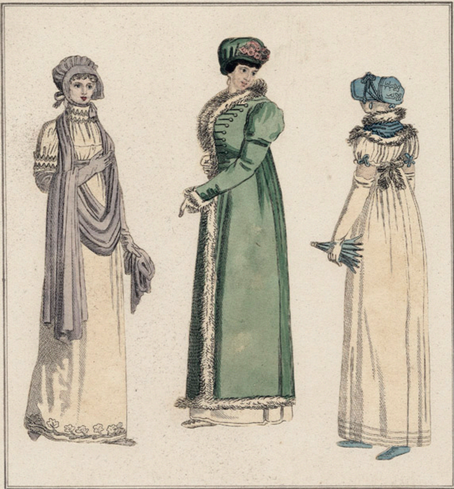
La Belle Assemblée