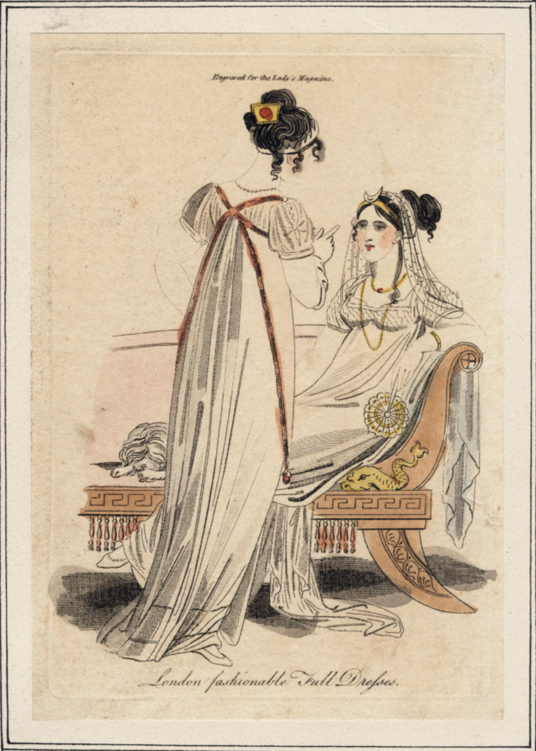
London fashionable Full Dresses.