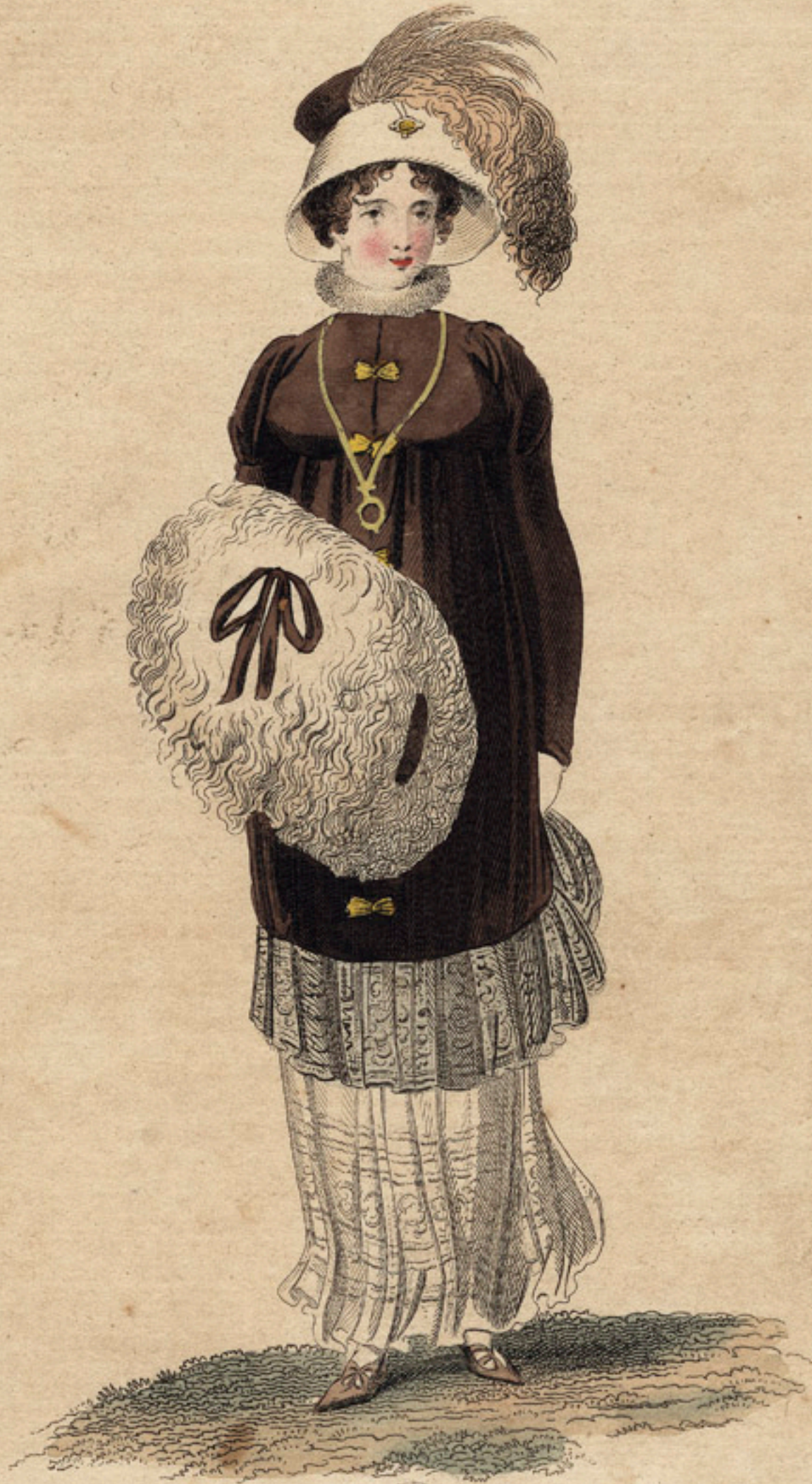
London Walking Dress.

Engraved for the Lady's Magazine March 1805.