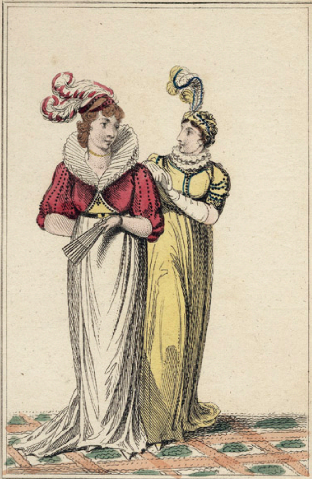
Afternoon Dress for May 1801.