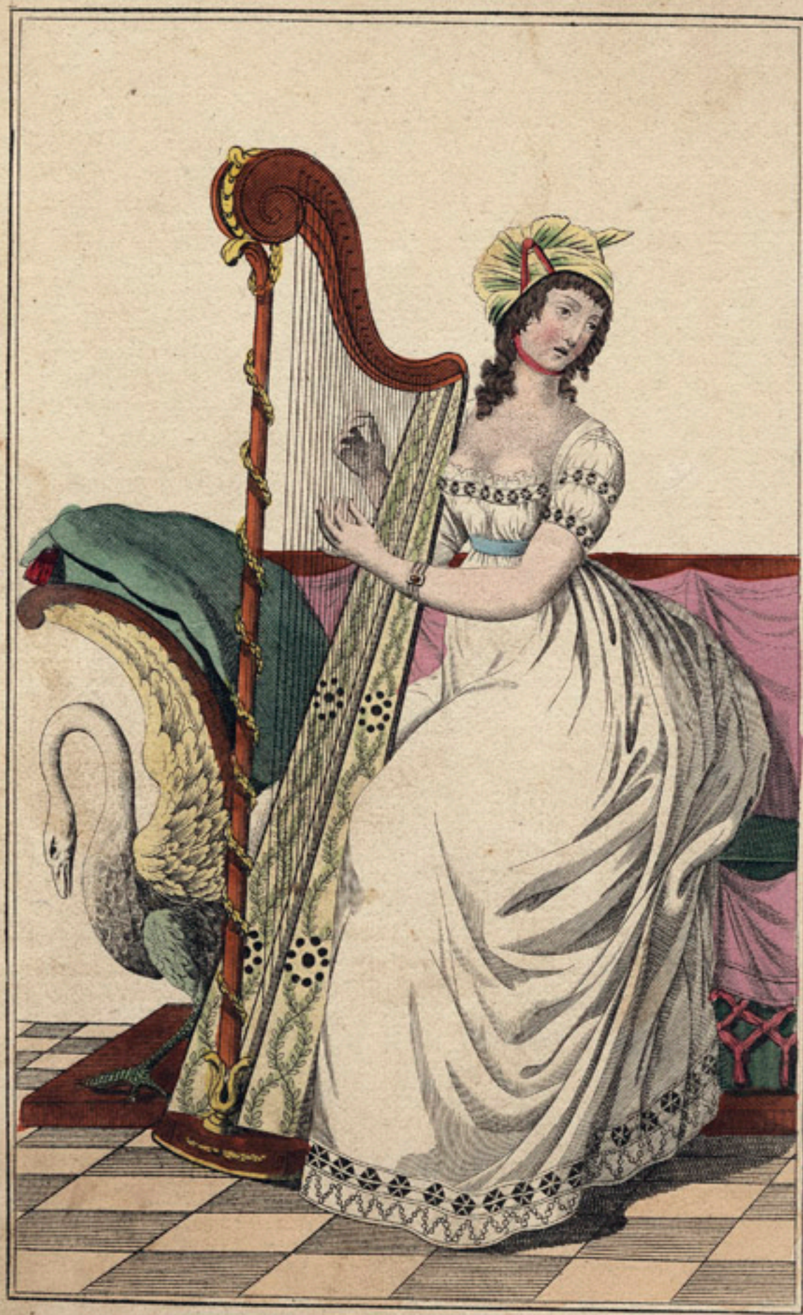
PARIS DRESS. Straw Hat trimmed with Crape.