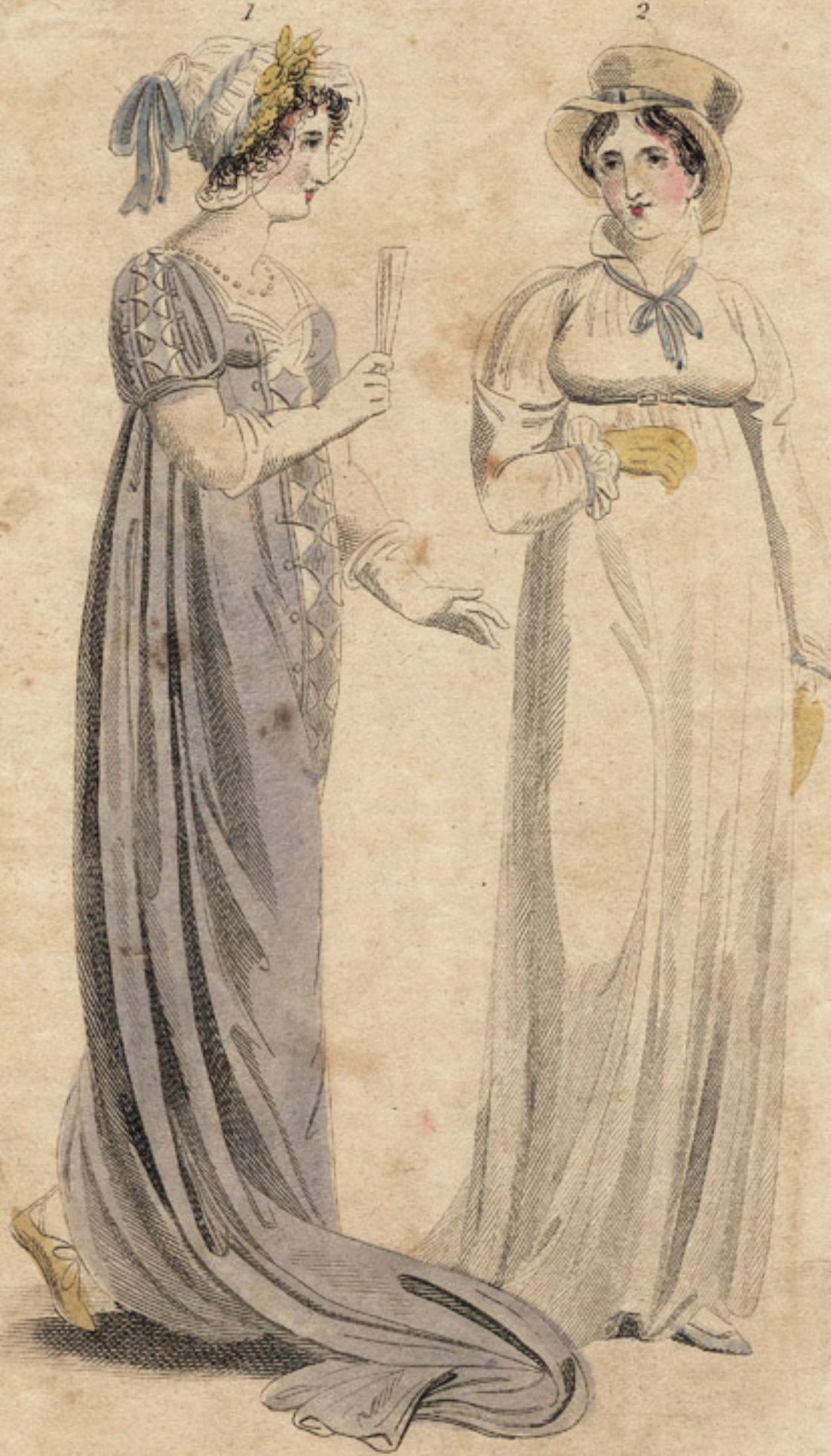
London Walking & full Dress.