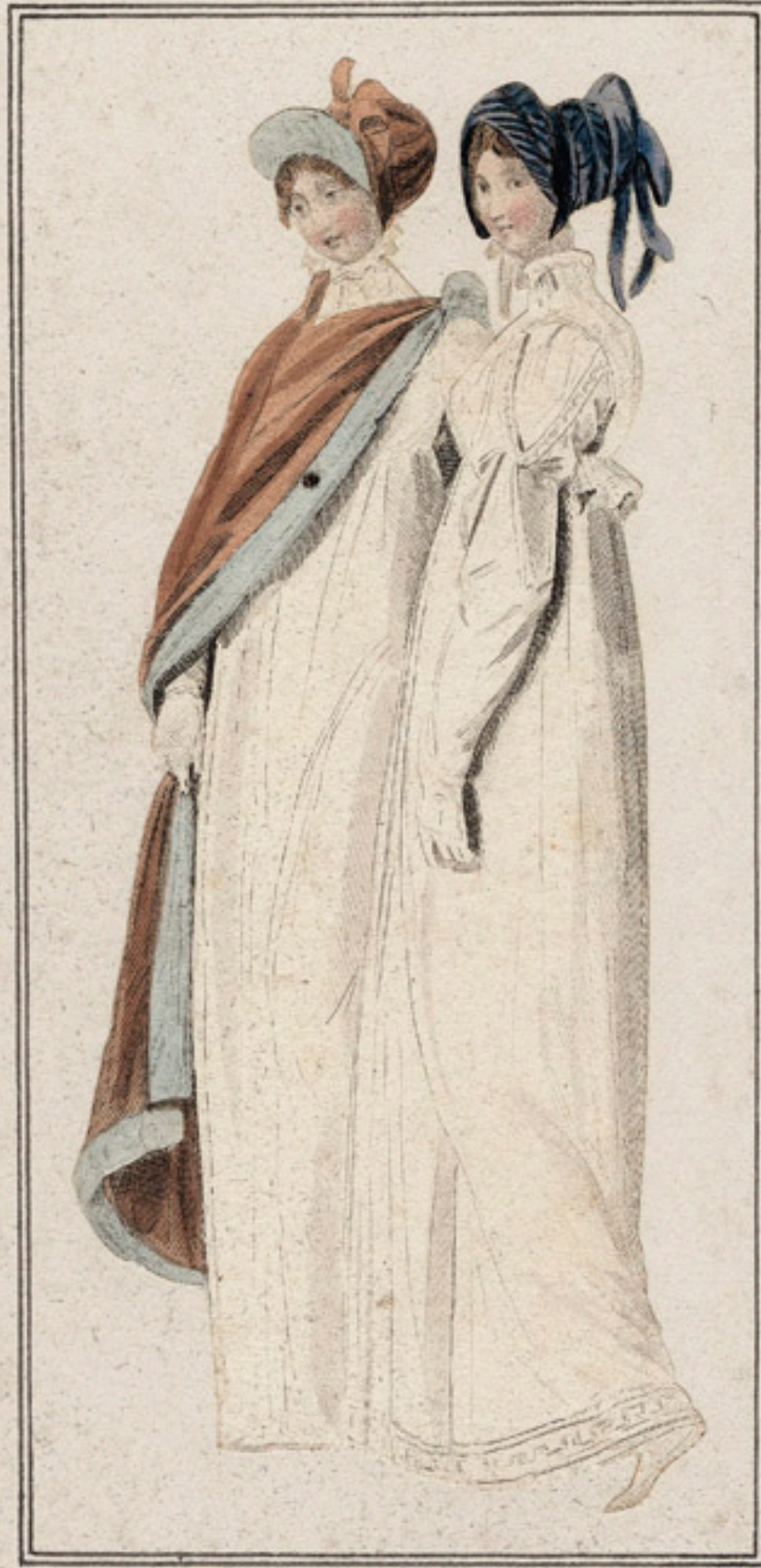
La Belle Assemblée