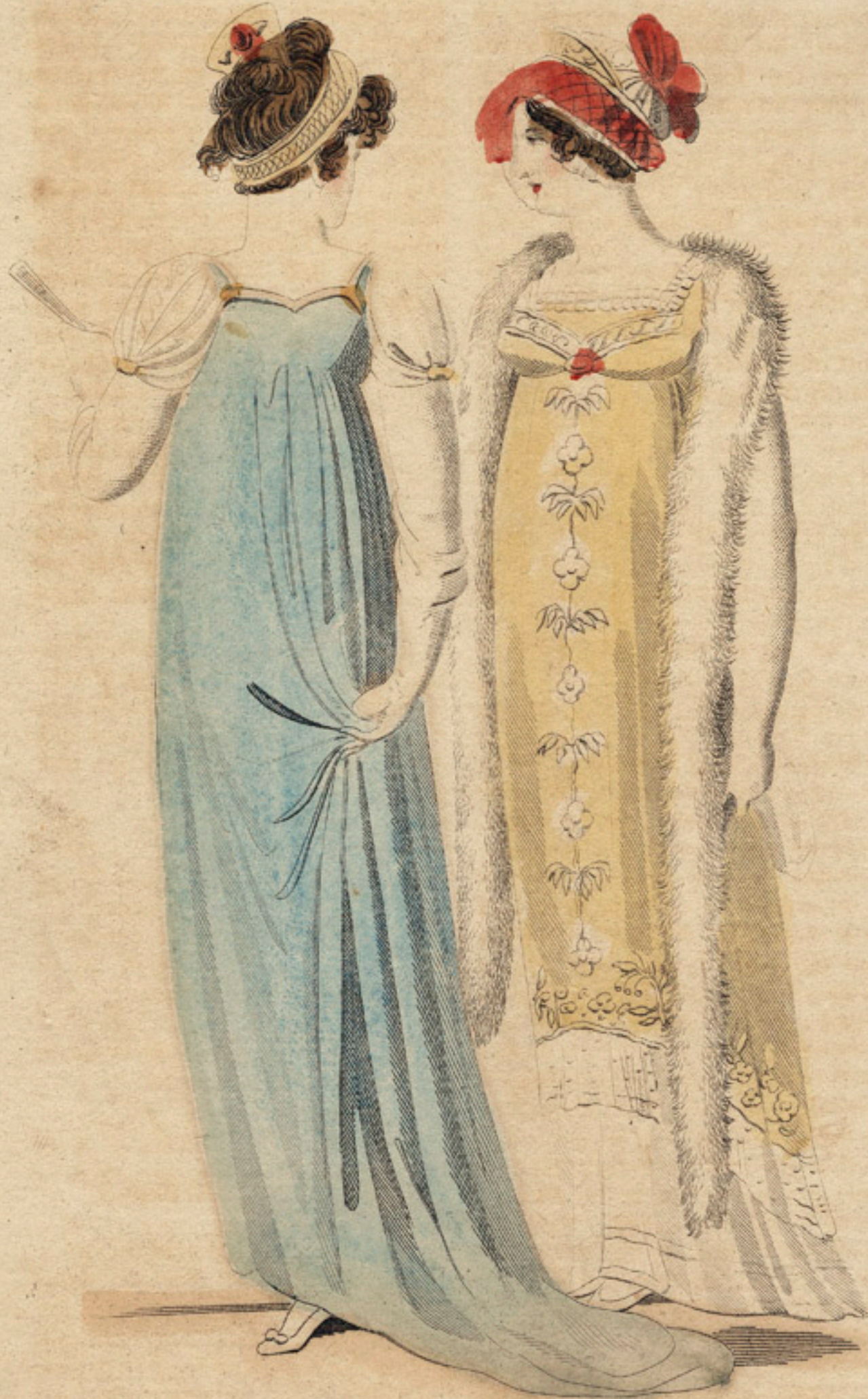
London Fashionable Ball & full Dress.