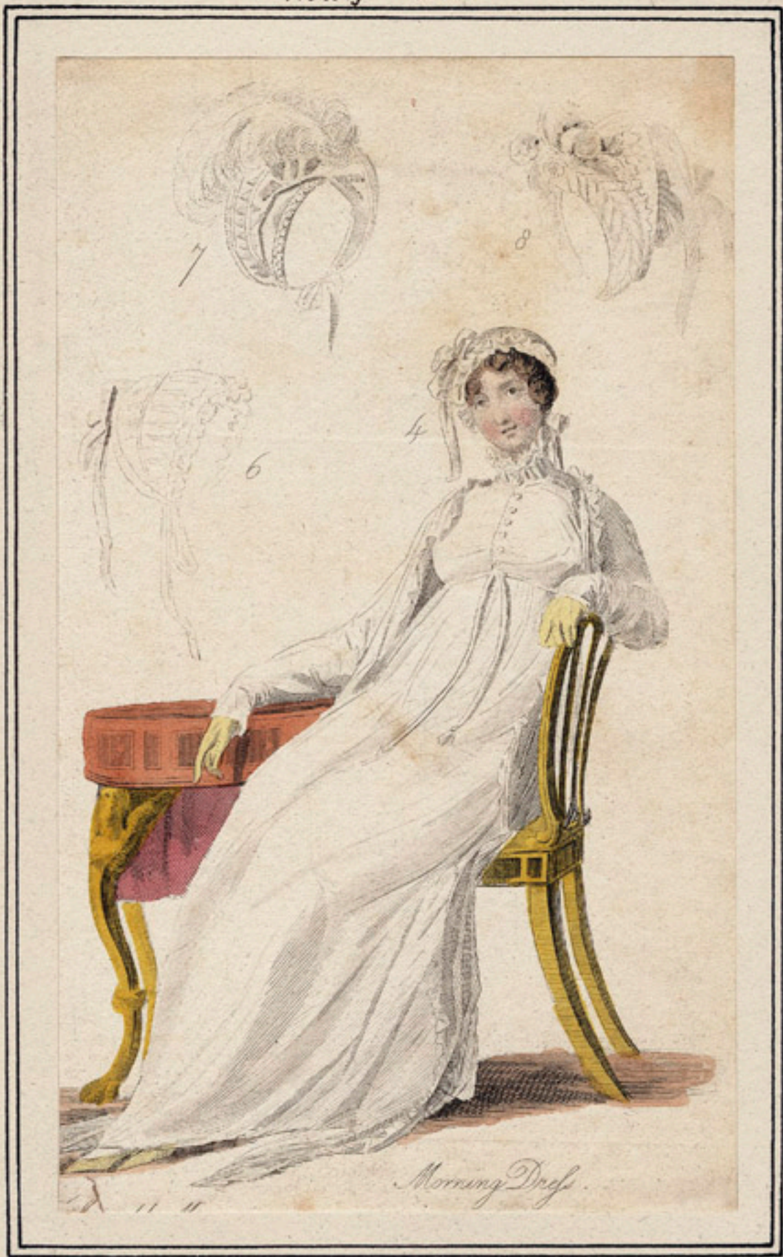
La Belle Assemblée