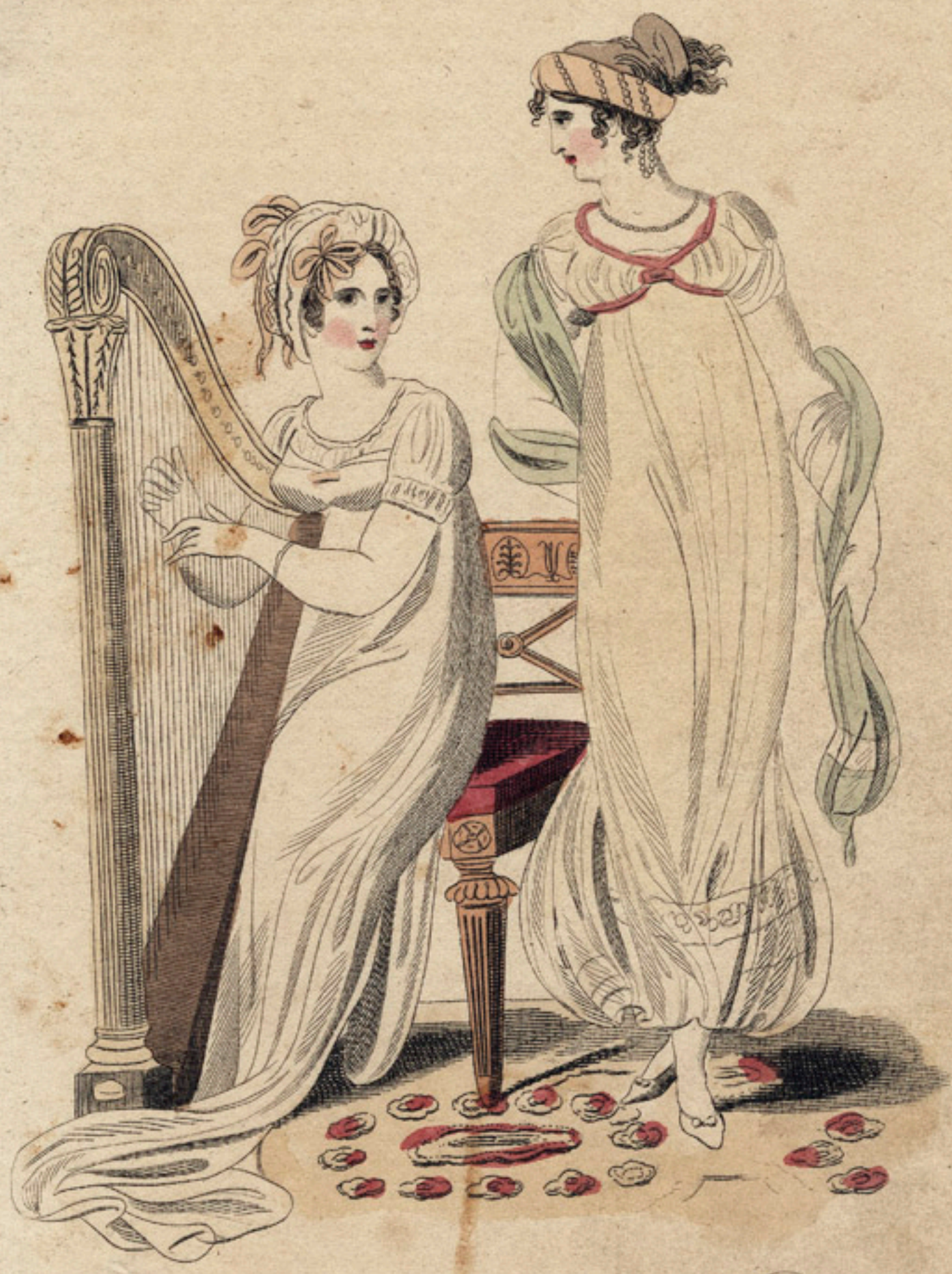
Fashionable Afternoon & Morning Dress.

THE UNIVERSITY OF CHICAGO LIBRARY 1607 AVENUE 530A