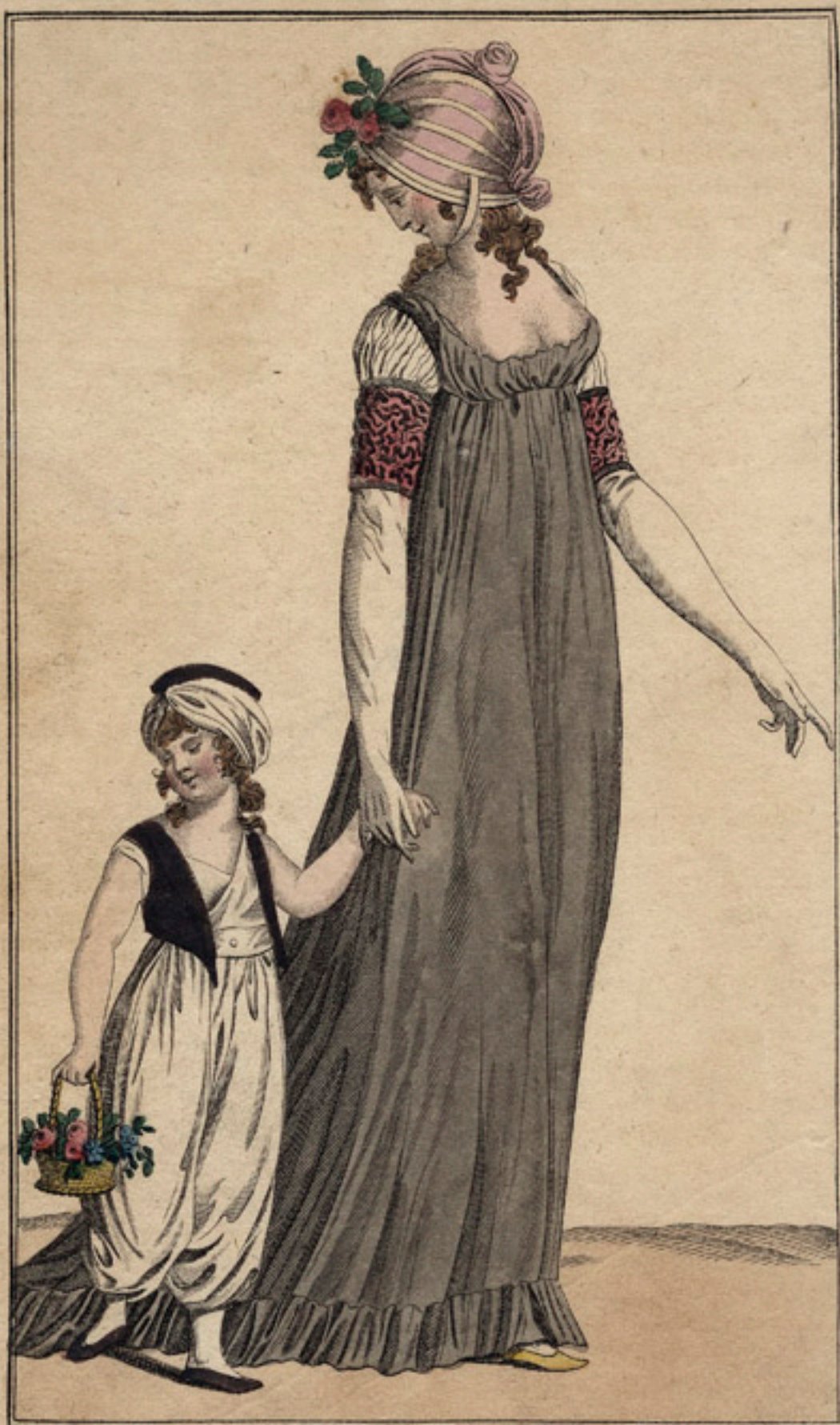
PARIS DRESS Cap-Bonnet trimmed with Amaranthus Crape.