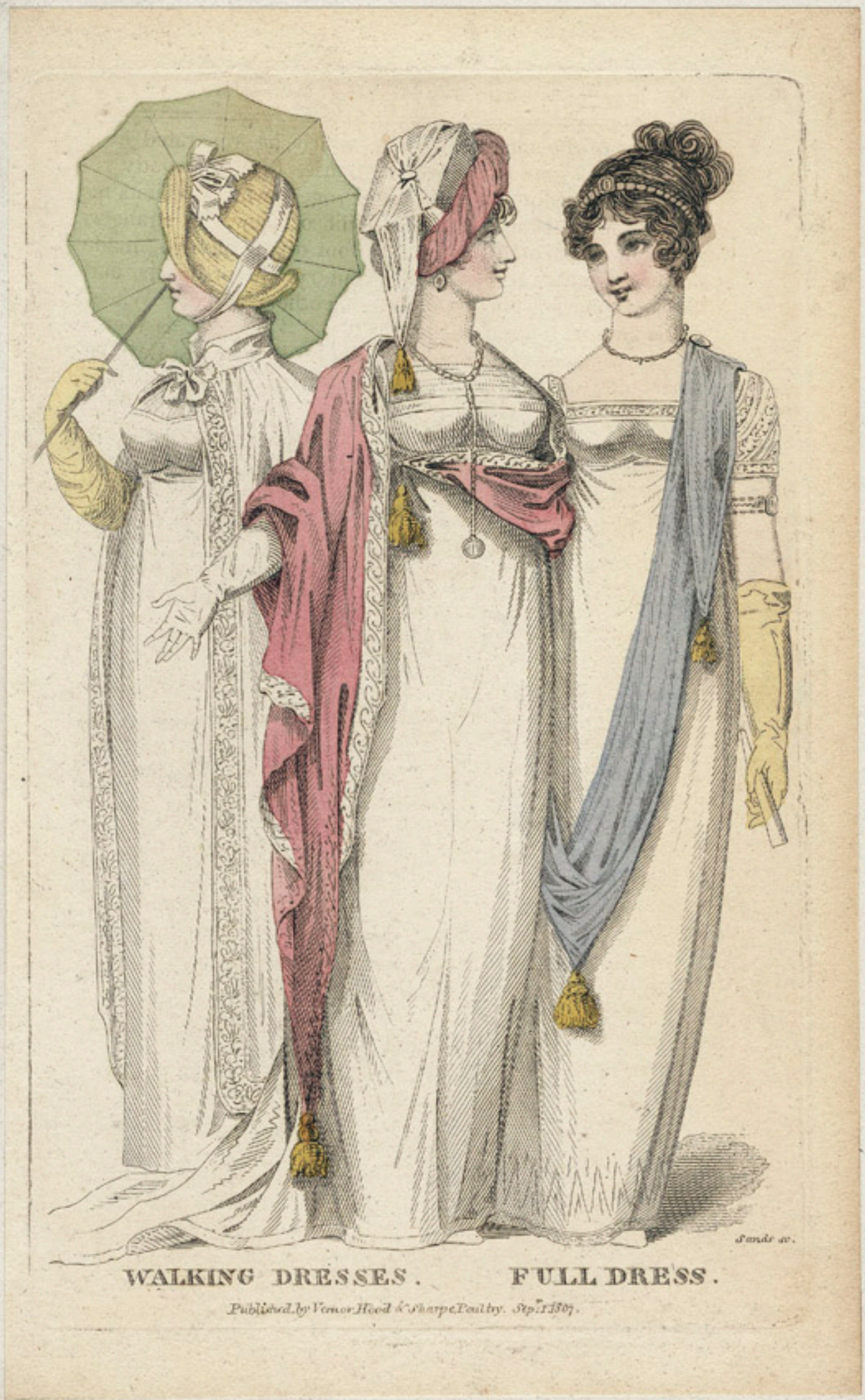
WALKING DRESSES. FULL DRESS.