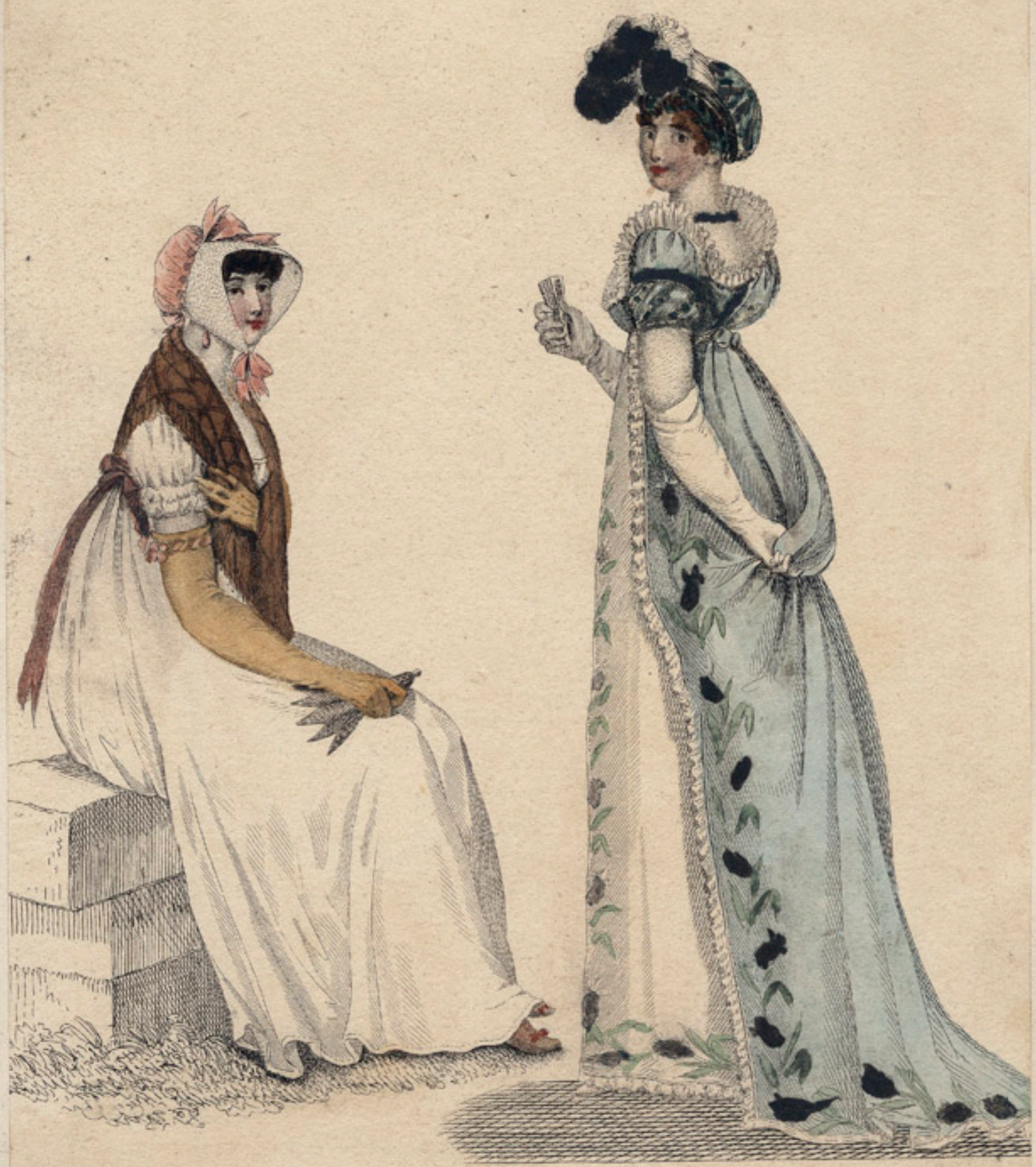
La Belle Assemblée