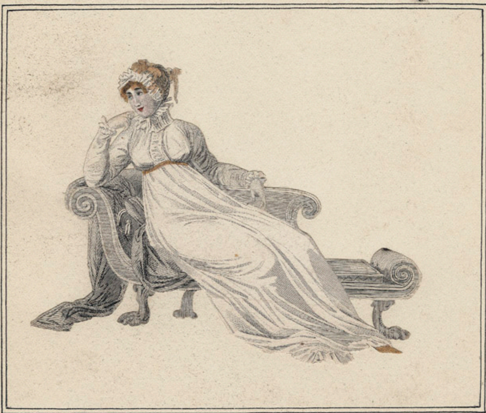
La Belle Assemblée