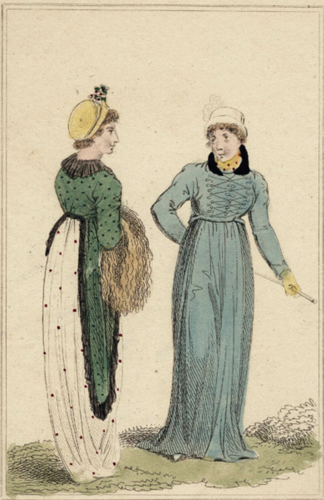
Morning Dress for April, 1801.