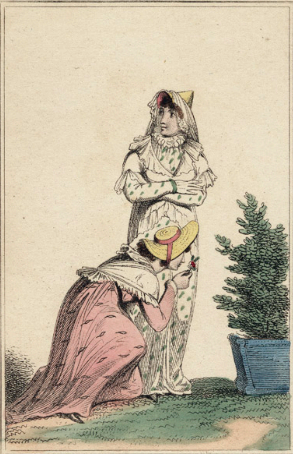
Morning Dress for May 1801.