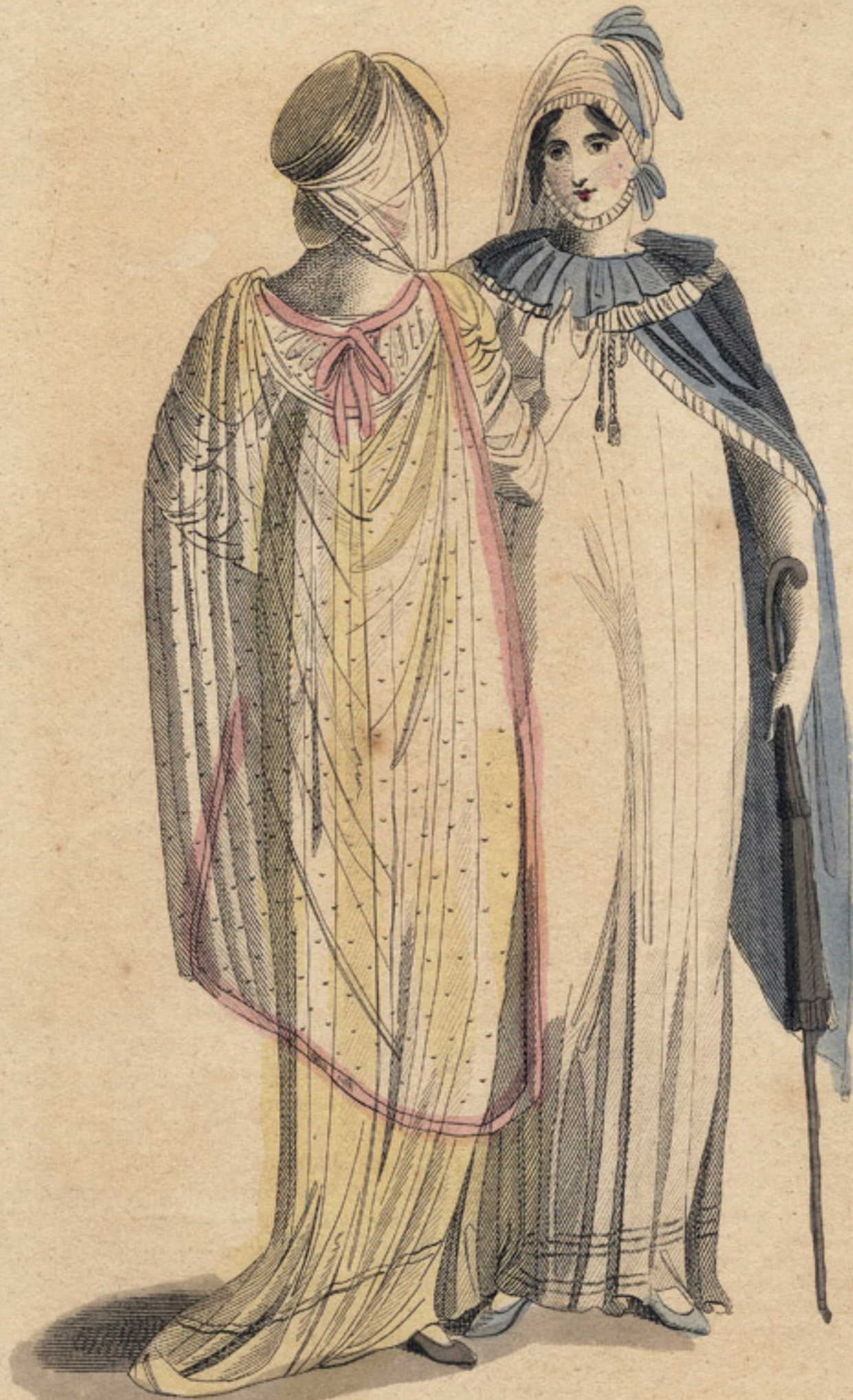
London fashionable Dresses.