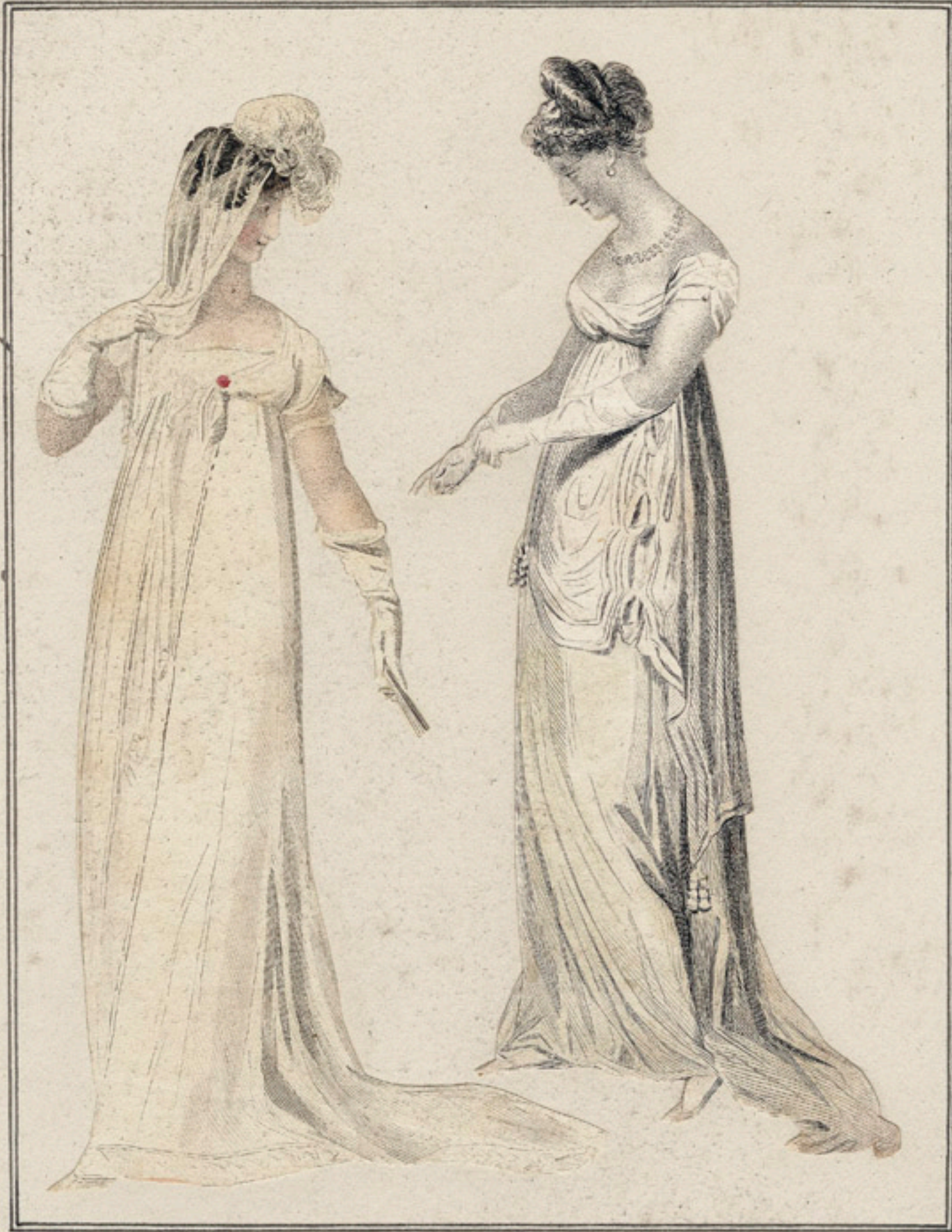
La Belle Assemblée

THE NEW YORK PUBLIC LIBRARY ASTOR LENOX TILDEN FOUNDATION 455 N. 5TH ST. N.Y.C.