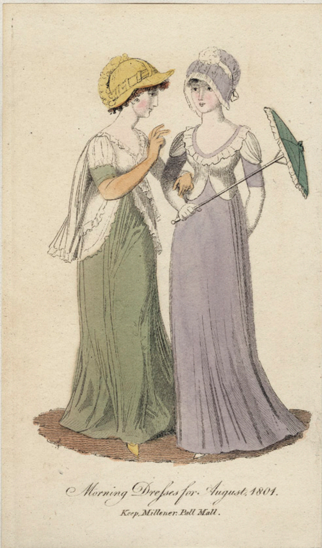
Morning Dresses for August, 1801. Keop, Millener, Pall Mall.