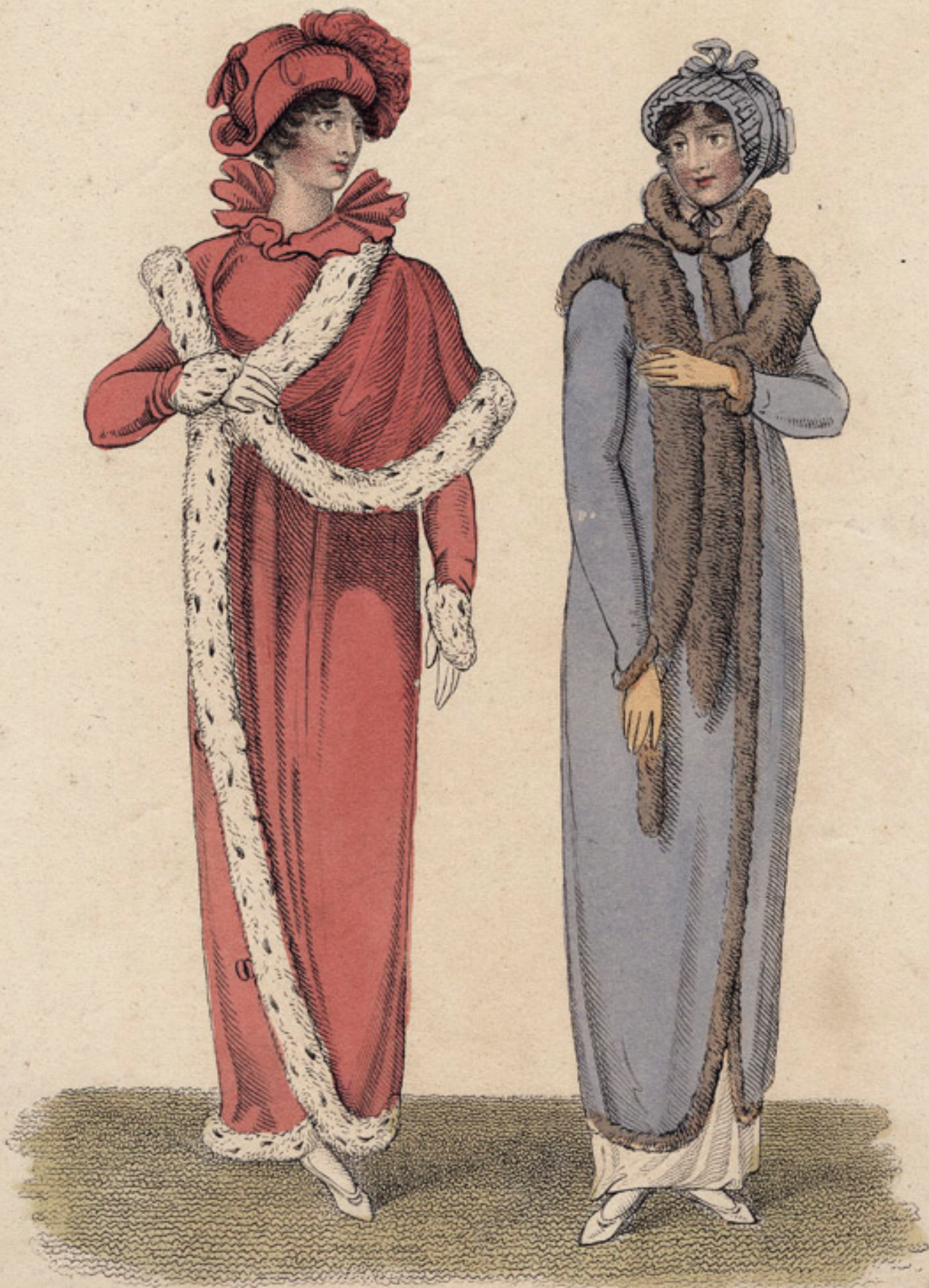
La Belle Assemblée