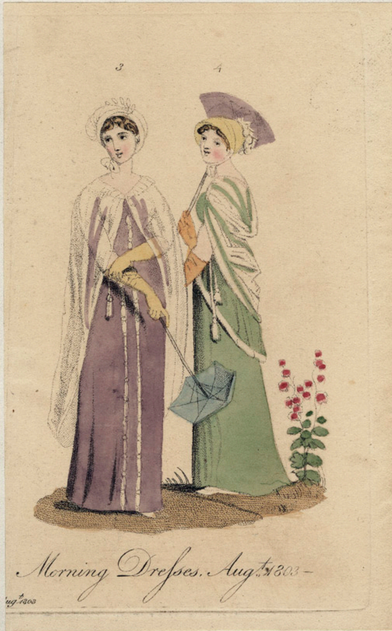
Morning Dresses. Aug t 1803 -