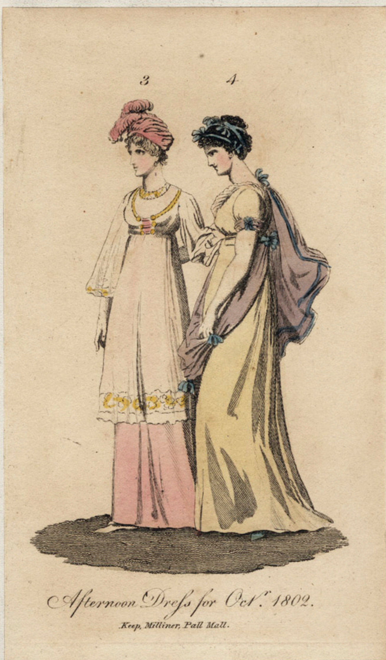
Afternoon Dress for Oct. 1802.