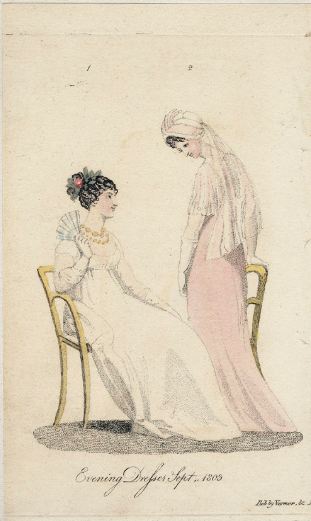
Evening Dresses Sept., 1803