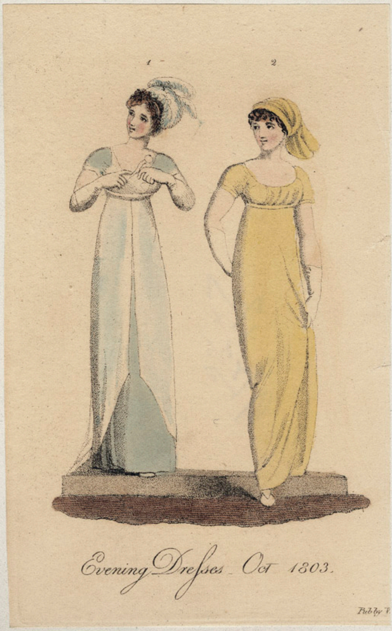
Evening Dresses - Oct 1803.