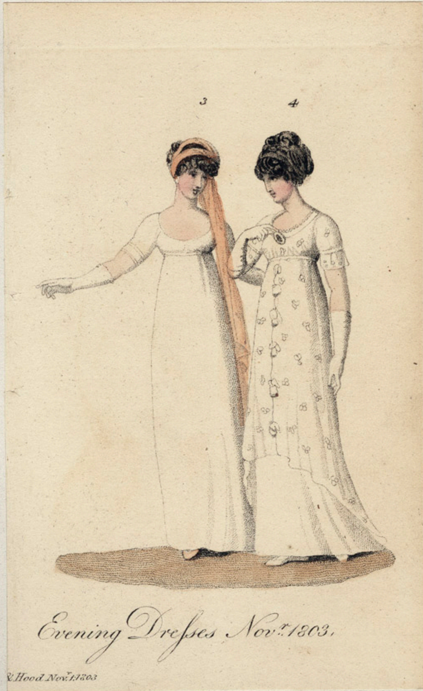
Evening Dresses Nov r 1803.