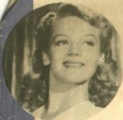
MARTHA O'DRISCOLL OF PARAMOUNT