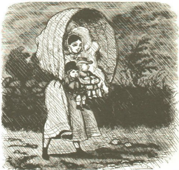
REMARKABLE CONVENIENCE OF HOOPS FOR YOUNG MOTHERS IN THE COUNTRY.