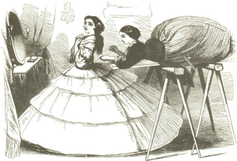
NEW CONTRIVANCE FOR LADY'S MAIDS, ADAPTED TO THE PRESENT STYLE OF FASHIONS.