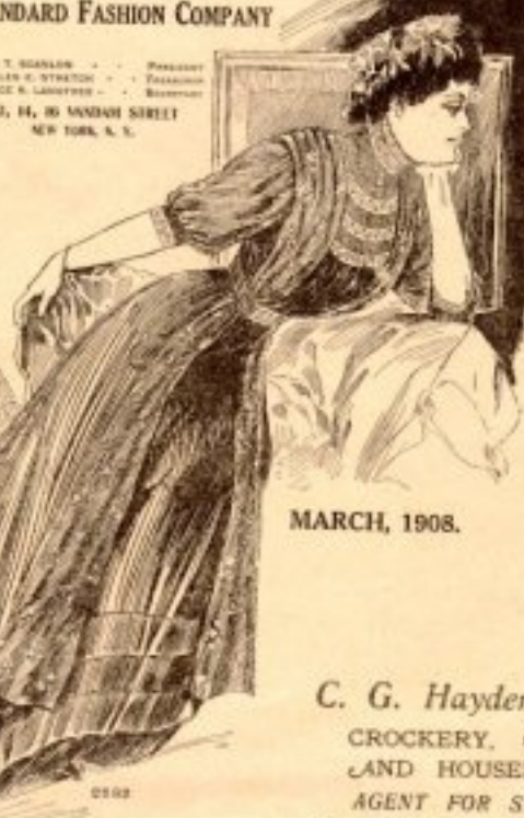
Illustration and additional on Page 5.