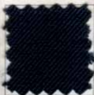
1438 Substantial Blue Serge