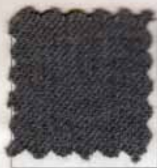
1425 Gray Serge