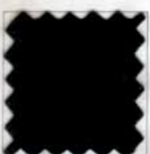
1477 Choice Black Thibet