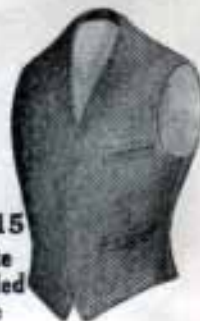
115 White Corded Edge