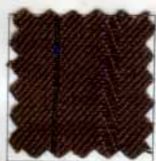
1429 Manhattan Brown Suiting

SEND US YOUR ORDER WITH FULL CONFIDENCE. This great tailoring company is known everywhere as "Chicago's Finest Wholesale Tailors." We have been in the fine tailoring trade for many years and have hundreds of thousands of pleased customers extending into every state. You can ask any bank, any railroad line, any express company, or any business man in Chicago about us, and they will tell you this is a reliable company in every respect, doing a big business and giving full satisfaction to every customer. You can send us your order and money with perfect safety and confidence.