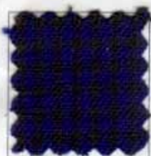
1428 Fancy Blue Check