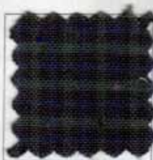
1403 Fancy Check