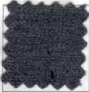
1455 Select Gray Serge