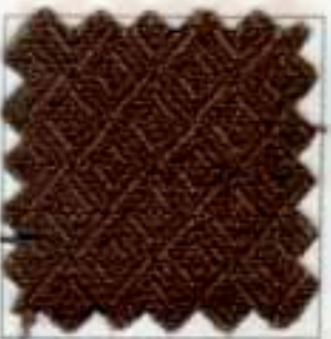
1465 Shaw Mills Fancy Brown