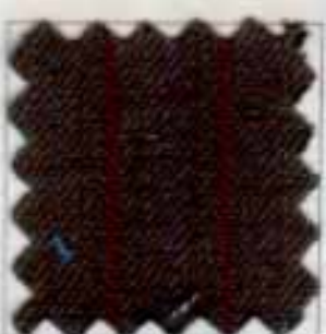
1470 Select Brown Dubbin