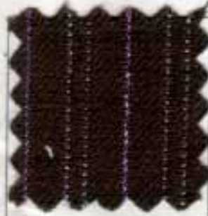
1450 Haslinger's New Weave