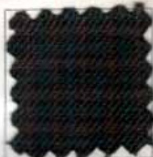
1434 Conservative Check Suiting