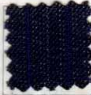
1447 Johnson's New Weave