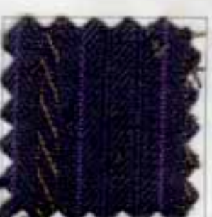
1471 Eureka Mills Select Woested