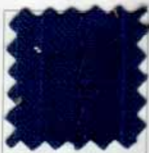
1463 Choice Blue Woested