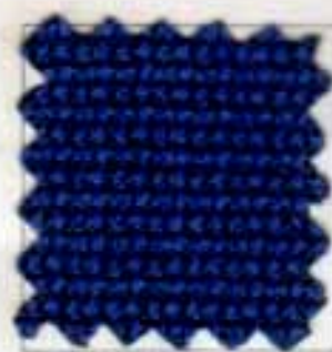
1482 Fancy Blue