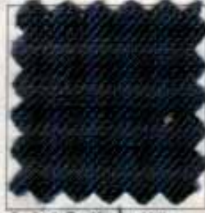
1448 Hudson Mills Worsted