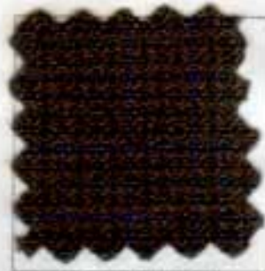
1486 Famous Mills Fancy Brown