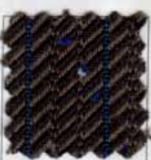
1407 Salem Mills Worsted