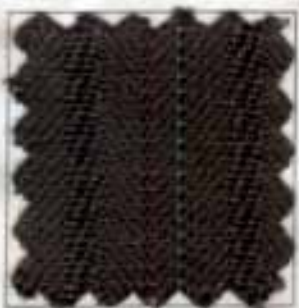
1436 Stover Mills Brown