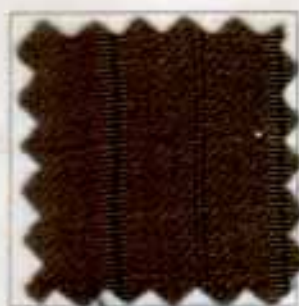
1474 Latest Fancy Brown