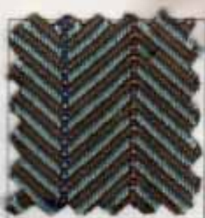
1410 Hunt's Herringbone