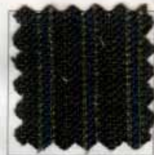
1439 Williams Select Suiting