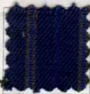
1419 Popular Fancy Blue