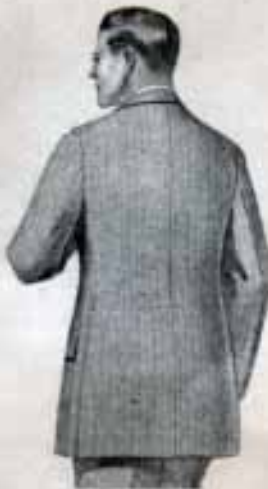
Form Fitting Back