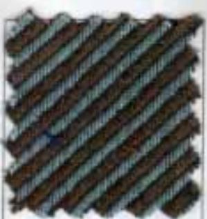
1406 Overman Mills Suiting