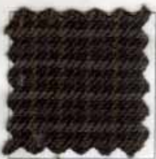
1427 Brown Check