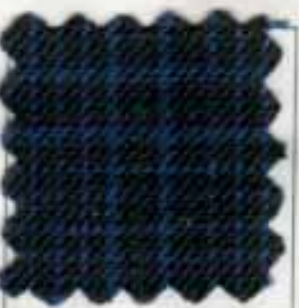
1437 Othello Mills Suiting