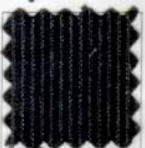
1464 Strous's Choice Wears