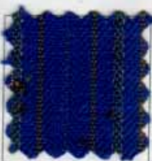
1417 Andrew's Fancy Blue