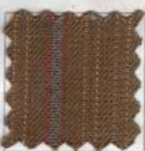
1411 Rich Brown