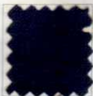
1469 Fine Blue Serge