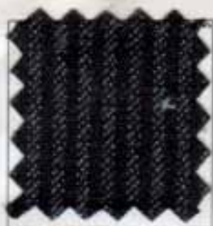
1400 Striped Worsted