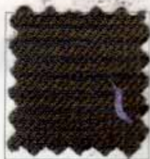
1458 Handley Mills Woested