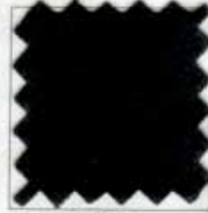
1489 Choice Black Desein

THE Government does not allow us or any other tailoring house to make DOUBLE-BREASTED or NORFOLK styles this season. This is a War rule, to save cloth goods for our soldiers and sailors and Government employes. The styles shown in this book are the only styles the Government permits us to make. Do not ask for DOUBLE-BREASTED or NORFOLK styles, because we cannot make them this season.