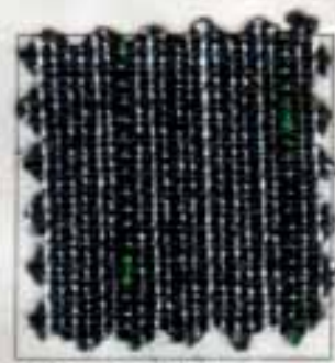
1444 Ardmore Fancy Mixture