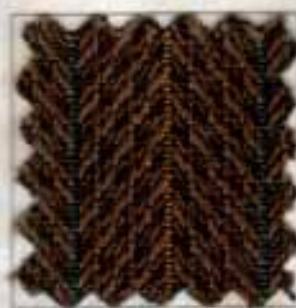
1446 Oakley's Fancy Brown