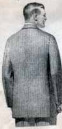
Medium Fitting Back