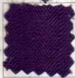
1454 Ayer Mills Bright Blue