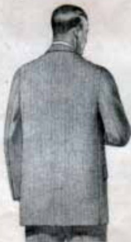
Loose Box Back