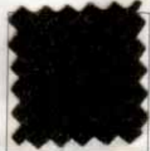
1445 Choice Black Tibet