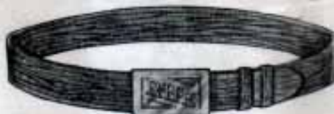
36 BB—Leather Belt

Made to order with your own initials on. Handsome gilded metal buckle. Everyone needs a belt, must have one, so be sure to include one in your order.