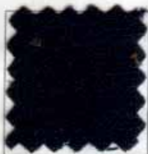
1457 Special Blue Serge

BUY THE BEST GOODS YOU CAN AFFORD, it is cheapest in the end. War conditions have cheapened quality in every line. A dollar now won't buy more than 75c before the war. Cheap trashy goods are not worth the price asked. Our prices are not as low as before the war, but we do guarantee them the lowest in our line today, considering the extraordinary conditions. WE URGE YOU TO SELECT THE HIGHER PRICE GOODS, the best you can afford, as being true economy.