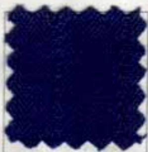
1433 Fancy Blue Worsted