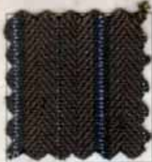
1418 Allen Mills Suiting