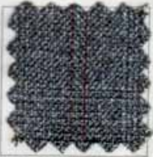
1472 Calumet Choice Mistee