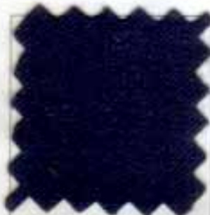
1488 Select French Back Blue Serge