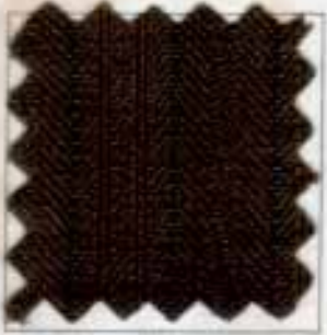
1481 Weaver's Best Brown