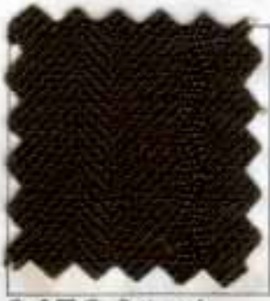
1456 Patterson's Select Brown