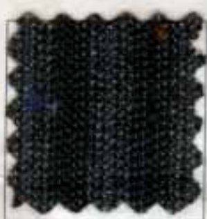
1424 Waverly Worsted