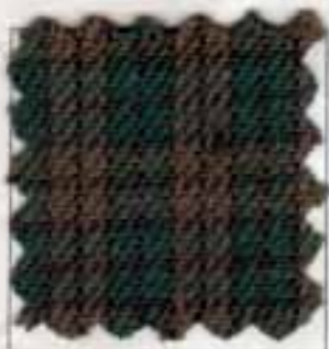
1420 Ashley's Suiting