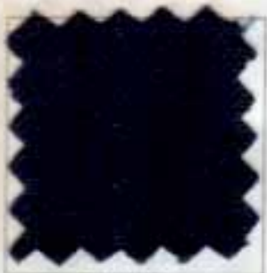
1478 Hay's Fancy Blue