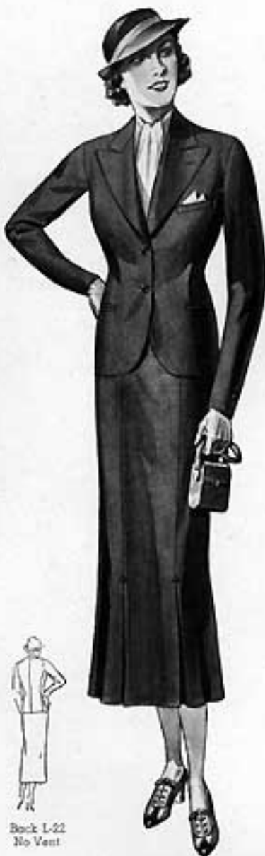
Back L-22 No Vent

Long roll peaked lapel regular flap pockets