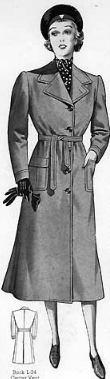
Back L-24 Center Vent