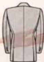
Back of 108 Side Vents

The favored informal college model, semi-notch lapels. Lower patch pockets with flaps. Back with side vents as shown unless otherwise ordered.