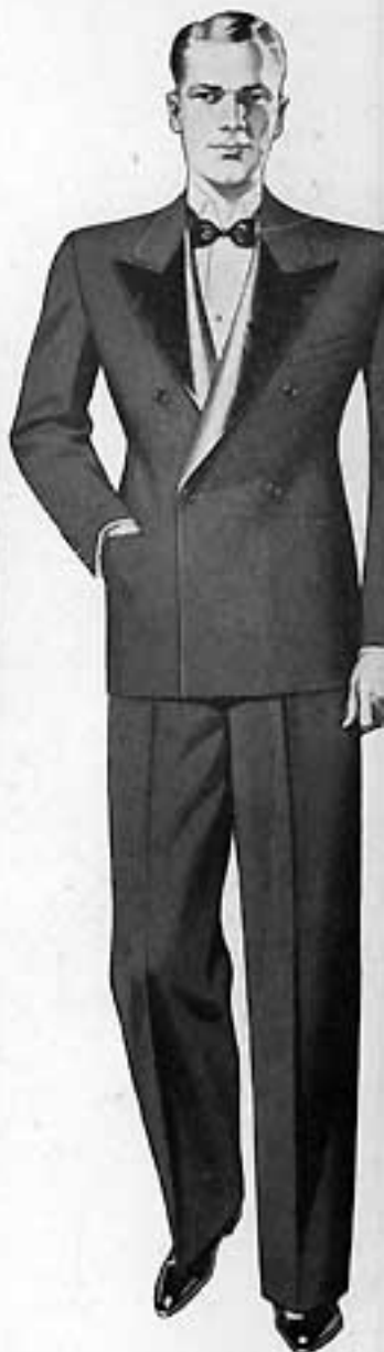
Model No. 189