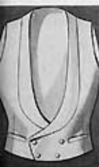
Dress Vest No. 20 Double-Breasted Full Dress or Tuxedo Vest With shawl collar