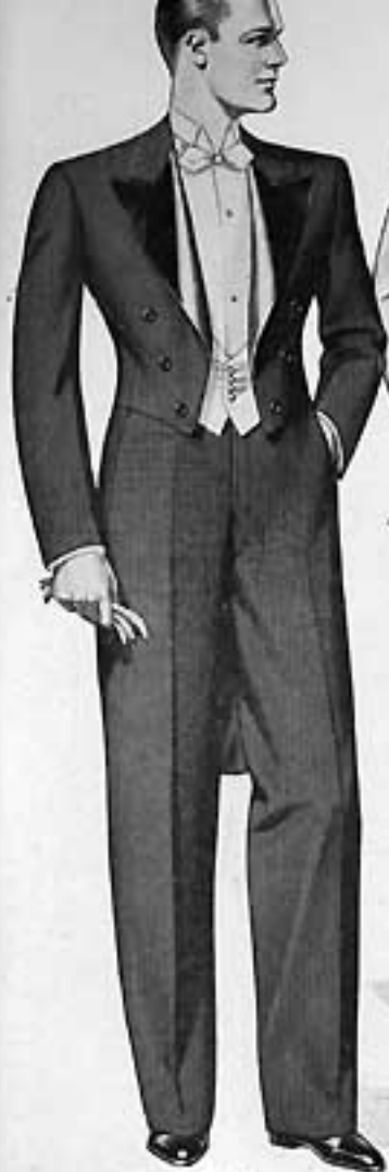
Model No. 124