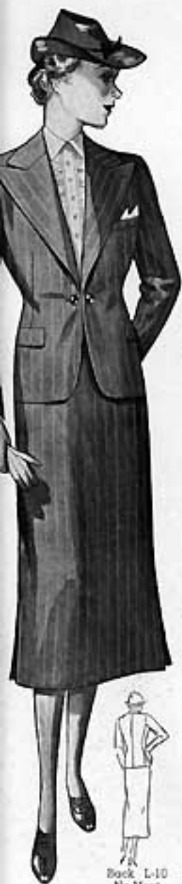
Back L-10 No Vent

We do not carry any special fabrics — Order from cloth shown in line.