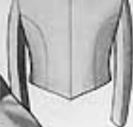
Back of No. 199