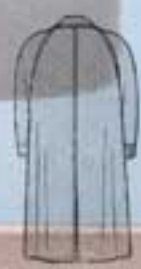
Back of 142 and 143 Center Vest