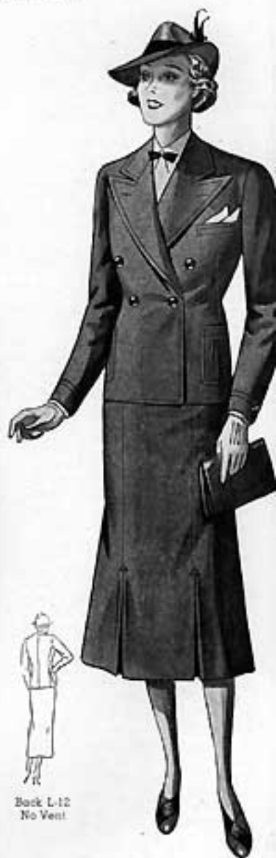
Back L-12 No Vent