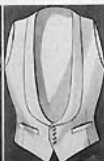
Dress Vest No. 23 Single-Breasted Full Dress or Tuxedo Vest With shawl collar Four buttons