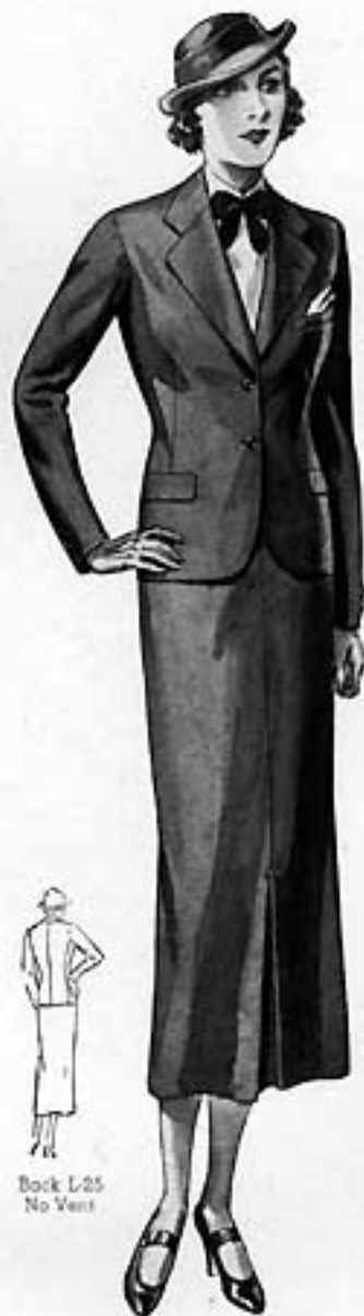
Back L-25 No Vent