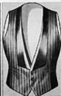
Dress Vest No. 24 Single-Breasted Tuxedo Vest Square shawl collar Three buttons

Collar made with same cloth as vest. If satin collar is wanted, see