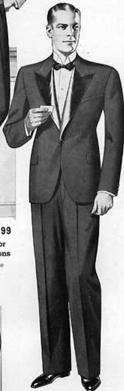
Model No. 122