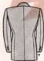
Back of 186 No Vent

Notch lapels and three patch pockets with buttoned flaps, stitched edges. Back as shown unless otherwise ordered.