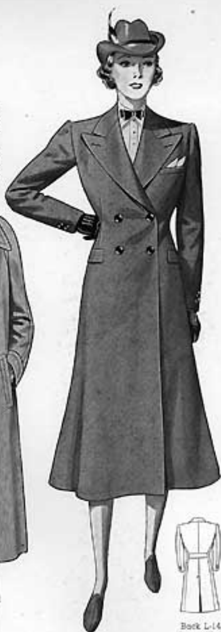
Back L-14 Center Vent

Raglan shoulders. Slash pockets. Cuffs on sleeves.