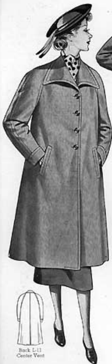
Back L-11 Center Vent

We make only the overcoat models illustrated on this page. Do not ask us to make special styles other than those shown hereon. Order from our regular men's overcoat materials. We do not carry any special fabrics for ladies.