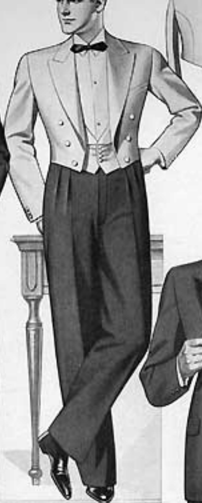
Model No. 199