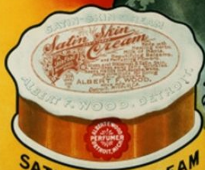
SATIN SKIN CREAM