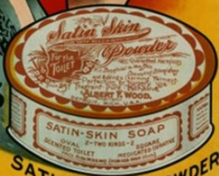
SATIN SKIN POWDER