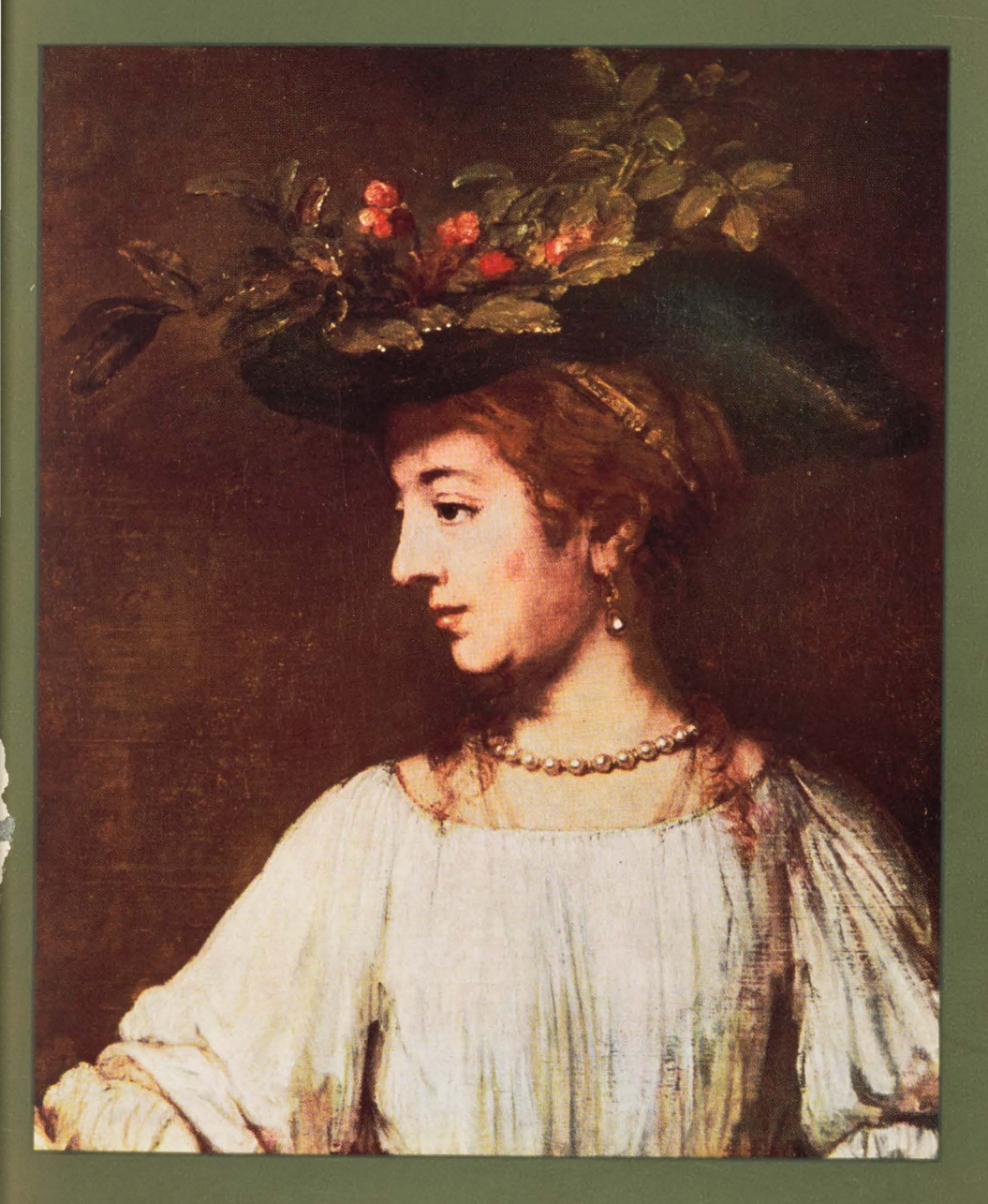
EUROPEAN PAINTINGS IN THE METROPOLITAN MUSEUM