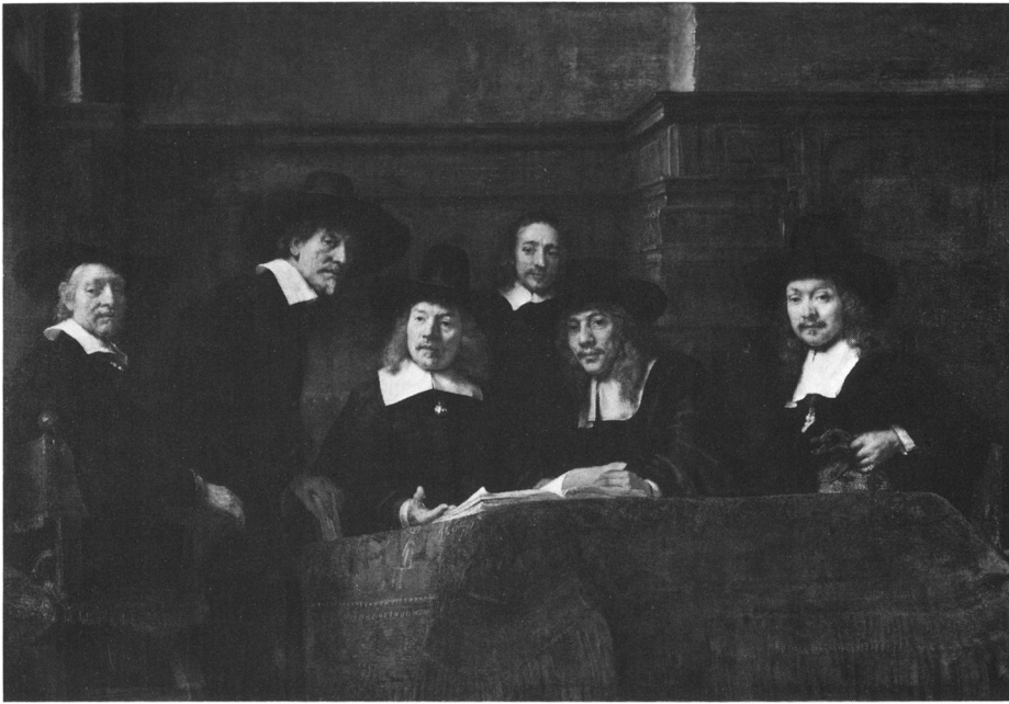
24. The standing figure on the left in Rembrandt's The Syndics of the Cloth Drapers' Guild (1661–62) was possibly inspired by van Dyck's portrait of Lucas van Uffel (fig. 22), which may have been in Amsterdam, where van Uffel died in 1637. Radiographs show that Rembrandt arrived at this pose only after considering another, in which the figure does not look out at the viewer and is much less important to the action of the group. Oil on canvas, 75\frac{3}{8} \times 109\frac{1}{16} inches. Amsterdam, Rijksmuseum

Italy. The intercession of Saint Rosalie, on the other hand, was a theme of immediate, not traditional, interest to patrons in Palermo, and was presumably a greater challenge to the artist.