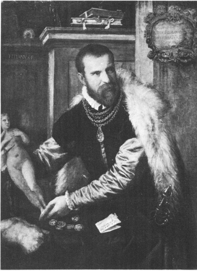
23. Painted in 1567–68, this late portrait by Titian represents Jacopo Strada, the greatest antiquarian of the time. The animated composition may have inspired the dramatic poses in some of van Dyck's portraits, such as the one of Lucas van Uffel (fig. 22). Oil on canvas, 49\frac{1}{4} \times 37\frac{3}{8} inches. Vienna, Kunsthistorisches Museum

lived in Venice and formed an important collection of Italian and Northern paintings. In van Dyck's portrait of van Uffel in the Herzog Anton Ulrich-Museum, Brunswick (fig. 21), the sitter's hand rests on a walking stick; in the background, ships sail off an Italianate coast. This image of a merchant prince is complemented by the Museum's portrait (fig. 22), which presents van Uffel as a man of learning. The antique head and the drawing probably allude to the plastic and the pictorial arts. Music is represented by the recorder and the bow of a viola da gamba resting on it. The celestial globe indicates a knowledge of astronomy, which is essential to navigation; the dividers could either refer to astronomy or to the virtues of prudence or temperance. Van Dyck rarely gave a sitter so many accessories, which suggests that these were at least partly van Uffel's idea.