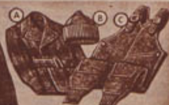
A—Mackinaw B—Turban C—Ski Pants

"Easy-On, Easy-Off" Zipper Anklets for Extra Convenience and Protection