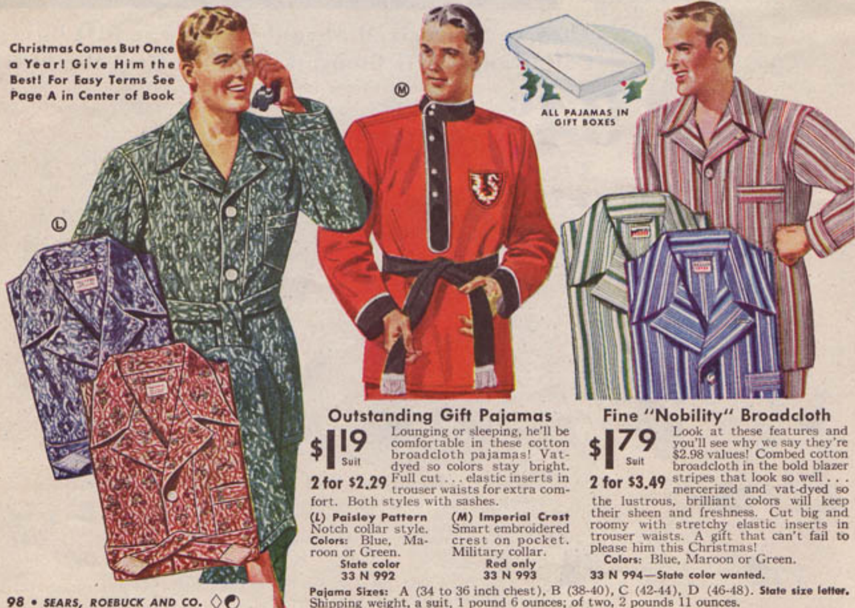
ALL PAJAMAS IN GIFT BOXES

Christmas Comes But Once a Year! Give Him the Best! For Easy Terms See Page A in Center of Book