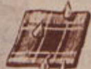
Specially Treated to Repel Rain, Snow