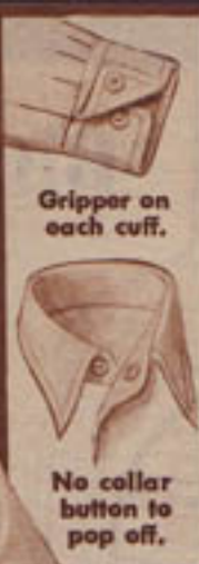
Gripper on each cuff.