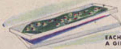
EACH TIE IN A GIFT BOX