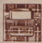
Zip Book Pocket With Waterproof Interlining

Styled for Young Fellows 6 to 18—Available on Terms See Page A, Center of Book