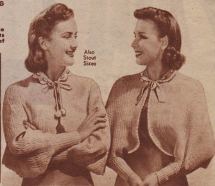
Also Stout Sizes