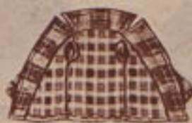
Warm Body Lining of Flannel Cotton Flannel in Rich Plaids