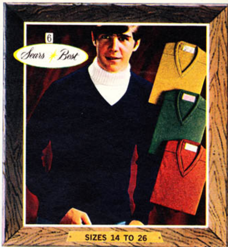
SIZES 14 TO 26

V-neck Cardigan only. State size 14, 16, 18, 20, 22-24 or 26 only. 43 N 23022F—Olive 43 N 23023F—Gold 43 N 23024F—Navy Shipping weight 12 ounces.....$7.99