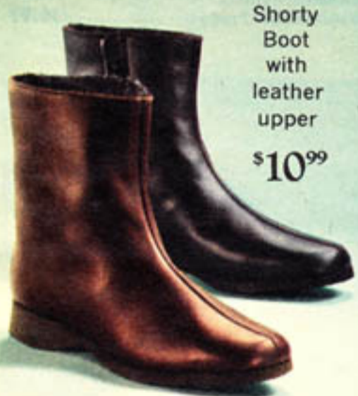
Women's Shorty Boot with leather upper $10.99

And the deep acrylic pile lining makes them extra warm