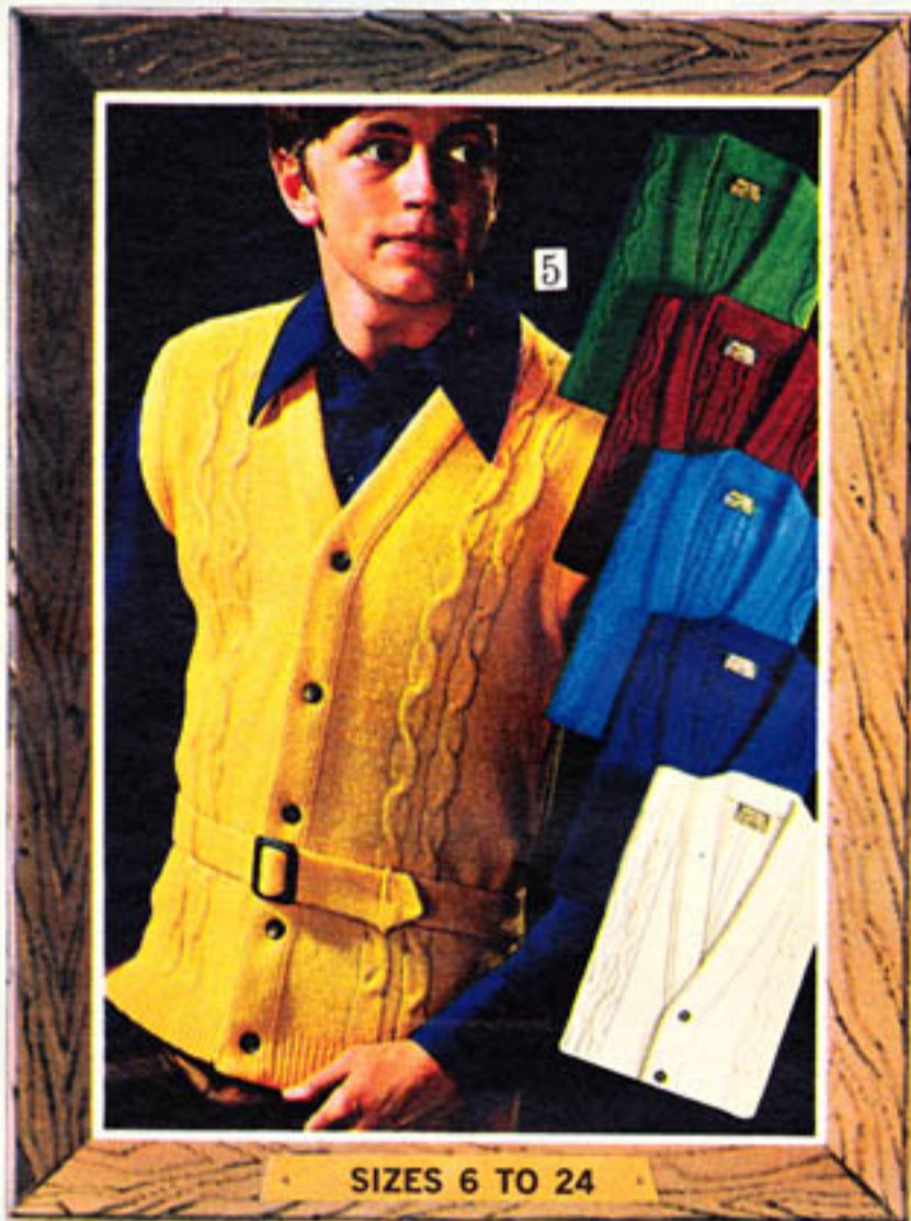
SIZES 6 TO 24

.. a superb collection of styles, textures and colors that boys want most