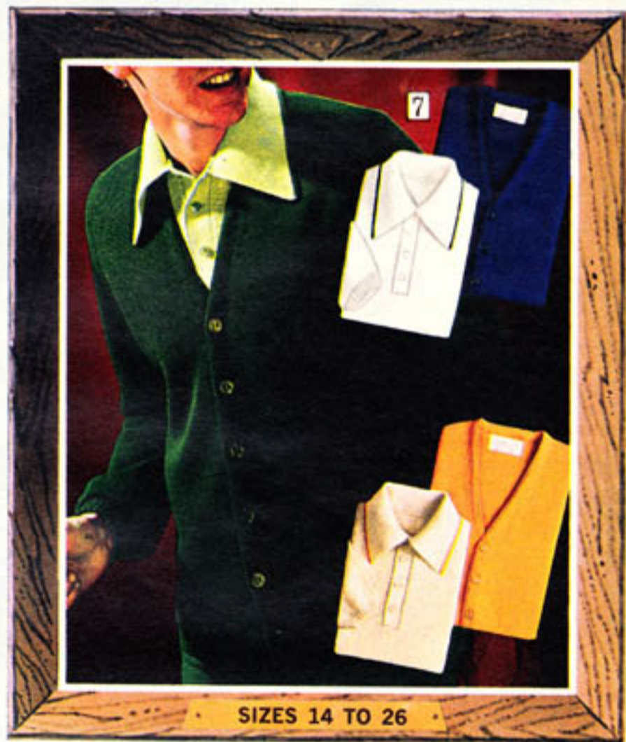
SIZES 14 TO 26