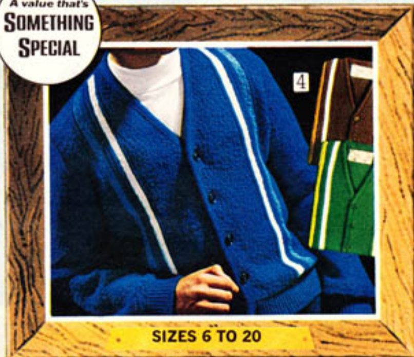
SIZES 6 TO 20