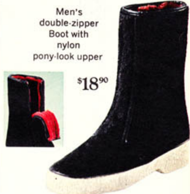
Men's double-zipper Boot with nylon pony-look upper $18.90

76 N 98640F—Navy 76 N 98641F—Yellow State full size. Shpg. wt. 3 lbs. . . . . $15.08