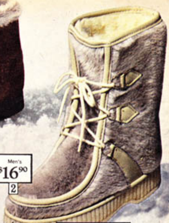
Women's $14.90 Children's $12.90 Men's $16.90 2