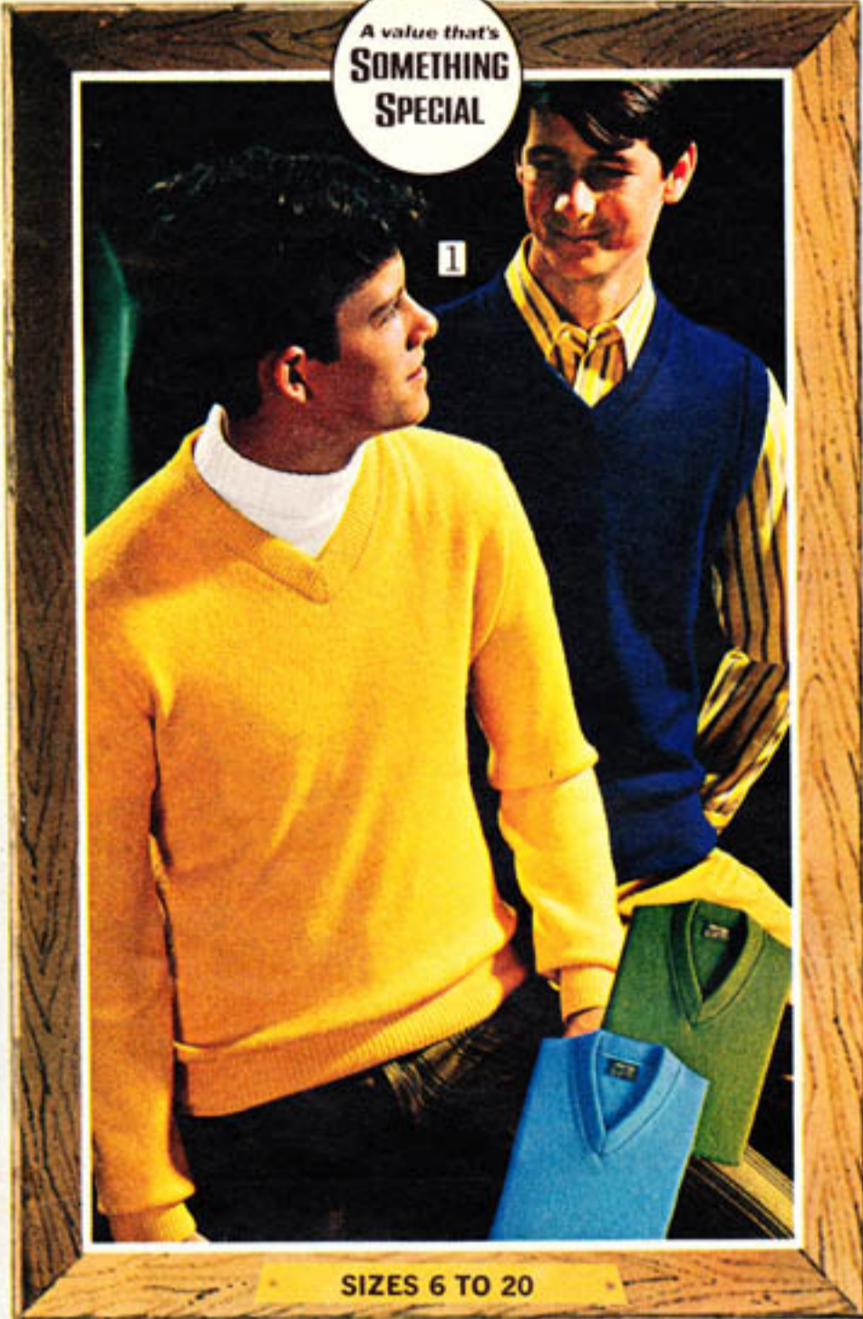
SIZES 6 TO 20

1 LOOK AT THIS: Great low prices for boys' V-neck pullover Sweaters. Shape retaining 100% Orlon® acrylic in a flat knit stitch. Classic V-neck styling. Ribbed neck, bottom. Sleeveless has ribbed armholes; long set-in sleeve has ribbed cuff. Machine wash, med. Tumble dry. State size 6, 8, 10, 12, 14, 16, 18 or 20.