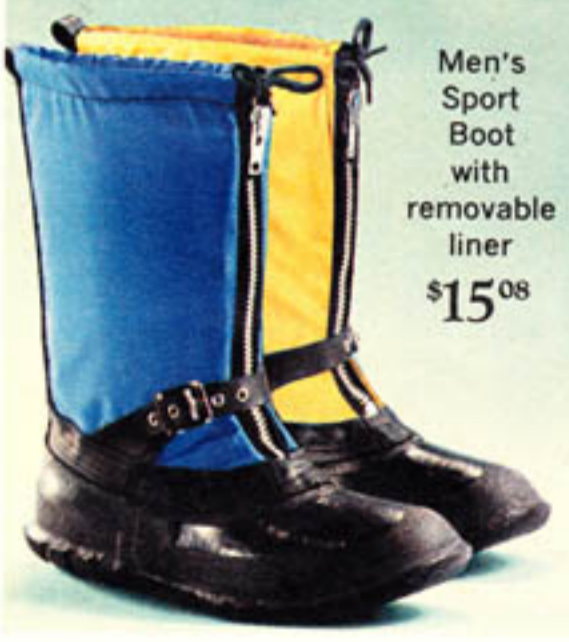
Men's Sport Boot with removable liner $15.08

54 N 36586F—Brown 54 N 36086F—Black Shipping weight 1 lb. 8 oz. . . . . $10.99