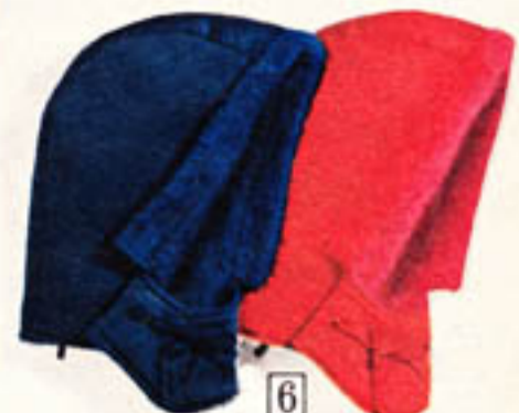
Matching Hoods for Everyone