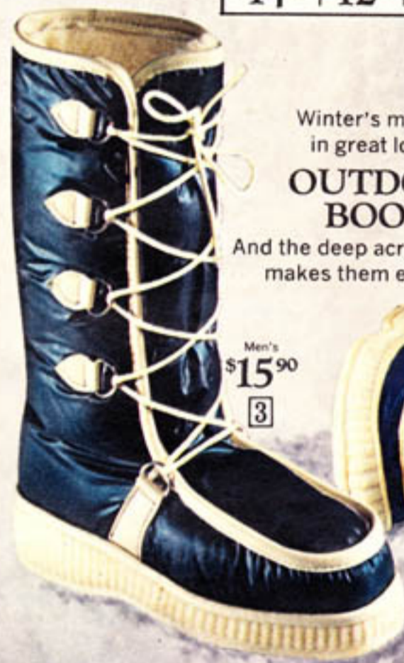
Men's $15.90 3