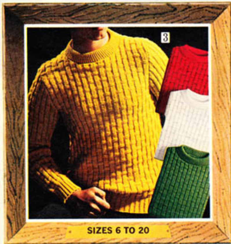
SIZES 6 TO 20