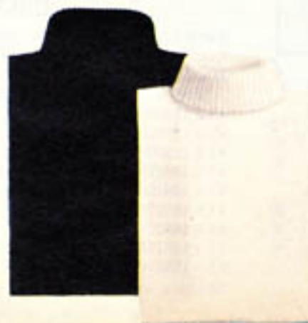
Ribbed-neck Orlon® Dickey

A great look under sweaters and shirts. Ribbed turtleneck for a stretchy, comfortable fit. Soft Orlon® acrylic. Machine wash, medium. Why not pick up the phone and order it? One size fits all.