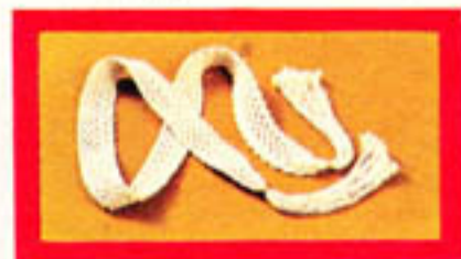
The BRAIDED SASH

Junior sizes 5, 7, 9, 11, 13, 15. 19 N 8074F - Bright navy 19 N 8075F - White 19 N 8076F - Flame red State size. Shpg. wt. 14 oz. .... $9.97