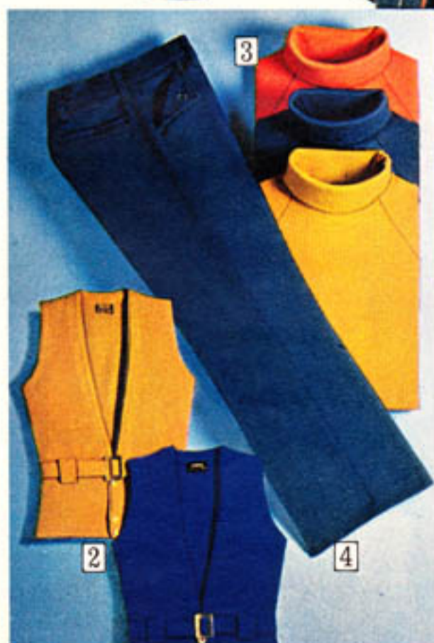
CHART 1: Regular and Slim Sizes 8 to 12