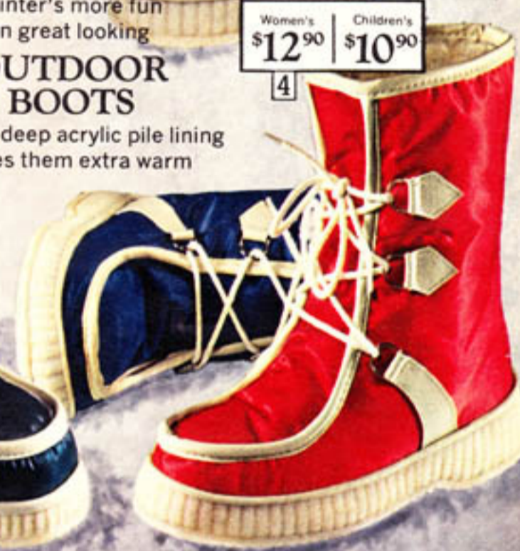
Women's $12.90 Children's $10.90 4