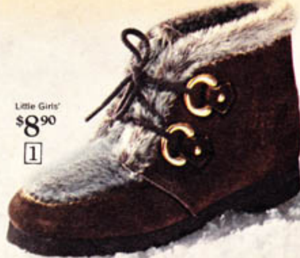
Little Girls' $8.90 1

76 N 58015F—Navy. Shpg. wt. 1 lb. 12 oz. . . $10.90