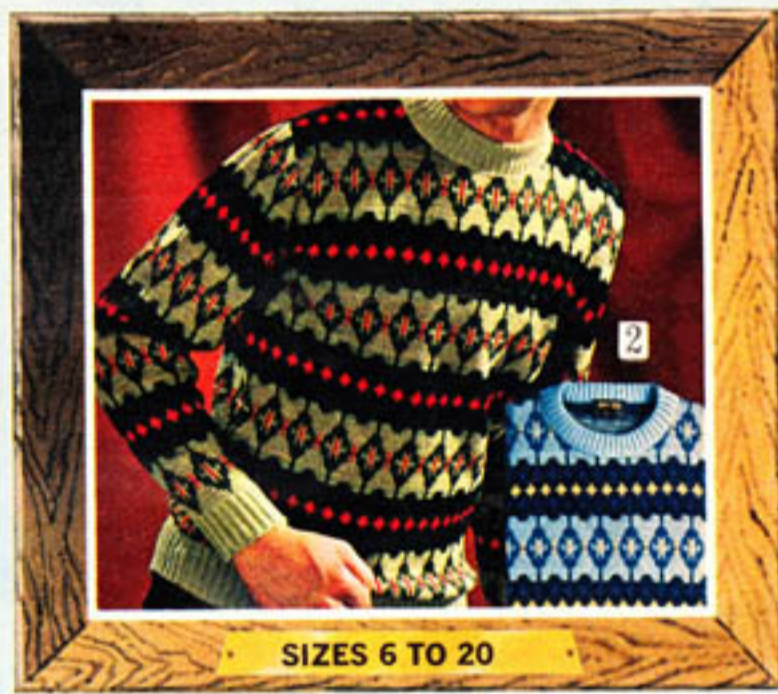
SIZES 6 TO 20

Order your usual size . . . if in doubt, see CHART 1 on page 220