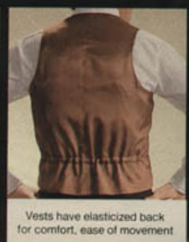
Vests have elasticized back for comfort, ease of movement