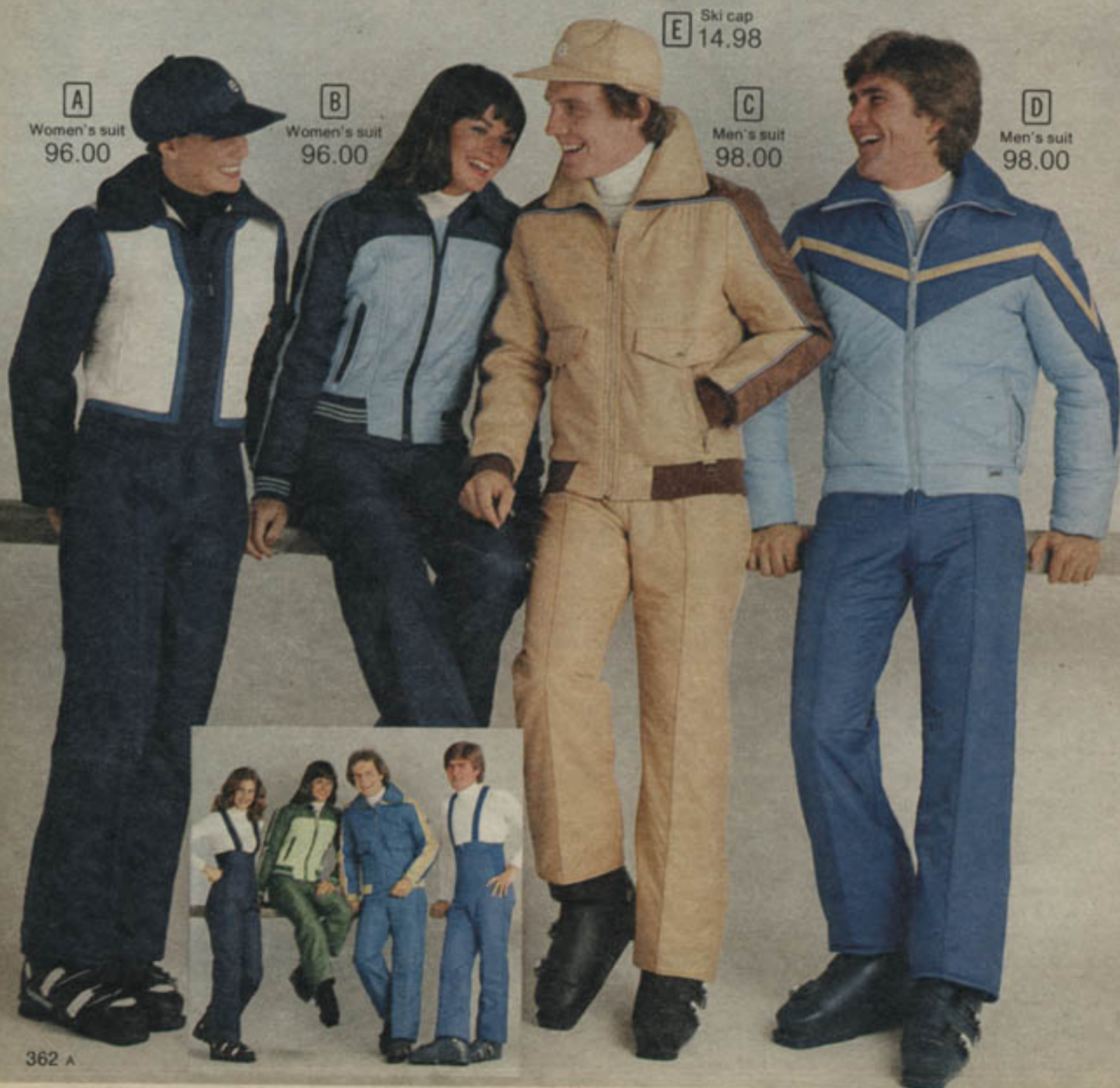
A Women's suit 96.00