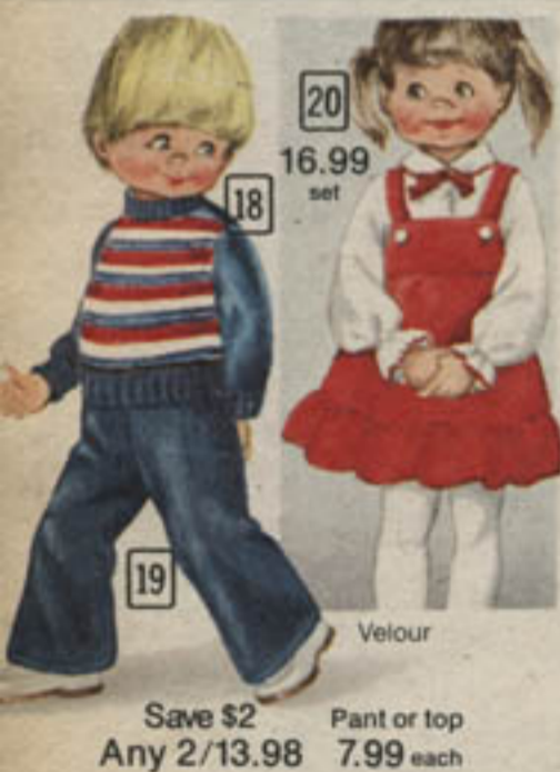
20 16.99 set