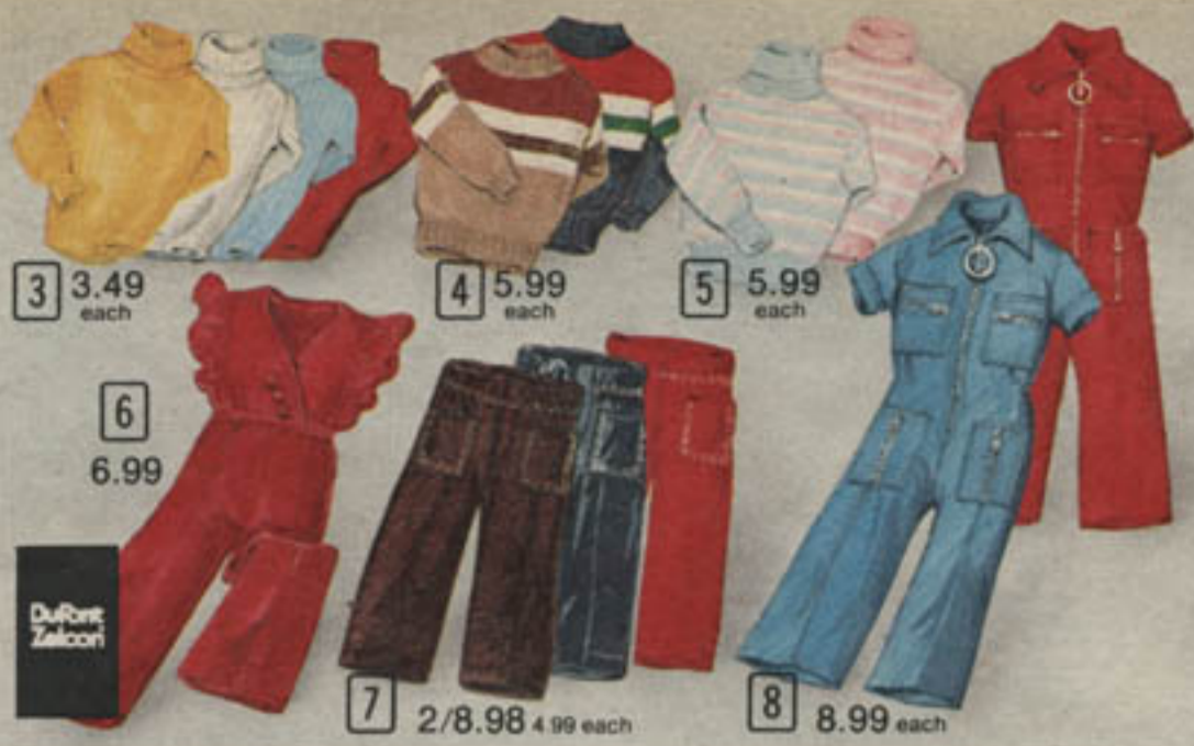
3 3.49 each