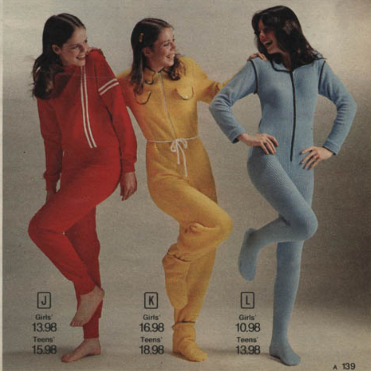
J Girls' 13.98 Teens' 15.98