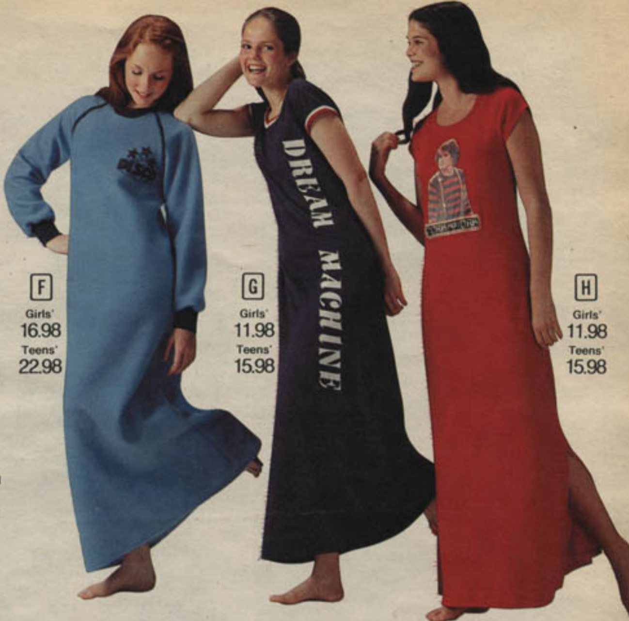
F Girls' 16.98 Teens' 22.98