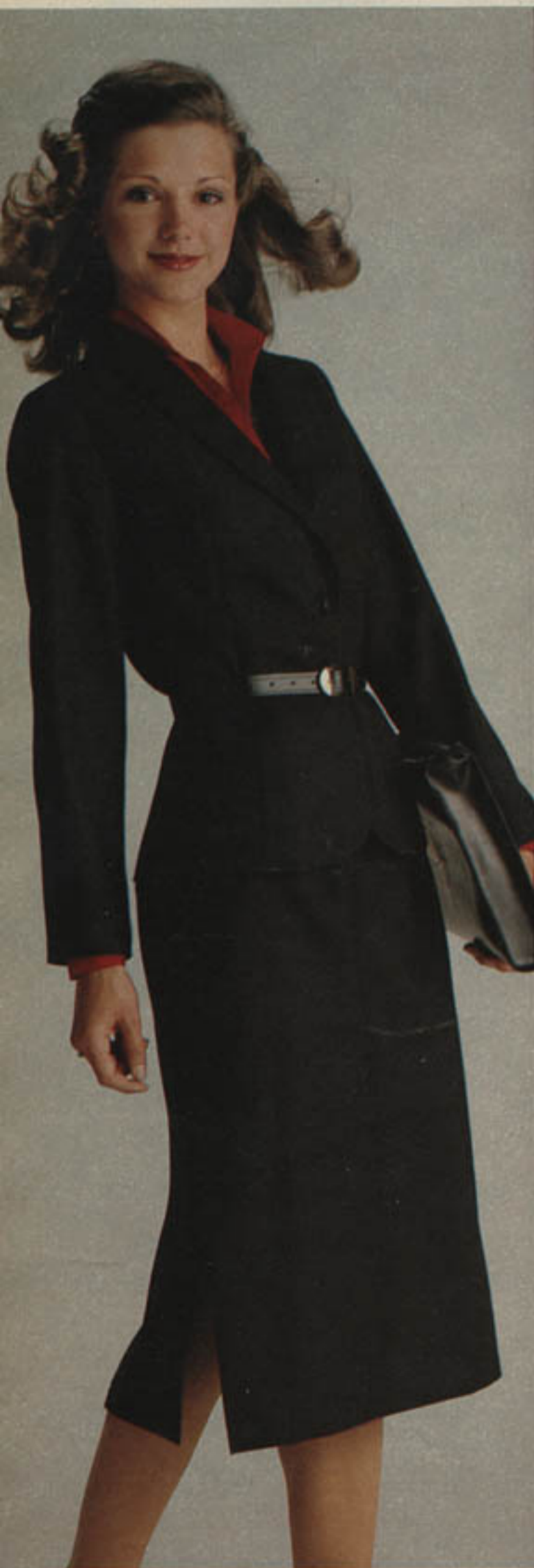
A 2-Piece Suit $52 B Leather Belt $6