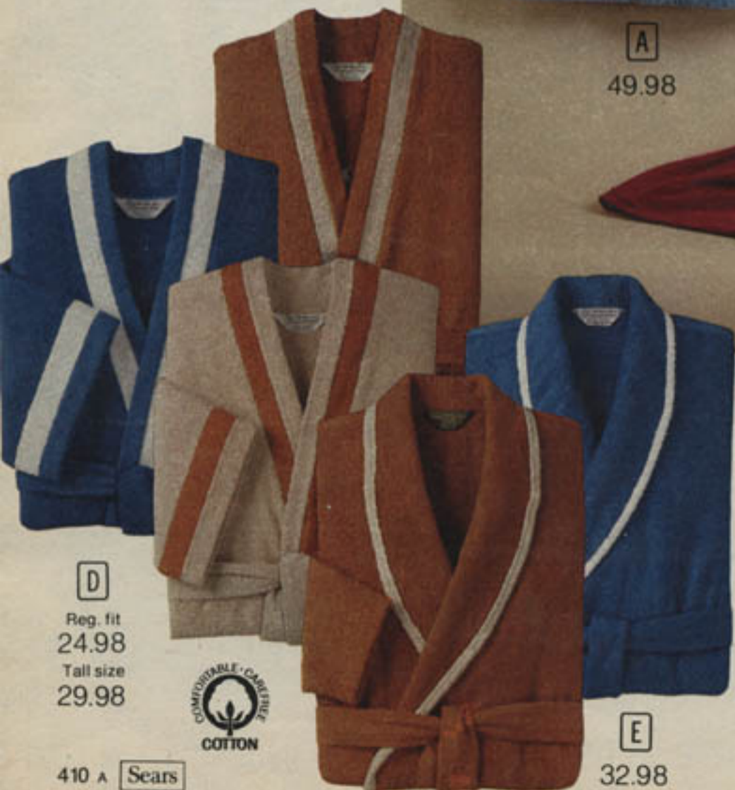
D Reg. fit 24.98 Tall size 29.98