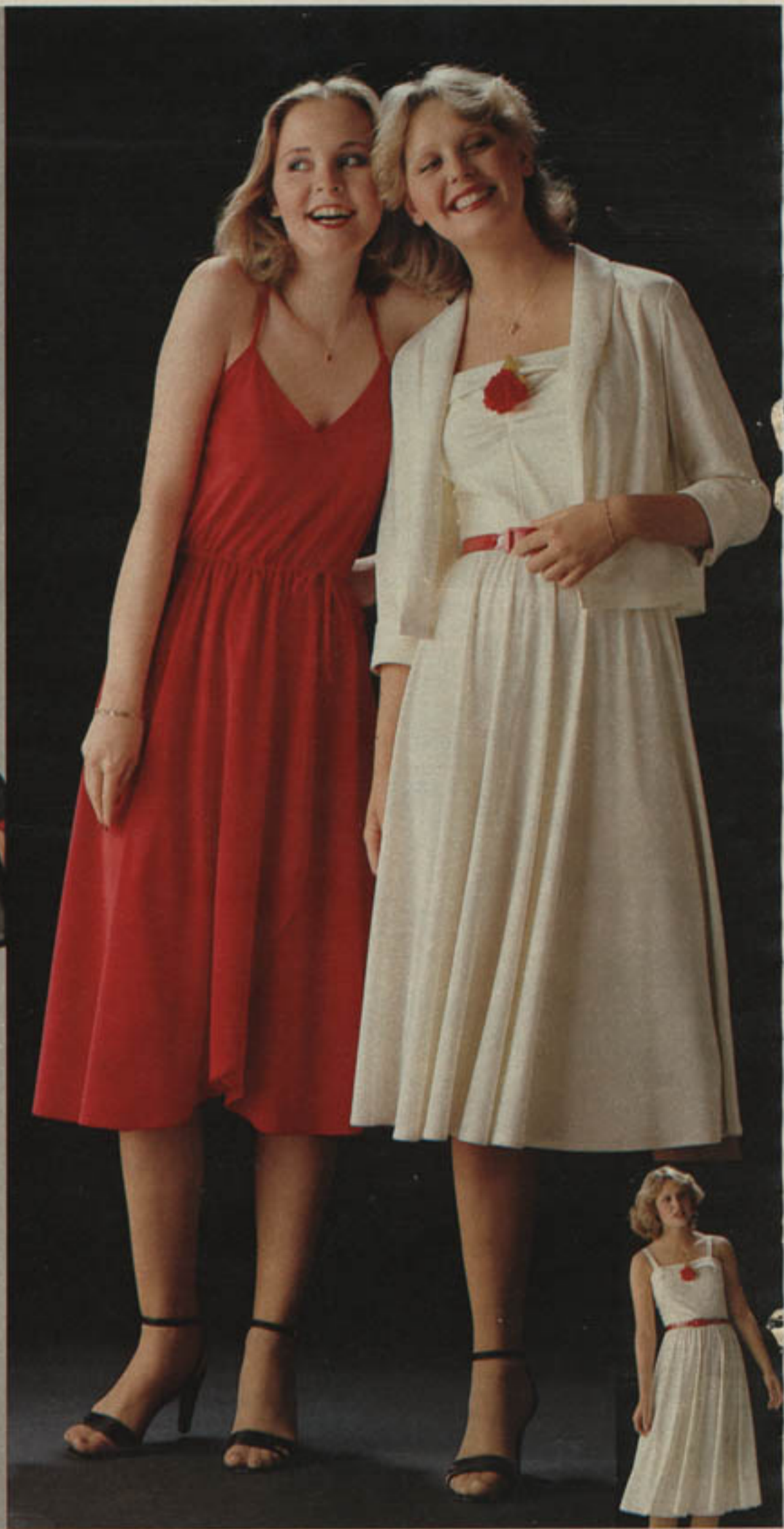
C Dress $37 D 2-Piece Set $44