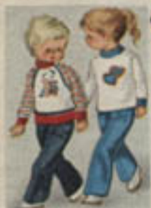
2-piece pant sets 8.99 set