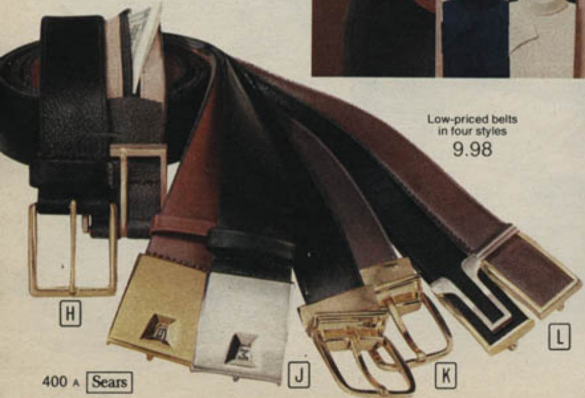
Low-priced belts in four styles 9.98