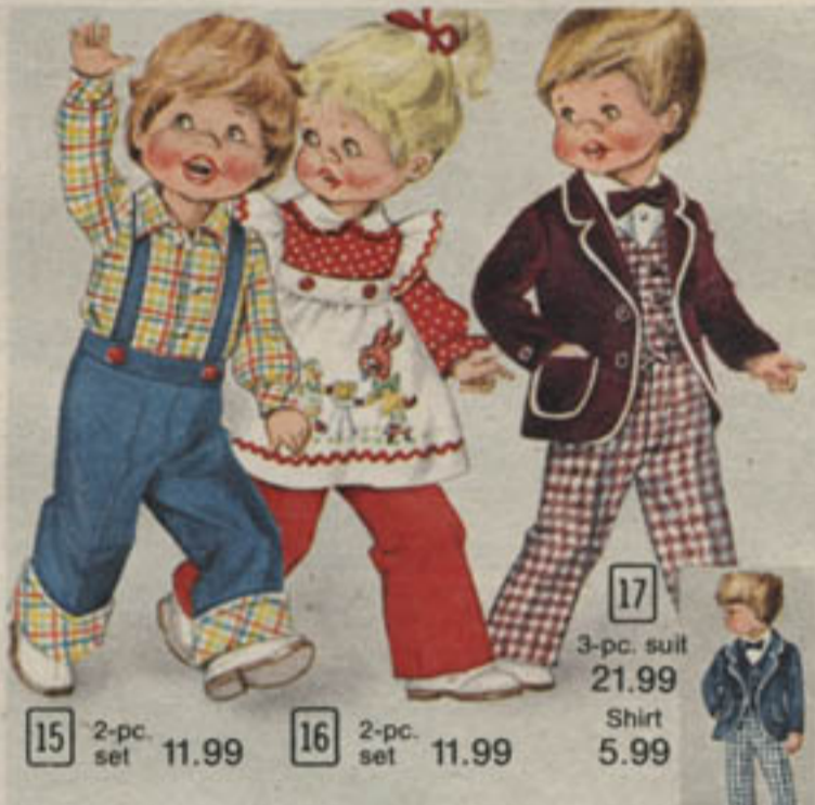
15 2-pc. set 11.99