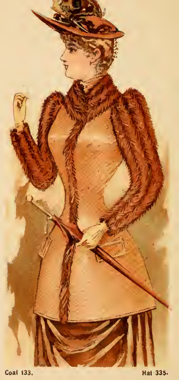
PRICE & DESCRIPTION - See opposite page. "OUR TRADE MARK in EVERY GARMENT is a LASTING GUARANTEE for FIRST-CLASS MATERIAL, SUPERIOR WORKMANSHIP, PERFECT FIT and EXCLUSIVE DESIGN."