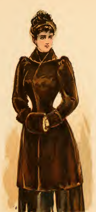
Jacket 105. Hat 307.