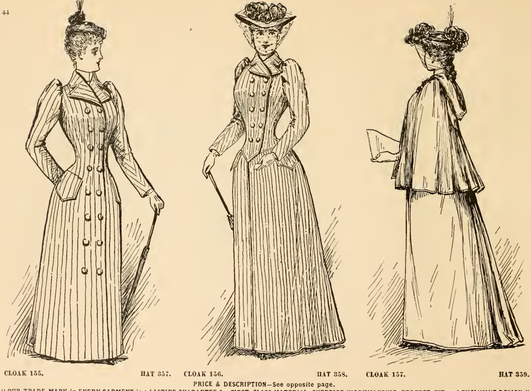
OUR TRADE MARK IN EVERY GARMENT IS A LASTING GUARANTEE for FIRST-CLASS MATERIAL, SUPERIOR WORKMANSHIP, PERFECT FIT and EXCLUSIVE DESIGN."