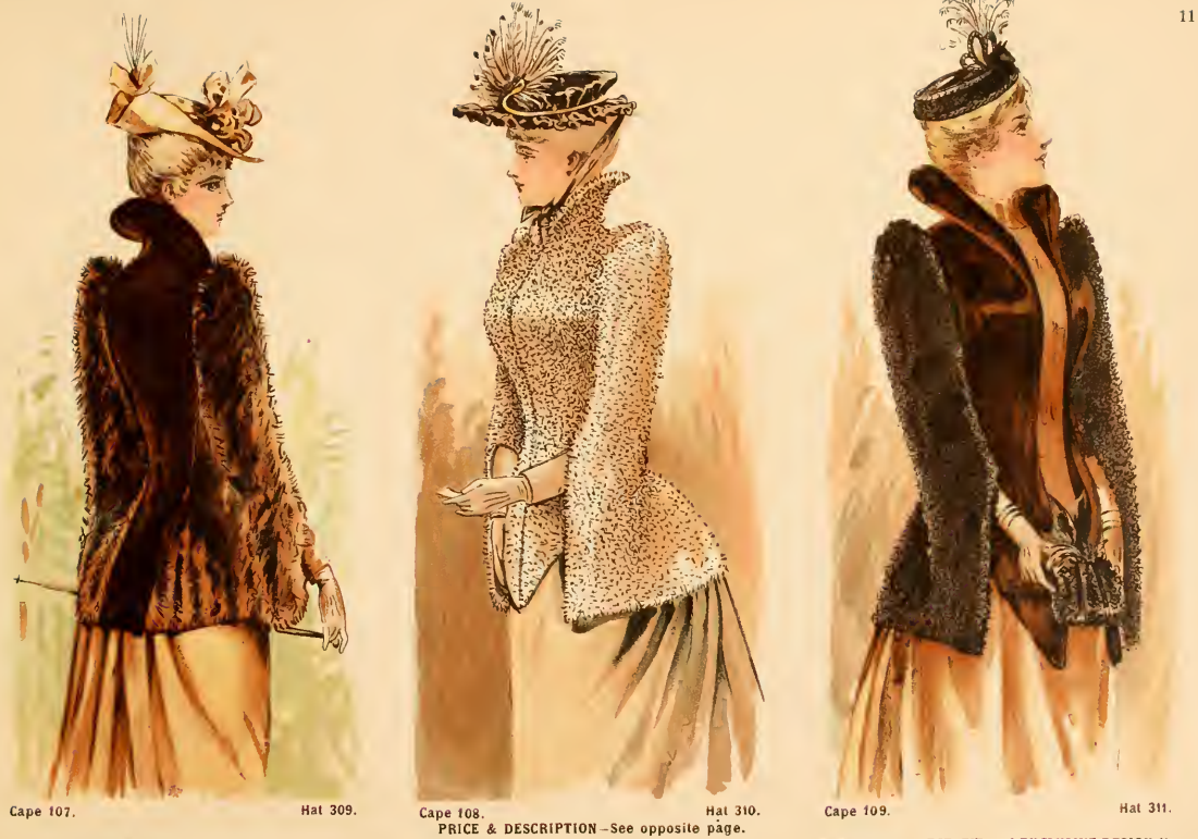
"OUR TRADE MARK IN EVERY GARMENT IS A LASTING GUARANTEE for FIRST-CLASS MATERIAL, SUPERIOR WORKMANSHIP, PERFECT FIT and EXCLUSIVE DESIGN."