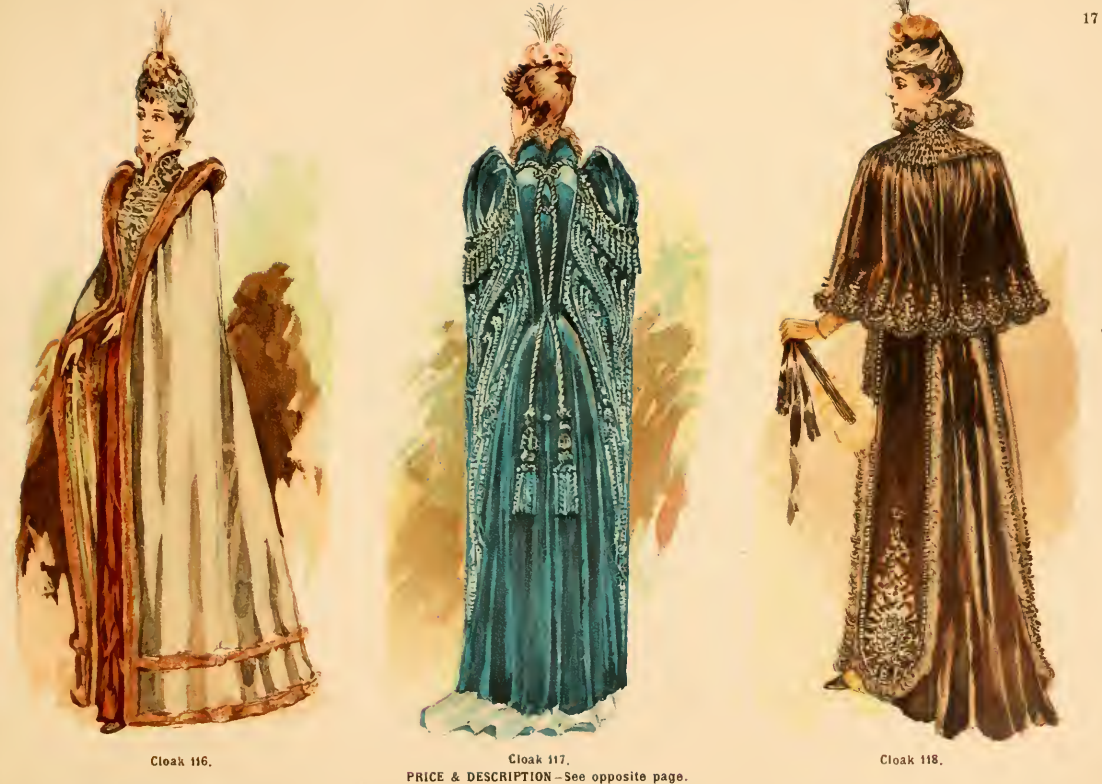
" DUR TRADE MARK IN EVERY GARMENT IS A LASTING GUARANTEE for FIRST-CLASS MATERIAL, SUPERIOR WORKMANSHIP, PERFECT FIT and EXCLUSIVE DESIGN."