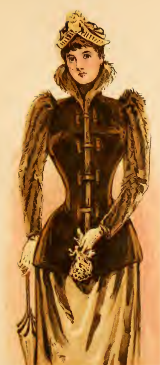
Jacket 104, Hat 306.