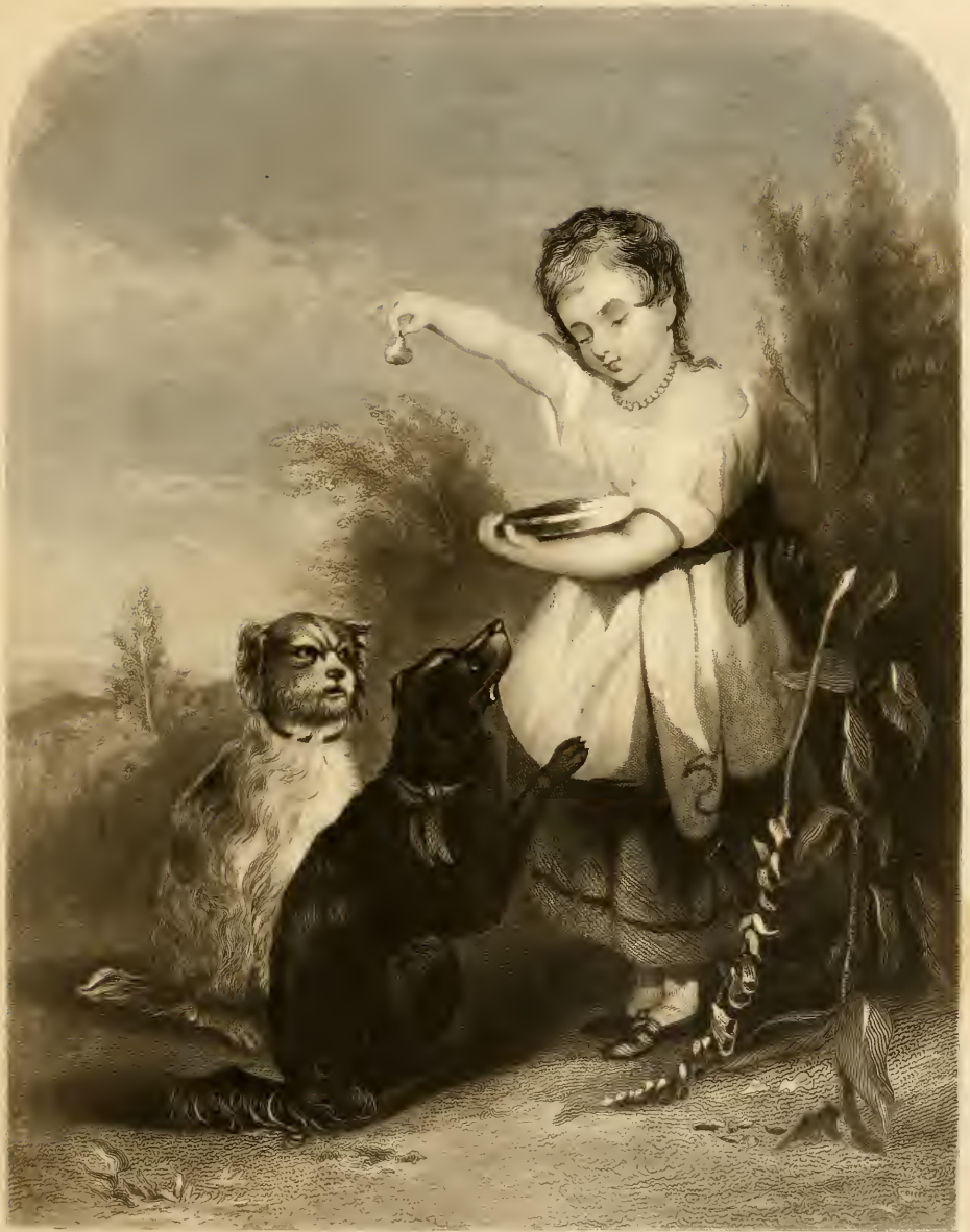
PAINTED BY J. INSKIP