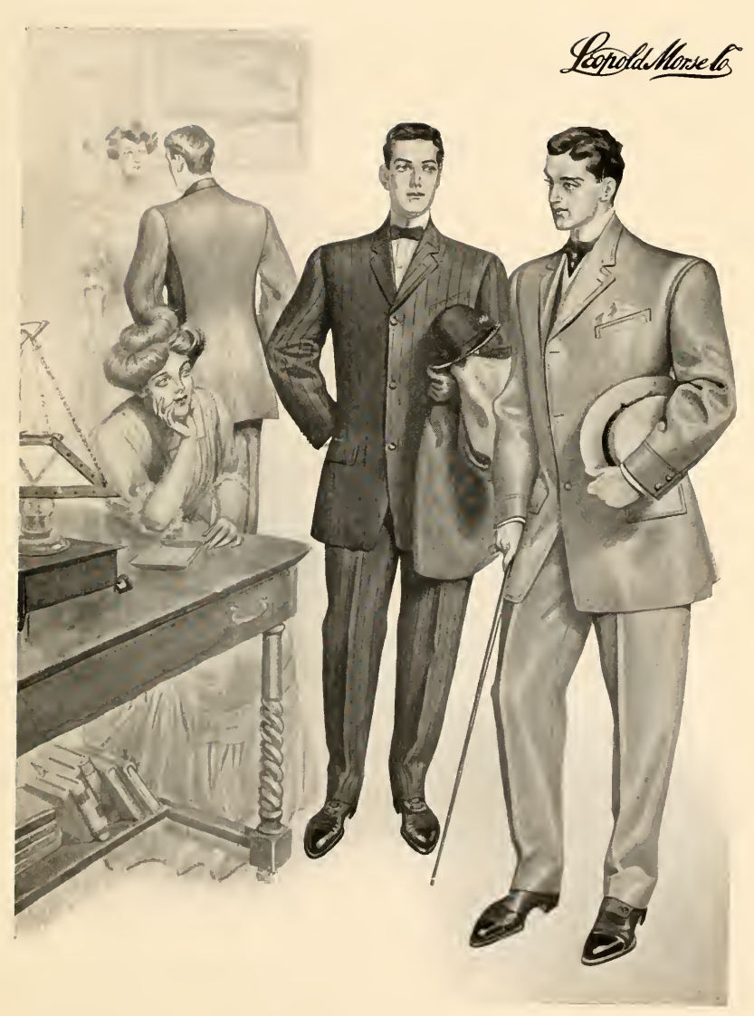
THE "REGENT" AND THE "WINSTON"