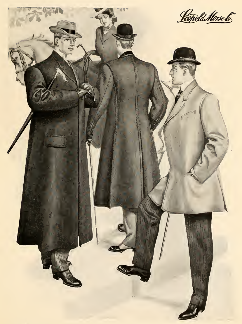
. RAINCOAT THE "LAFAYETTE" THE "STRATFORD" . .