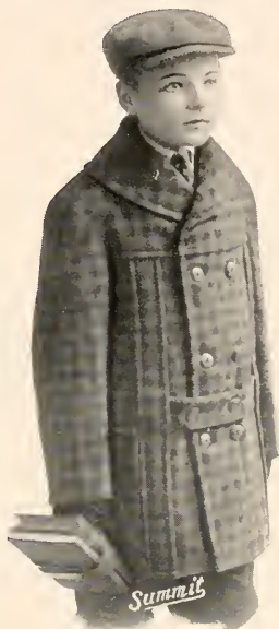
MODEL 38JA MODEL 44 JUVENILE'S DE LUXE COAT See illustration of Model 44 Youth's for style.

Shawl collar, two back inverted plaits to waist line, imitation half belt, two lower inverted plaited pockets with flaps and buttons, one upper plain pocket with button, inside change pocket, matched stripes, full man tailored, overcoat sizes for juveniles. Sizes 8 to 16.