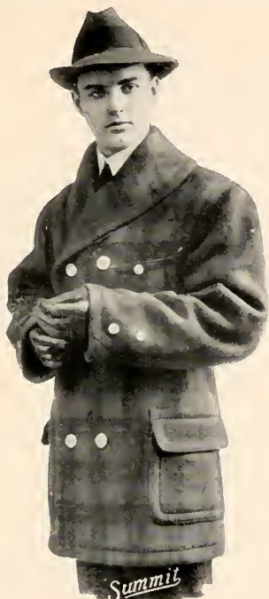
Model 42 De Luxe, Front