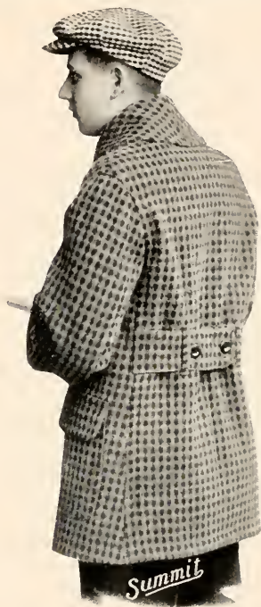
Model 42 De Luxe, Back