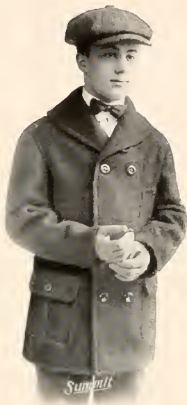
Model 44 De Luxe

A smart model that is different for the boys and young men. Shawl collar, two back inverted plaits to waist line, imitation half belt, two lower inverted plaited pockets with flaps and buttons, one upper plain pocket with button, inside change pocket, matched stripes, full man tailored, overcoat sizes for youths and boys.