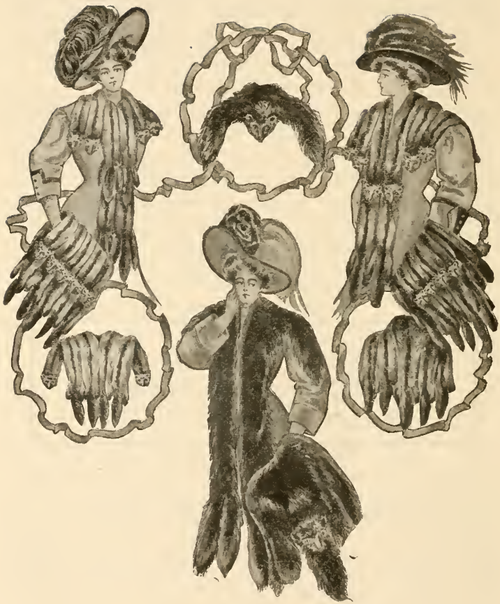
THE BEST FURS BROUGHT TO AMERICA