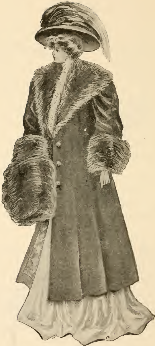
THE BEST FURS BROUGHT TO AMERICA