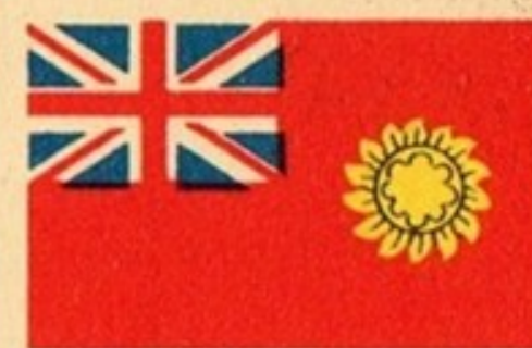
EMPIRE OF INDIA