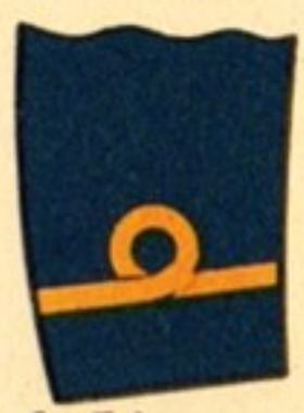
Sub-Lieutenant or Commissioned Warrant Officer