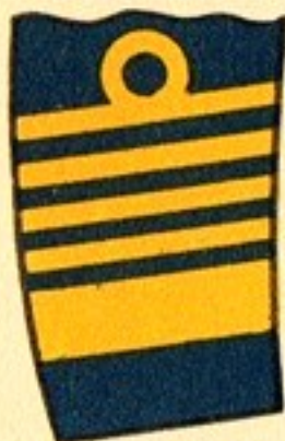
Admiral of the Fleet