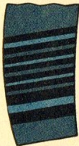
Air Chief Marshal