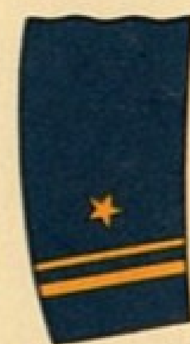
Lieutenant Junior Grade