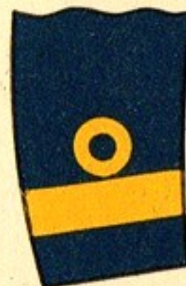
Commodore Second Class