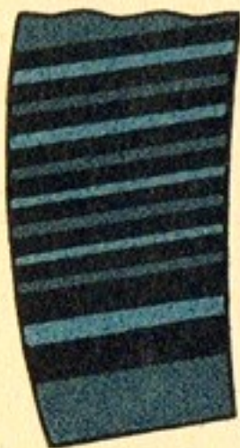
Marshal of the R. A. F.