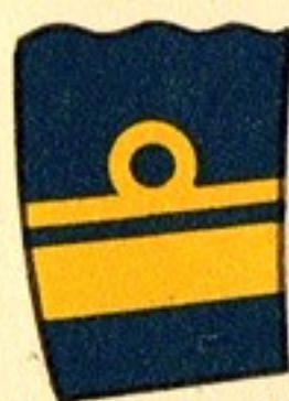
Rear Admiral and Commodore First Class