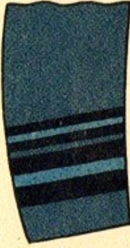
Air Vice Admiral