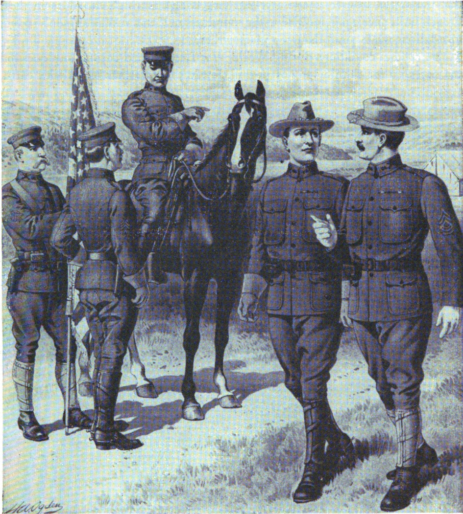
The First Olive Drab, 1898-1907.

This brief conflict brought olive drab into the Army. The United States was not the first major power to use this color. Great Britain had outfitted its forces in India with olive drab or khaki as early as 1860. The word khaki itself (meaning dust-colored) is of Indian origin. Several of the United States volunteer regiments were authorized to wear khaki in 1898 during the fighting in Cuba and Puerto Rico. However, blue remained the officially prescribed color for the uniform.