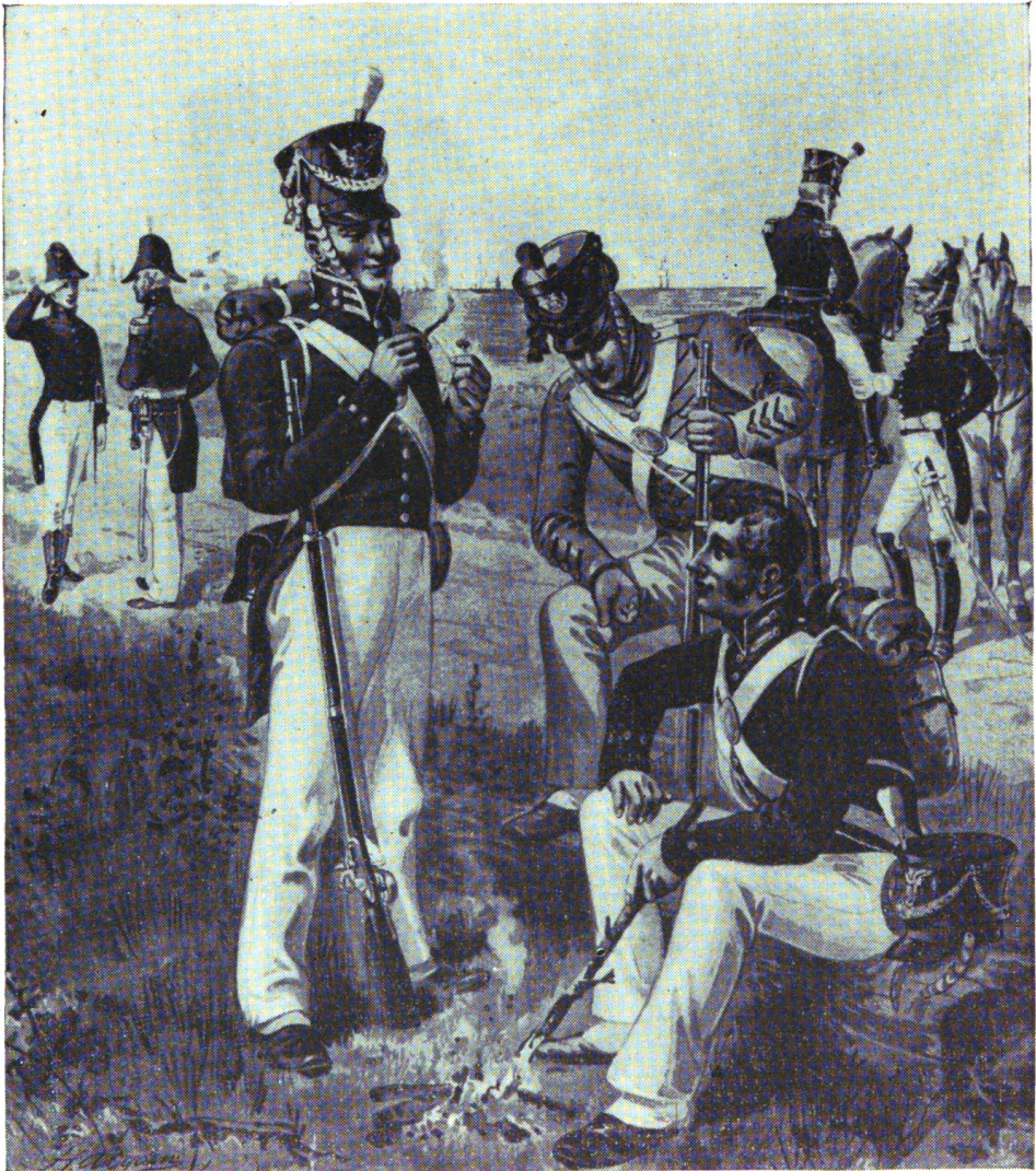
Representative U. S. Army Uniforms, 1813-1821.

of rounded buttons bearing corps insignia. The wearing of epaulettes by sergeants and corporals, which had begun during the Revolutionary War, now became fairly standard. Knee breeches and shoes were worn on special occasions; an order of 1813 directs that "where etiquette requires shoes, breeches agreeable to the uniform are to be worn with yellow knee-buckles instead of strings, yellow buckles in the shoes and a chapeau instead of the cap. No plumes." Enlisted men and officers wore similar uniforms except for certain differences of ornamentation. This precedent of similar uniforms for all ranks has been revived in the new Army Green uniform.