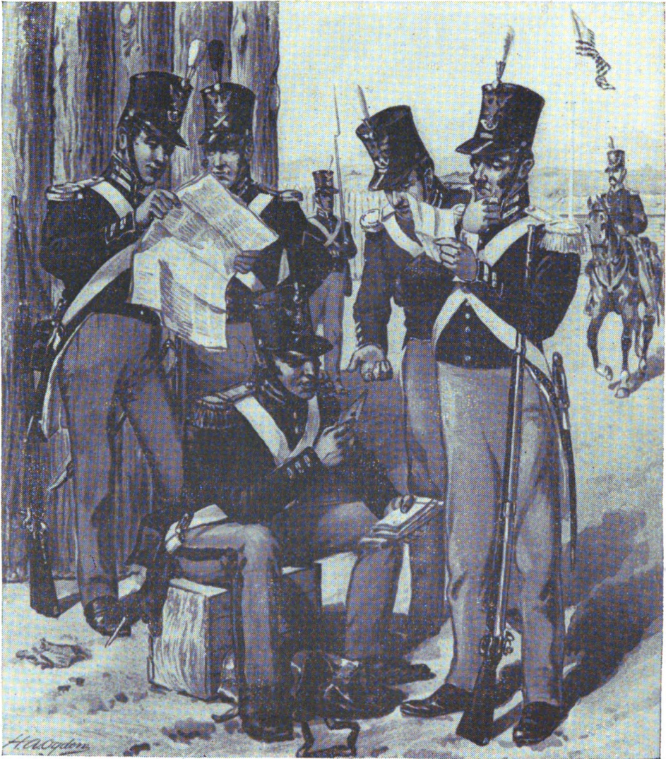
Full Dress Uniform, 1835-1850.

Army Regulations of 1821 prescribed dark blue as the national color, "when a different one is not prescribed." Blue was used for all dress uniforms. Fatigue jackets and winter trousers for enlisted men were gray, as were the dress uniforms of the Corps of Cadets at West Point. The "Kaydet Gray" still worn by West Point cadets commemorates the victory of General Winfield Scott's gray-clad forces over the British in the Battle of Chippewa in 1814. The 1821 Regulations also introduced the chevron to designate rank in the Artillery and Infantry.