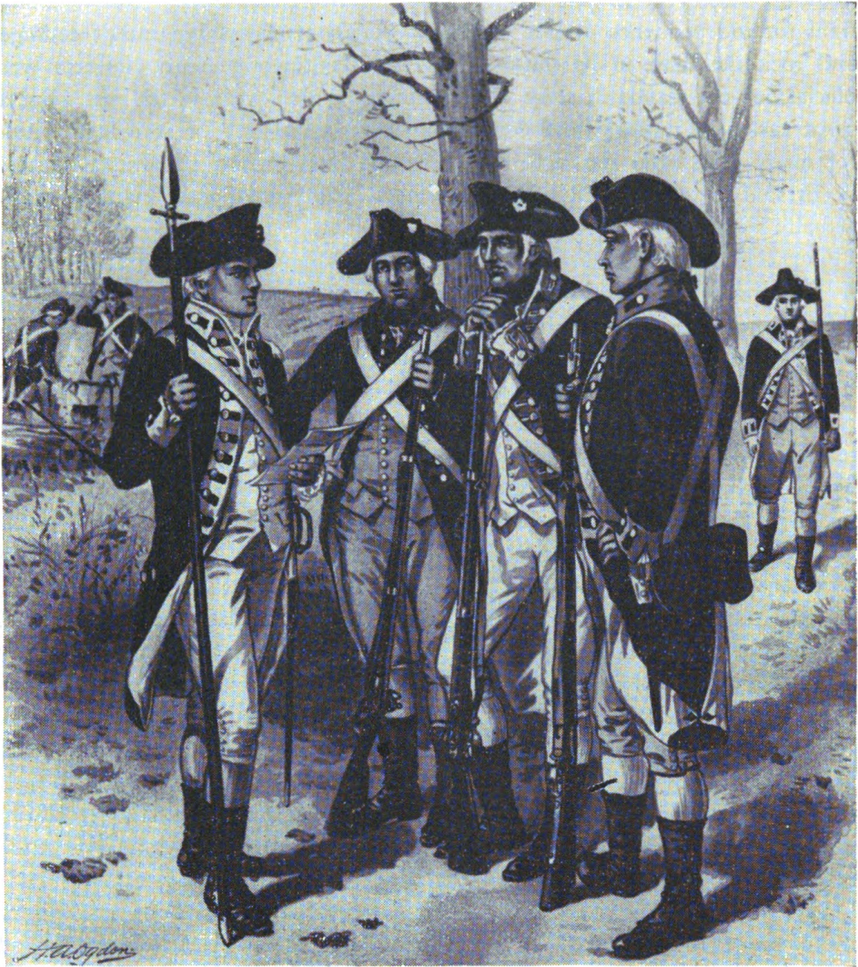
Infantry, Continental Army, 1779-1783.

some marked changes were made in the trimming and accoutrements of the uniform but blue remained the basic color. Not until 1813 did the more prominent features of the Revolutionary uniform give way to new forms.