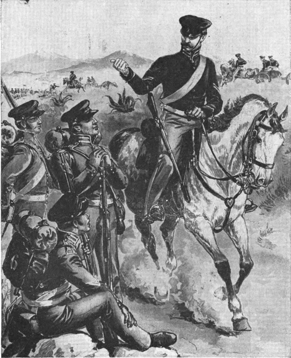
Typical Campaign Uniform, 1841-1851.

During the Mexican War (1847-48), infantrymen and artillerymen wore sky blue, the dragoons a dark blue. The trouser legs had white stripes for infantry, red stripes for artillery, and yellow stripes for dragoons.