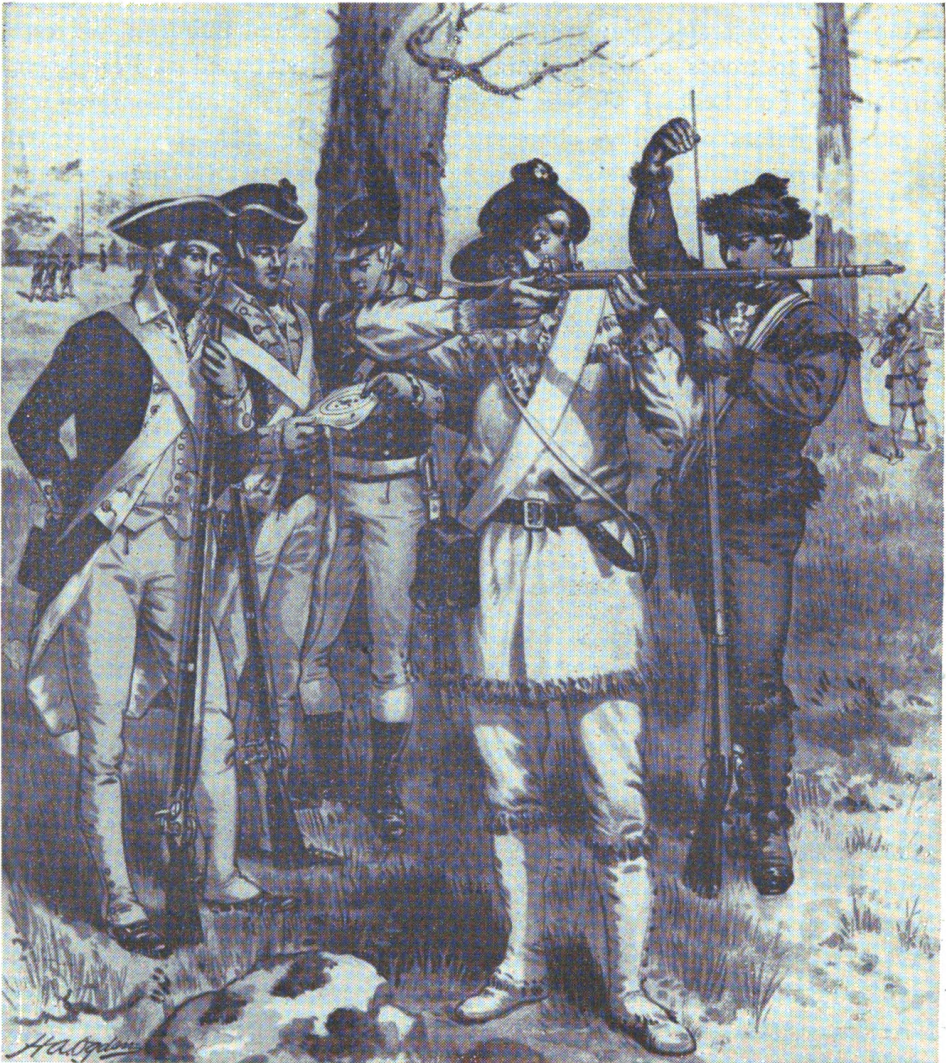
Continental Army, 1776-1779.

It should be kept in mind that our military uniforms in the Colonial and Revolutionary War periods were not standard items of issue like our uniforms today. In those times, the clothing actually worn by most troops had little resemblance to the officially prescribed uniform. For example, most of the Continental Army soldiers under General Washington never wore a uniform exactly like the one pictured on page 6. The reason is quite simple: lack of money, lack of cloth-making facilities, lack of almost everything an Army