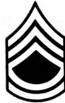
SERGEANT FIRST CLASS