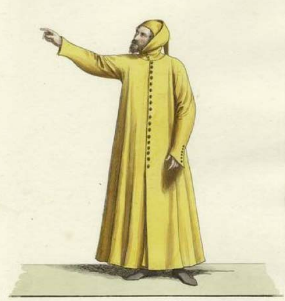
Mccc. Nº 56.

"Hizar (1838) PCHERON, 14 Pc From Grescess by Stroom at Montoni Spanish Chapit Sta. Harris Novels Filozones