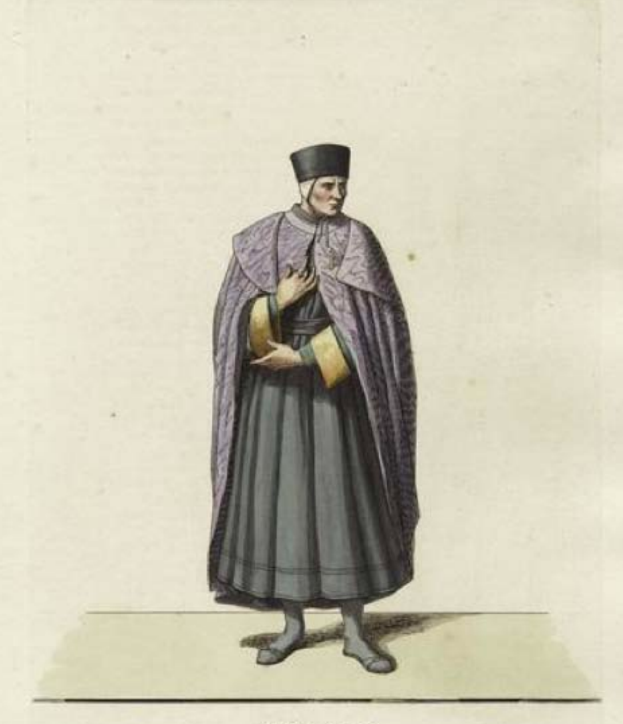
MCCC. Nº 39.

"nand (1828) Rector of Siths hospital, 145c. Fitom a focuse in the bespital by Dominico di Bankolo Sitma