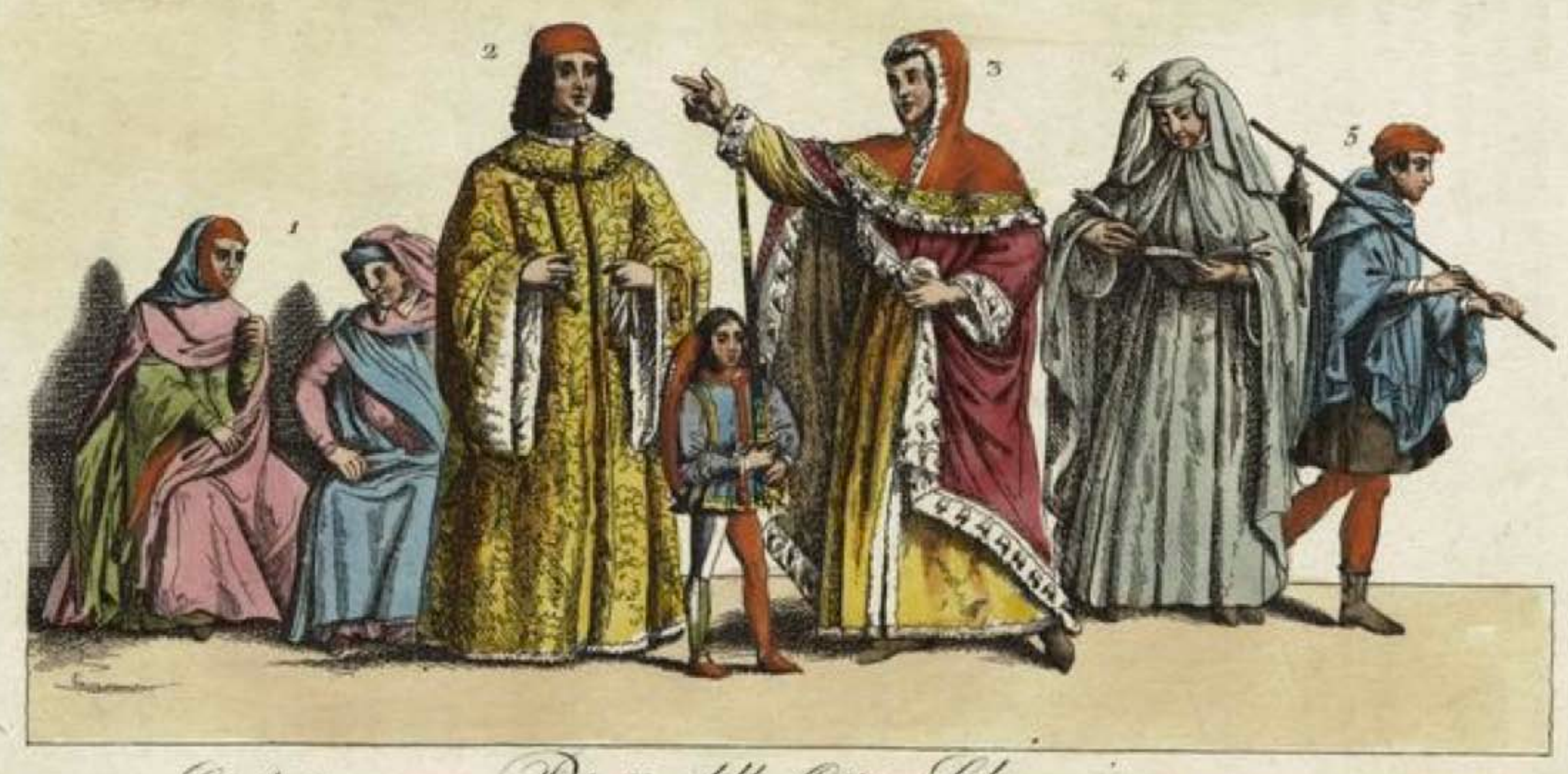
Giudici - Lotestà delle Città Libere Co.