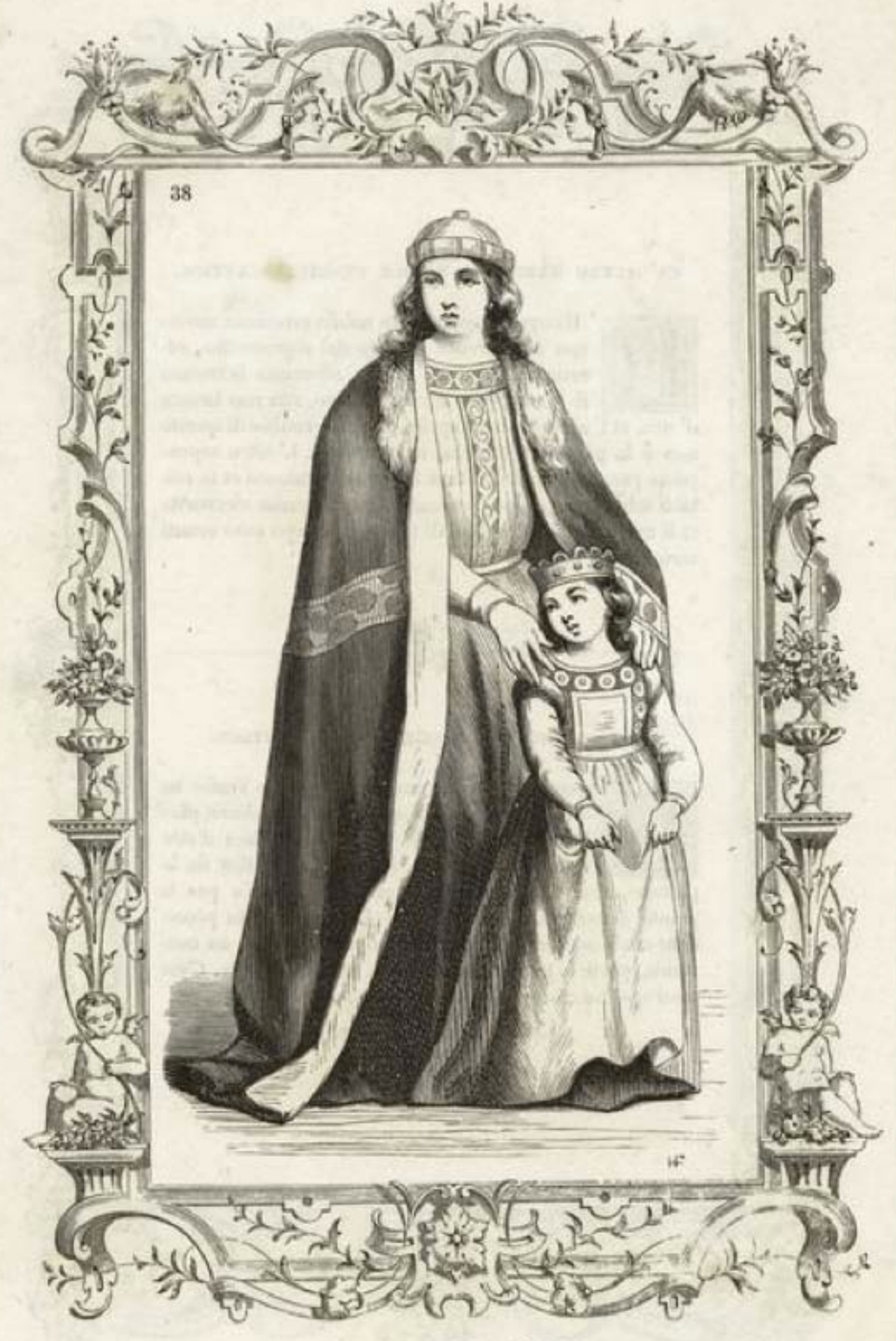
*16 (1859) Noblewoman, Venice