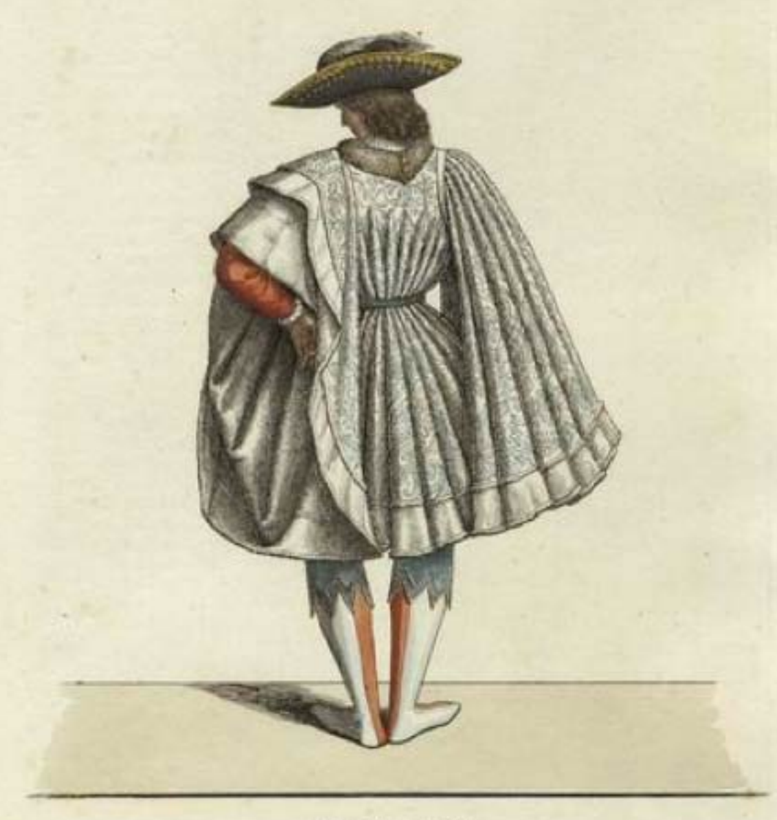
Merc. Nº 40.

*H.249(1828) THE STATE OF THE CONTROL OF BORRES HOSPITE AT STATE