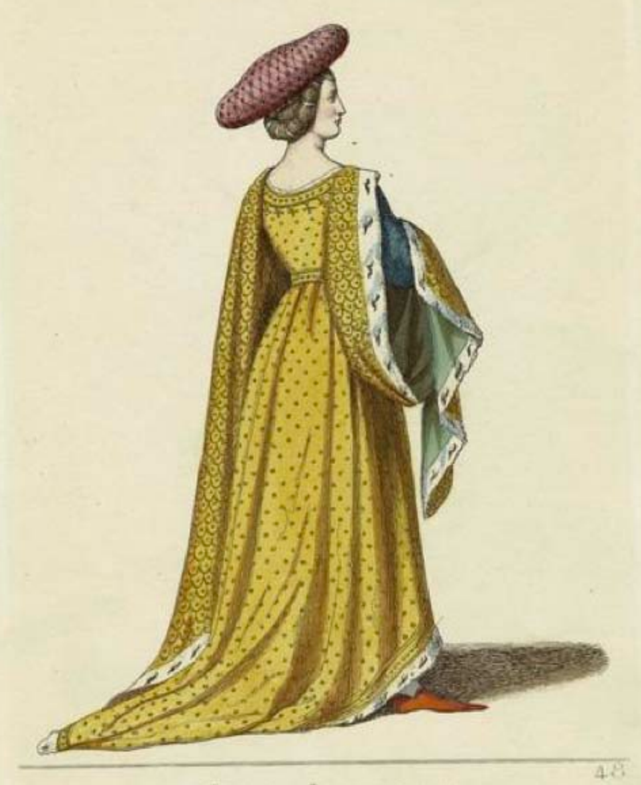
JEVNE ITALIENNE XIVE SIEGLE 6216