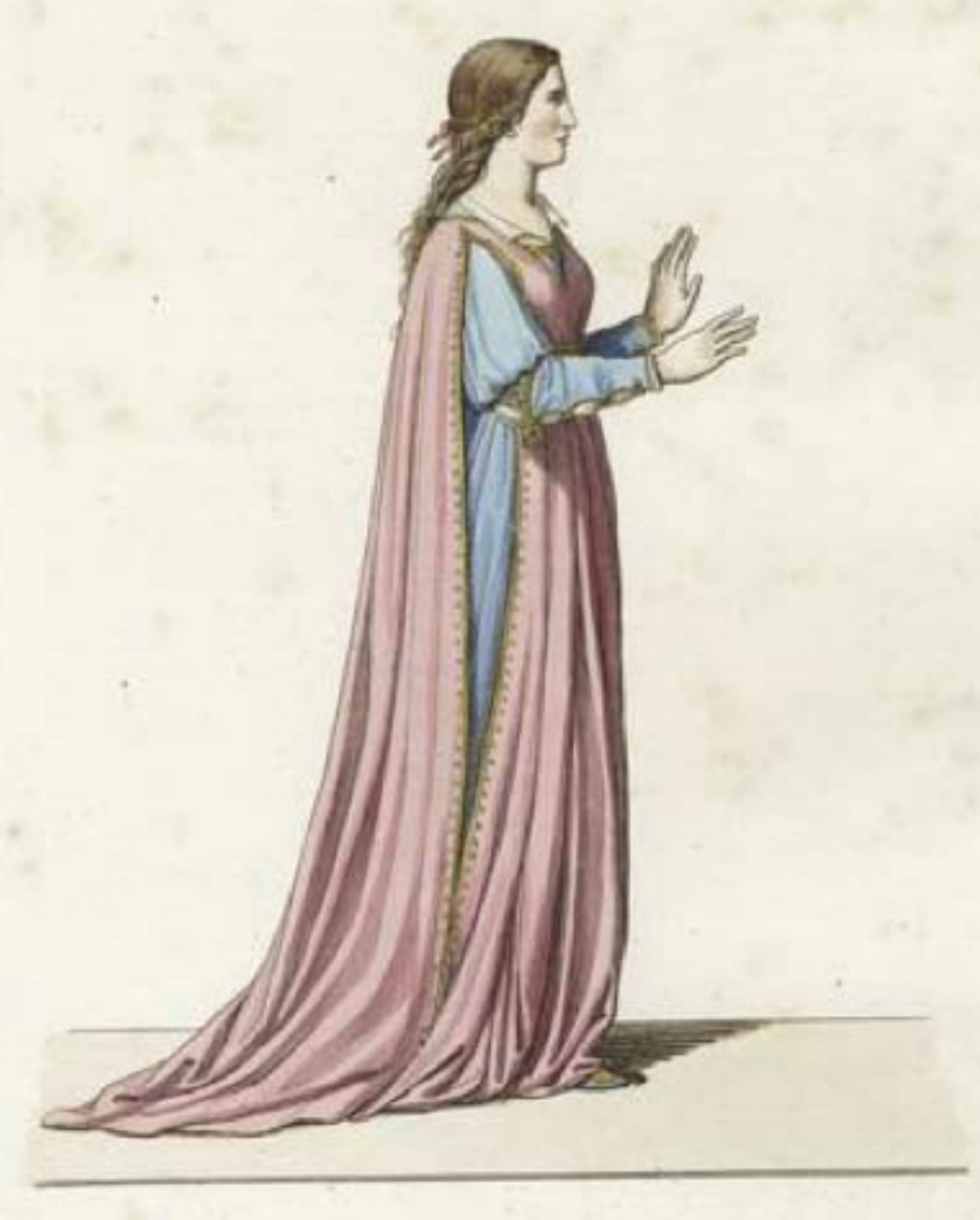
MEET ME 49.

*11,291 (1896) Yearn's Disking German, 1196; Ham a priorities by Auchtesia Lenouschic