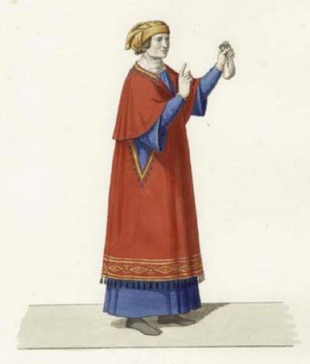
MOTO. Nº 14.

Majany (1834) Simuse annih manget from a manuscraph Public Sheary Seema