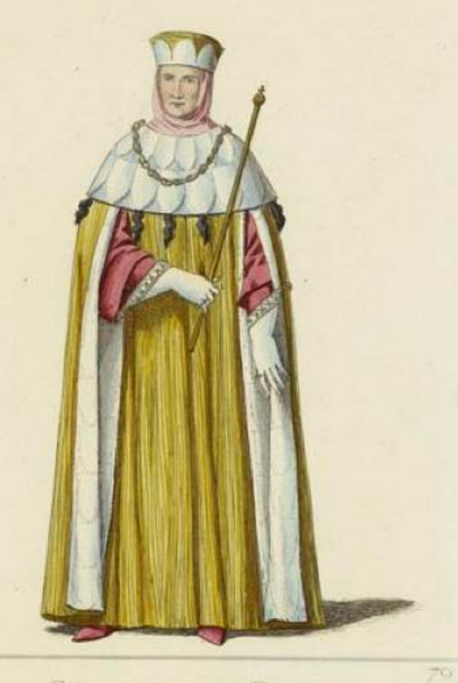
SENATEVR DE ROME