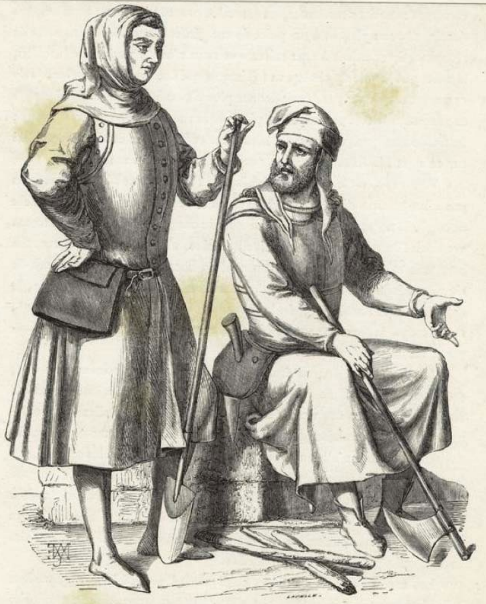
Fig. 417. - Costumes des gens du peuple au quatorzième siècle : jardinier et bûcheron italiens. D'après deux estampes du recueil de Bonnart.