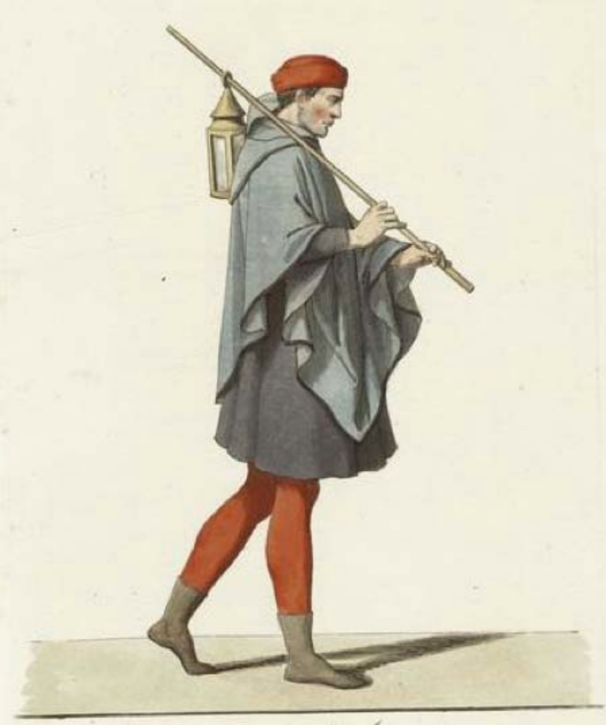
MCCC. Nº 60.