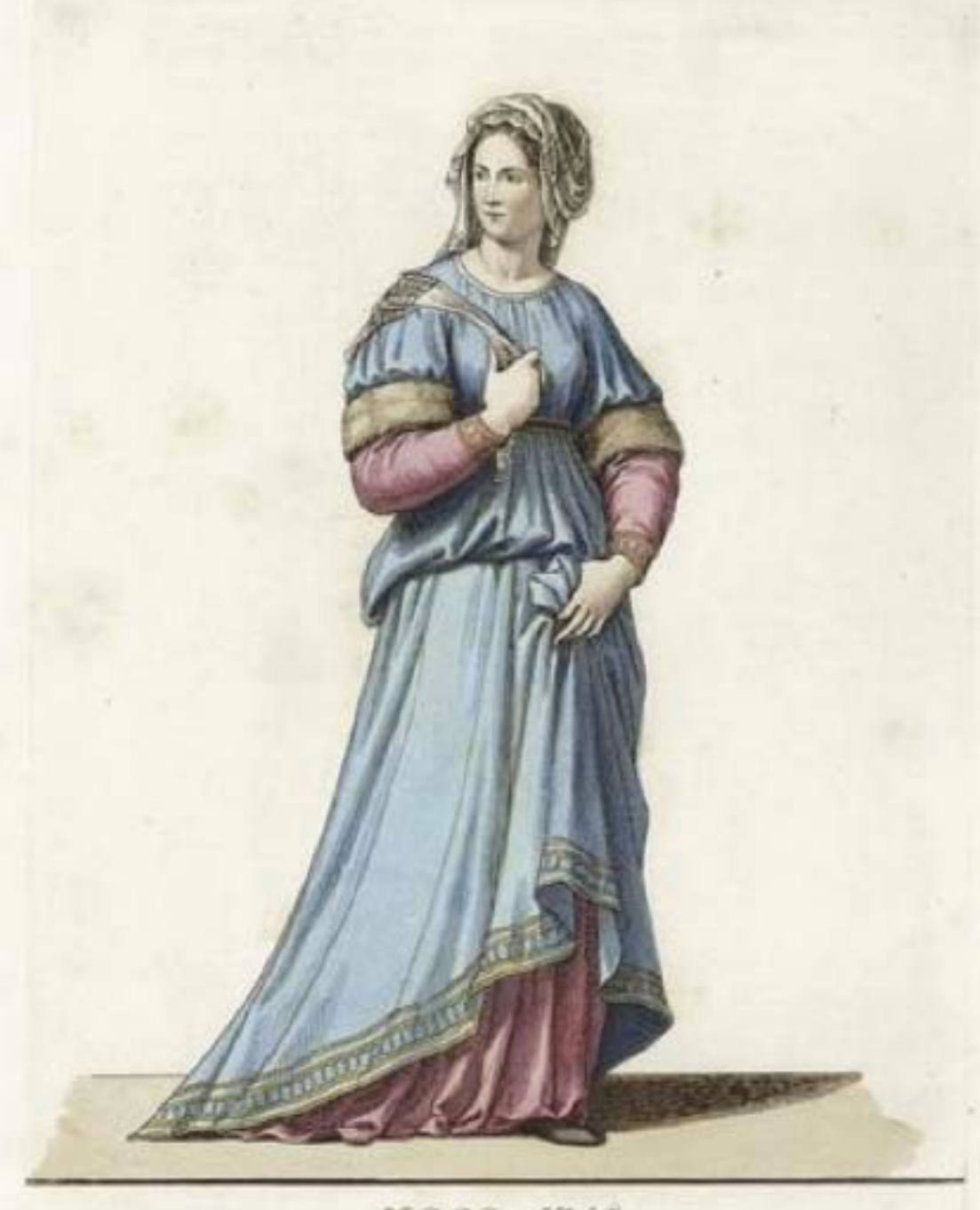
MCCO. Nº 18.

" 11,214(1932) Idalian relativement, from Ancograms to 1972, pacolina Mutamy Sicola