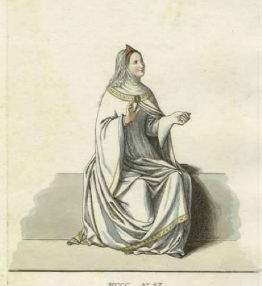
MCCC. Nº 37.

Etracortine Lady, 14th Candi Spinish Chapt, Str. Harde Gaddi Spinish Chapt, Str. Harde Andia Piloneway