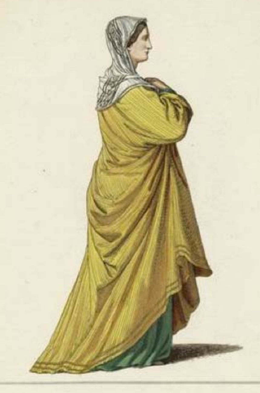
NOBLE ITALIENNE XIVE SECLE