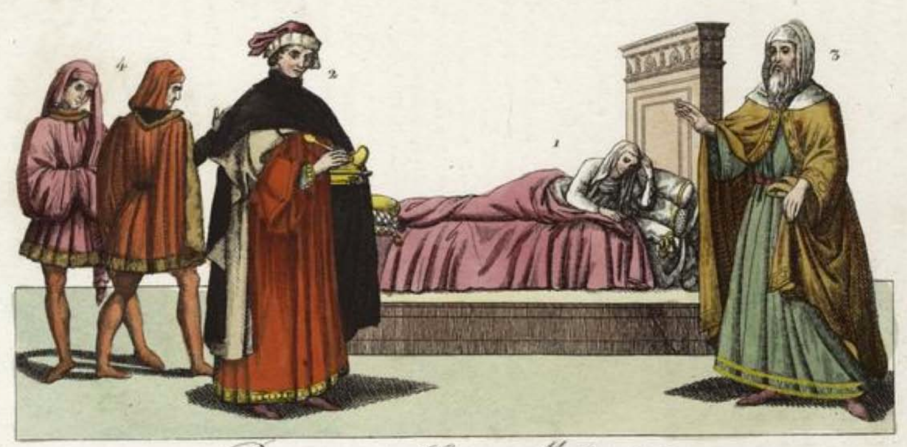
Puerpera in Letto, Medico &C.