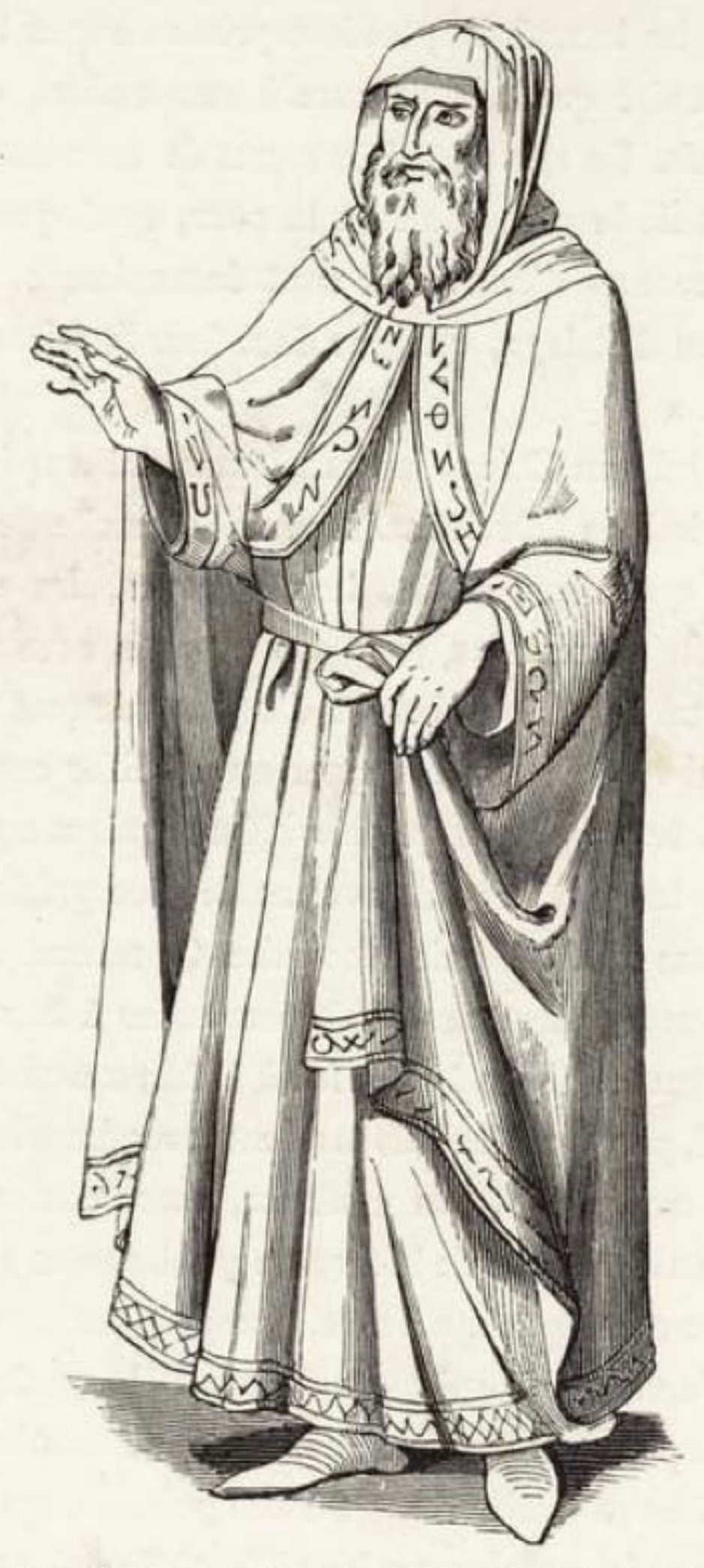
Fig. 365. — Costume d'un juif italien au quatorzième siècle. D'après un tableau de Sano di Pietro conservé à l'Académie des beaux-arts, à Sienne.