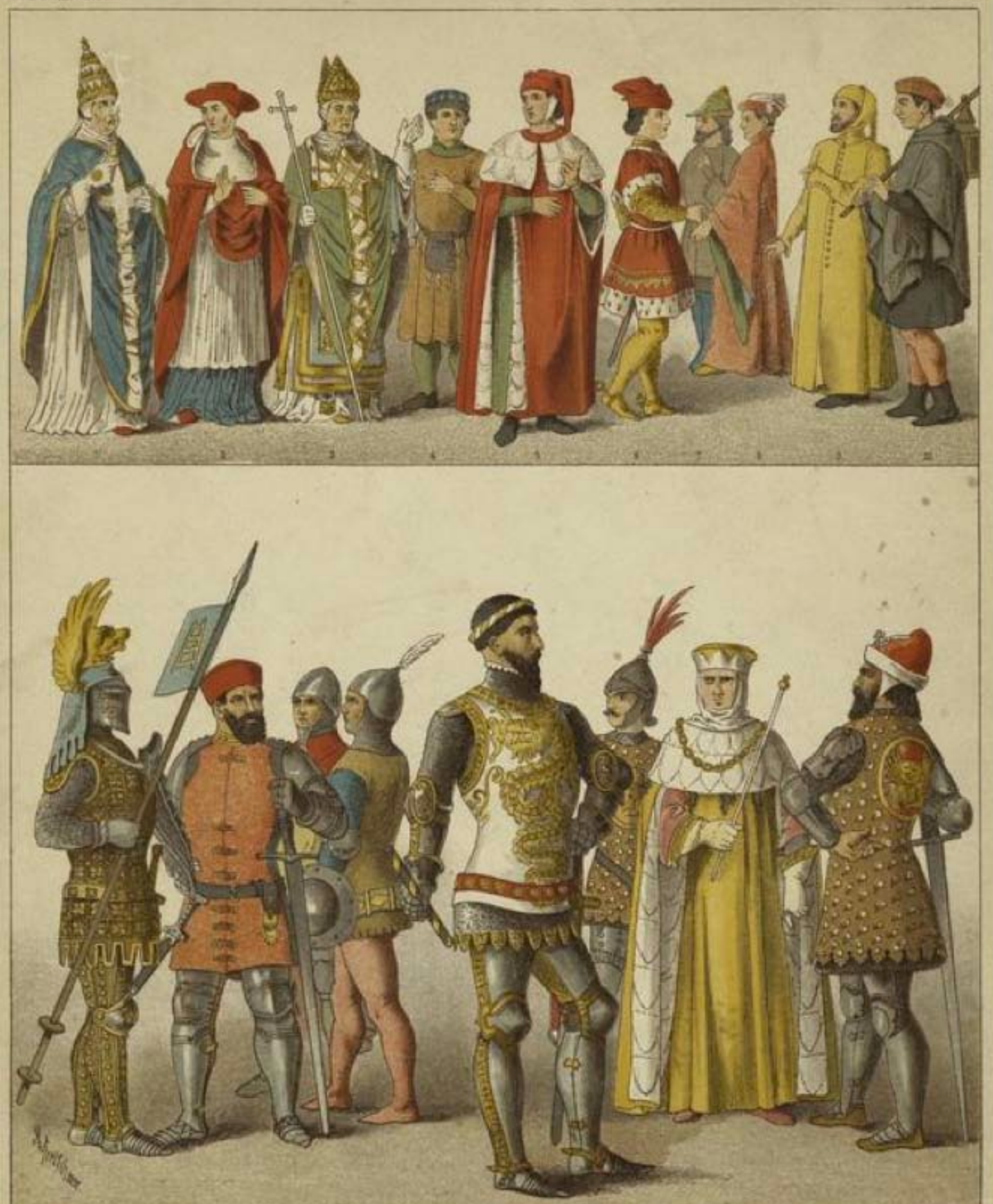
1 Page 2 Combinet 8 Antibishop 4 9 Citinens 5 6 7, 8 Man of rank 10 Catchpoll (Contame of the presents). IL 12 13 Knights, 14 Soldier, 15 Berneho Vinconti (1985). No. Venetian Warrior, 17 Roman Senetur, 18 Dage of Venice.