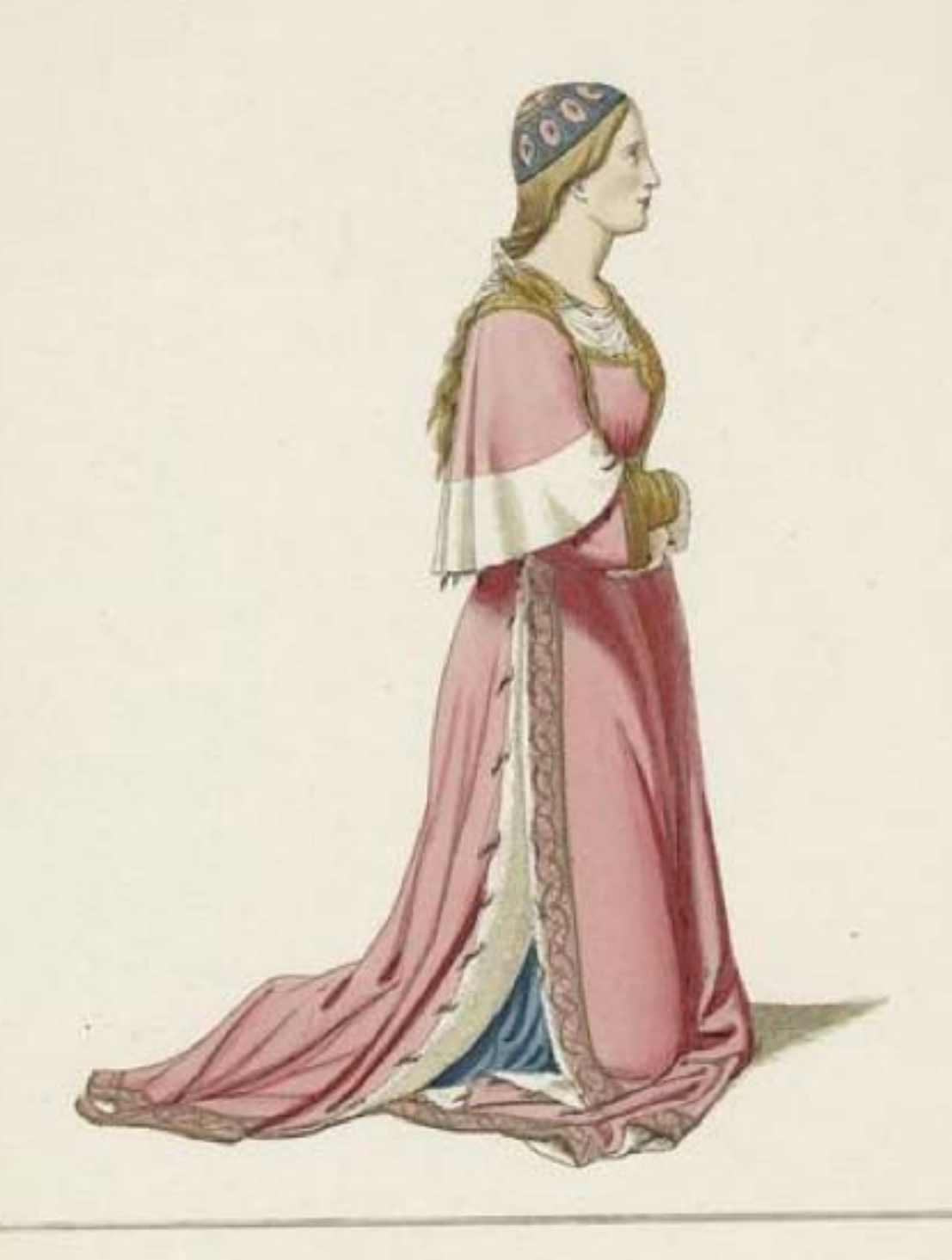
JEVNE FLORENTINE XIVE SIÈCLE