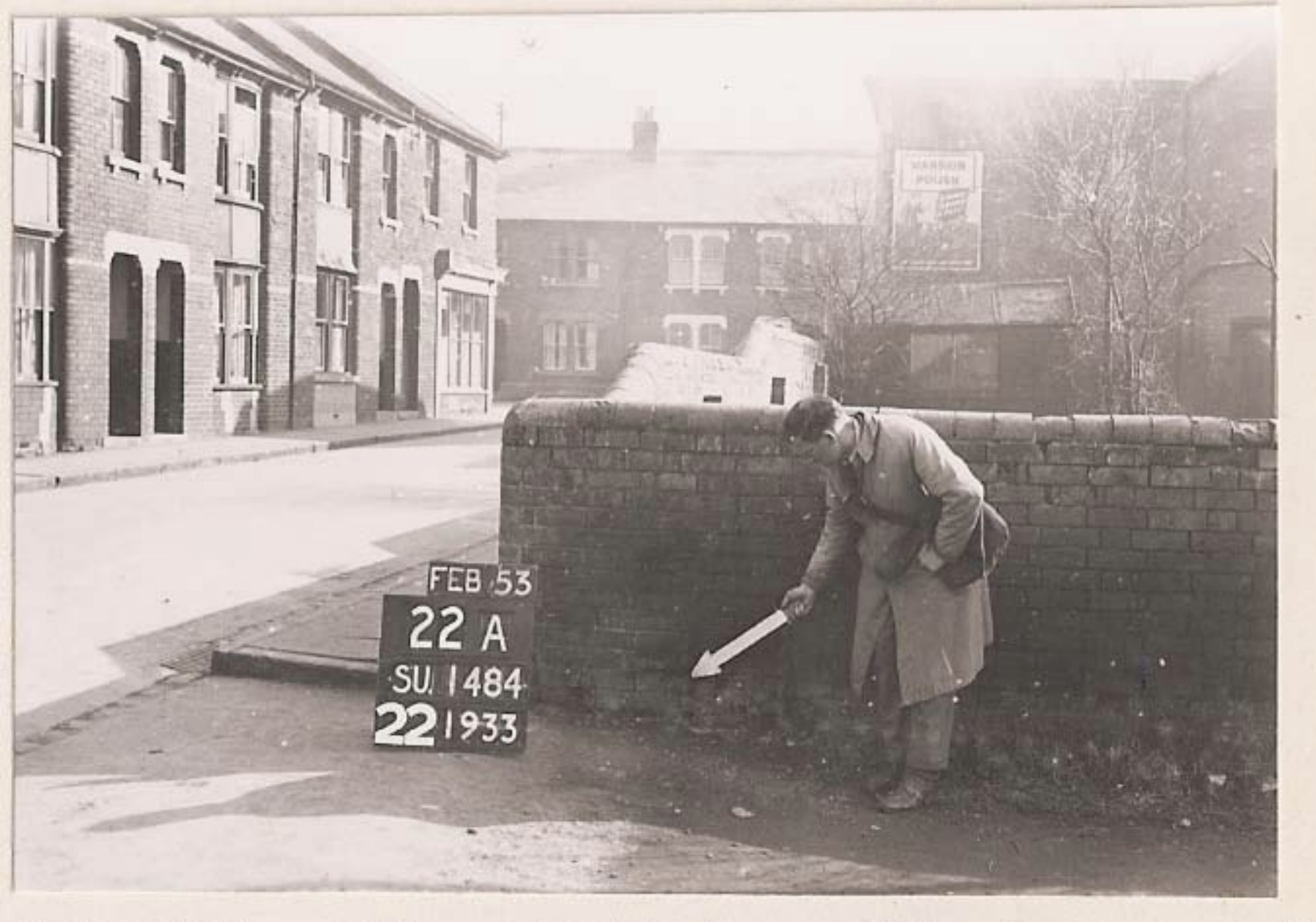
RP. 22A. Pipe Nail in wall at rear of No. 108 Albion Street.