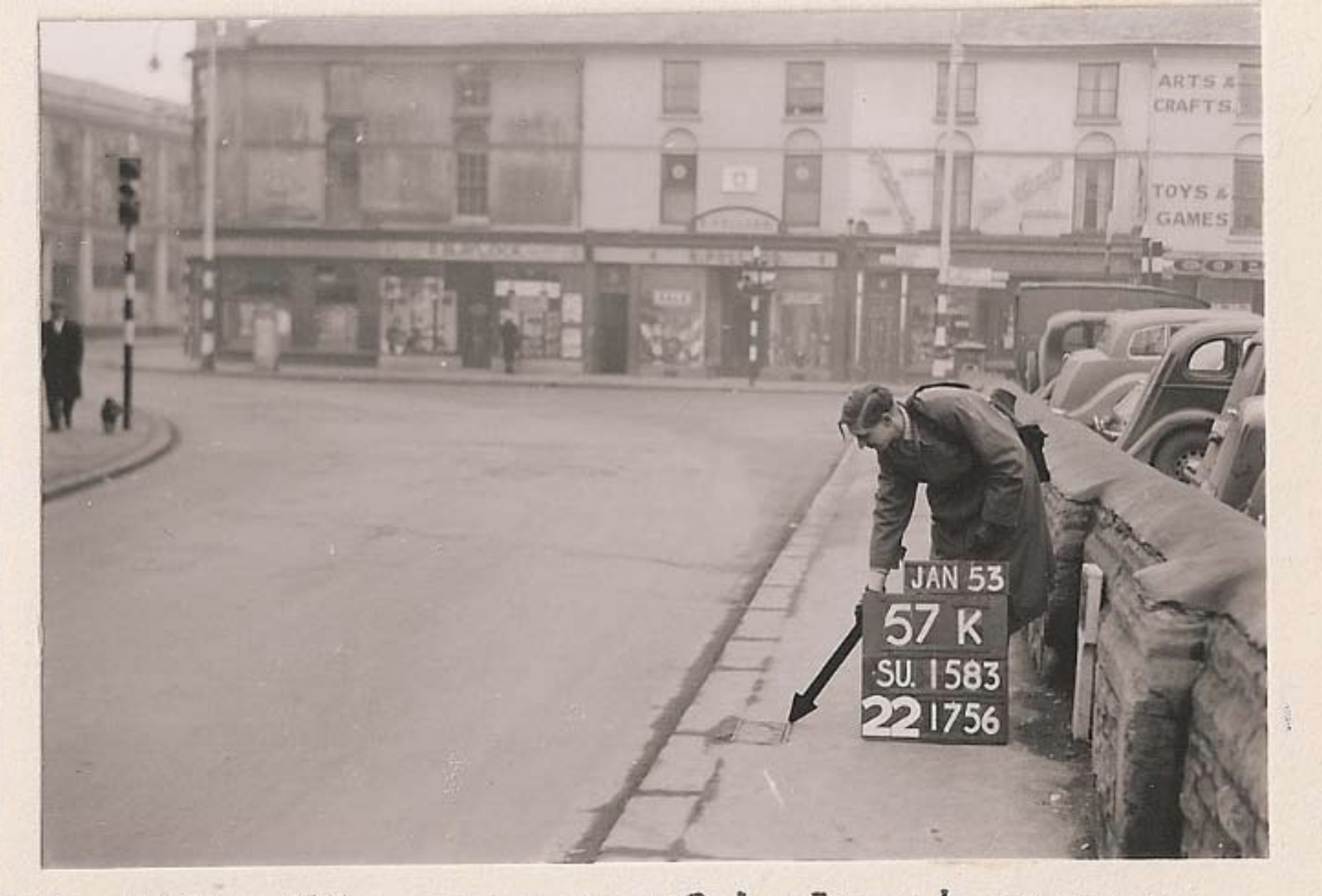
RP. 57K. SW. corner of hydrant cover, Victoria Road