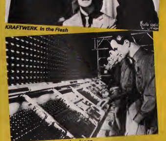
KRAFTWERK: Send in the clones.

Dig a little deeper in both time and pocket and you'll encounte the Polydor re-issue "Phases", a nine-album set (including two double albums) of the entire Who back catalogue. This entails "My Generation", "A Quick One", "Who Sell Out", "Tommy", "Live At Leeds", "Who's Next", "Quadrophenia", "Who By Numbers" and "Who Are You" and is all yours for a mere £24.