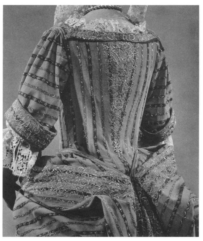
FIGURE 3 Detail of the gown shown in Figure 1, the back of the bodice

Now it is perfectly obvious that no one textile, no matter how deceptive its pattern, could possibly answer all those descriptions. To set the record straight, let it be said here that the fabric is not broadcloth but