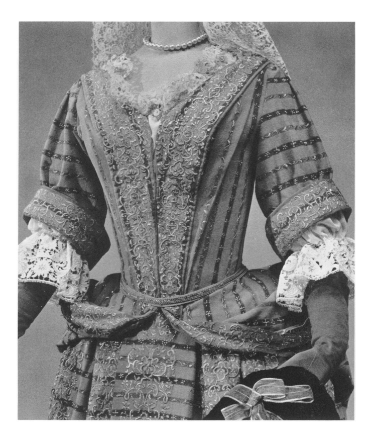
FIGURE 2 Detail of the gown shown in Figure 1, the front of the bodice

ange and blue stripes"; "gray wool with brown and blue stripes edged in red"; "gray wool, striped in indigo blue and henna"; "dark grey woollen fabric with narrow woven stripes alternately brown and blue, edged with red" or "grey wool with brown and blue stripes"; "warm gray broadcloth, striped predominantly in royal blue and dull gold" or "grayed-tan wool with stripes of blue bordered with orange-red and dull gold bordered with rust" (which is almost right); "lainage bleu et argent"; "grey wool, striped in indigo blue and henna."