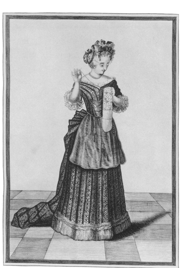
FIGURE 8 Fille de qualité, en d'Eshabillé d'Esté, by Nicolas Arnoult, French, dated 1687. Engraving. The Metropolitan Museum of Art, Whittelsey Fund, 57.559.5, leaf 3