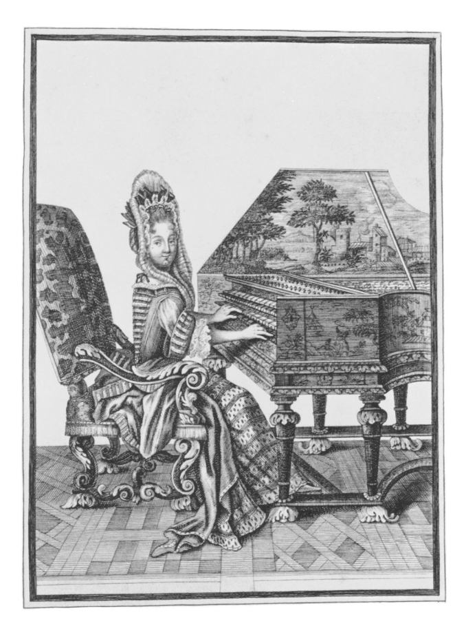
FIGURE 11 Femme de qualite Jouant du Clav'esin, by Nicolas Arnoult, French, dated 1688. Engraving. The Metropolitan Museum of Art, Whittelsey Fund. 48.90.1

petticoat.<sup>20</sup> The Kimberley gown shows a similar disposition of ornaments on the bodice, sleeve cuffs, and skirt edges, although the ornament itself is of a very different sort. Two of these prints show a curious detail near the back of the neckline that perhaps represents a point of fashion.<sup>21</sup> The facings of the revers on the front of the bodice do not seem to continue intact to