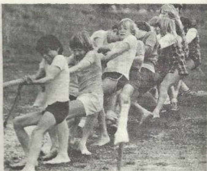
The right one