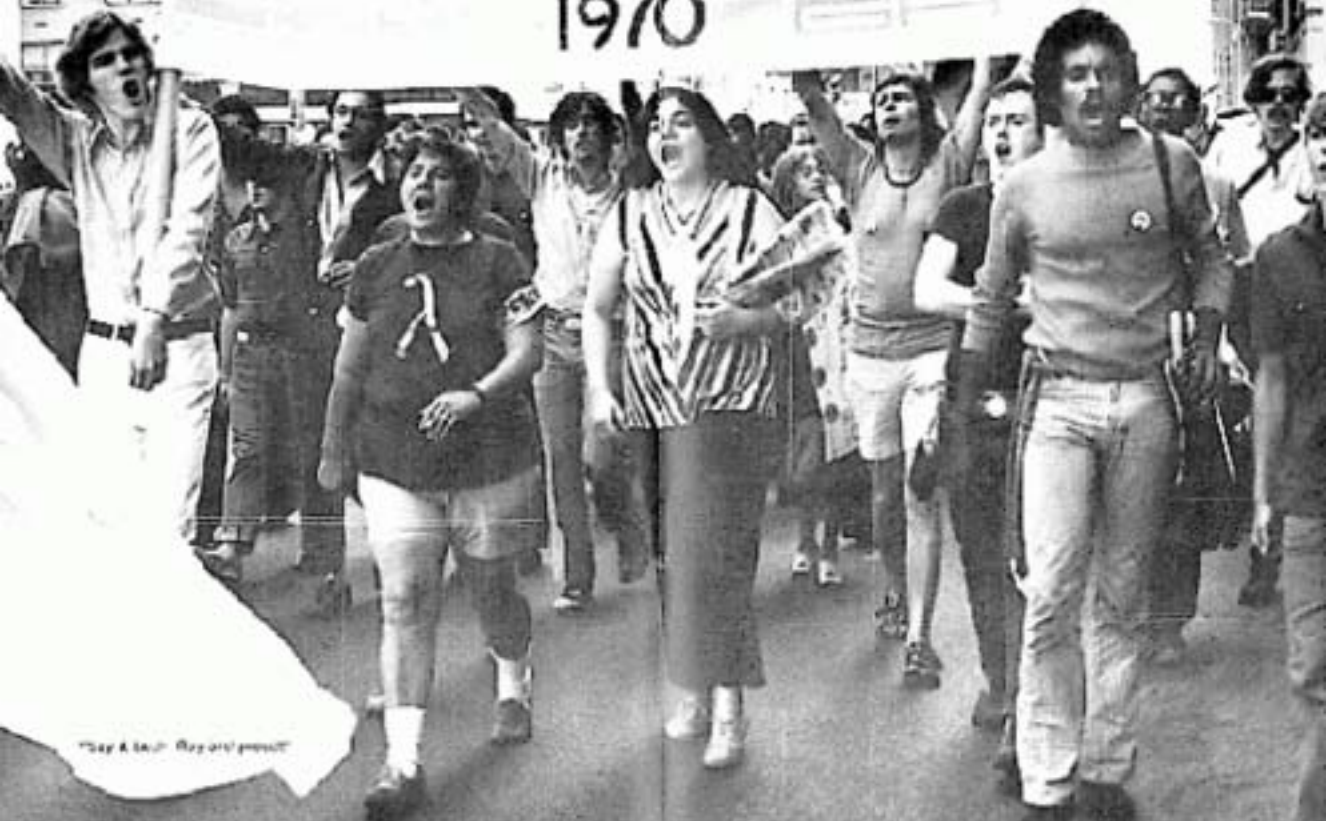
"Gay & Lesbian Day and Parade"