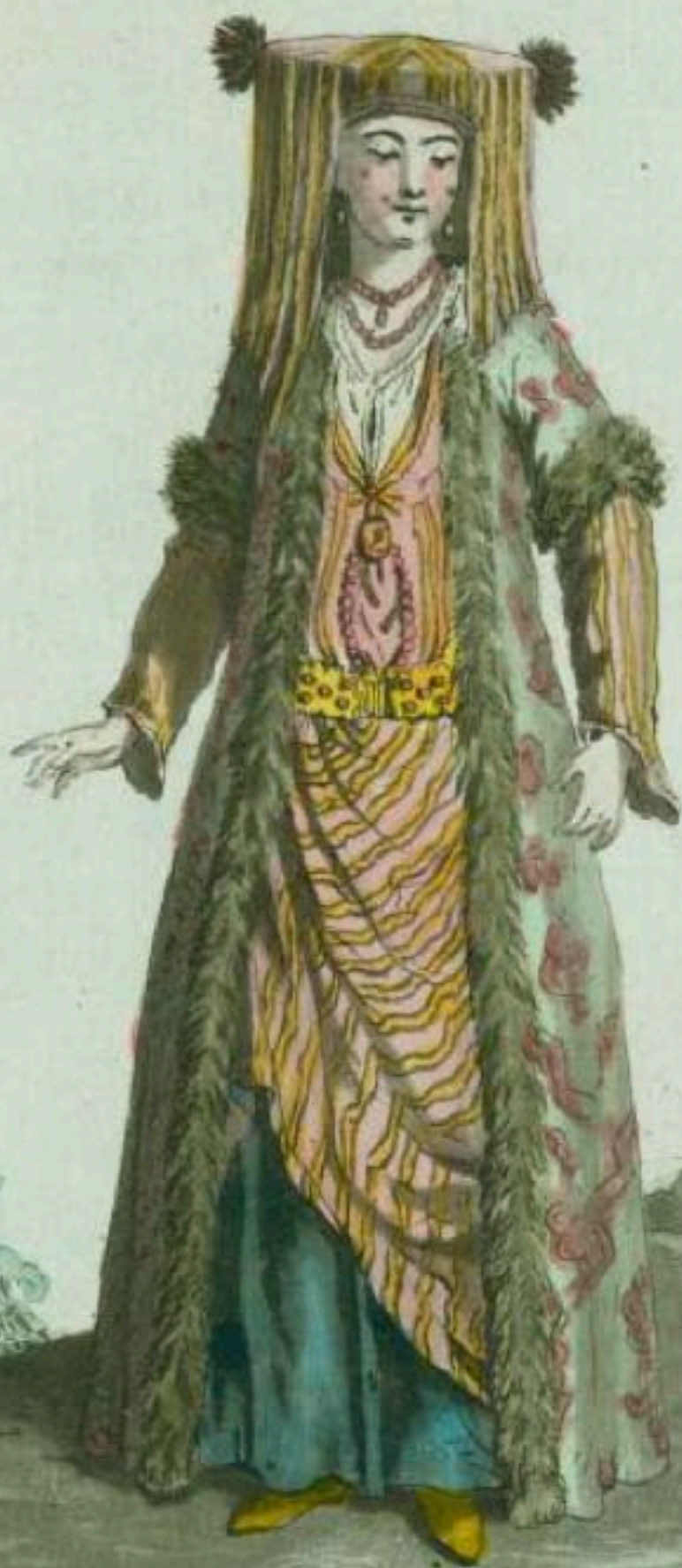
Armenienne en Habit de Cérémonie.