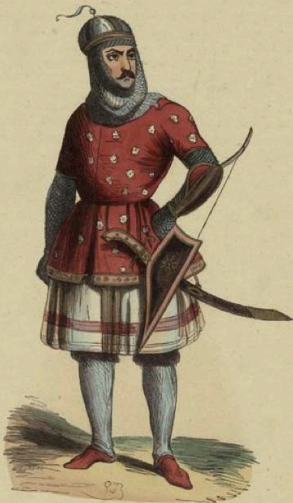
Circasso — Principe della grande Cabardia