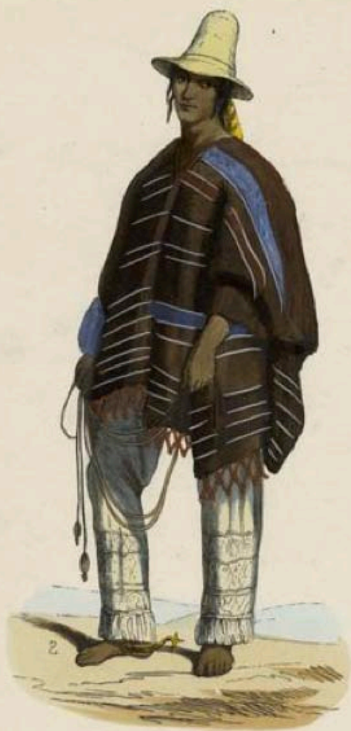
EIN GAUCHO AUS DER GEGEND VON BUENOS AYRES. #11,666 (1863)