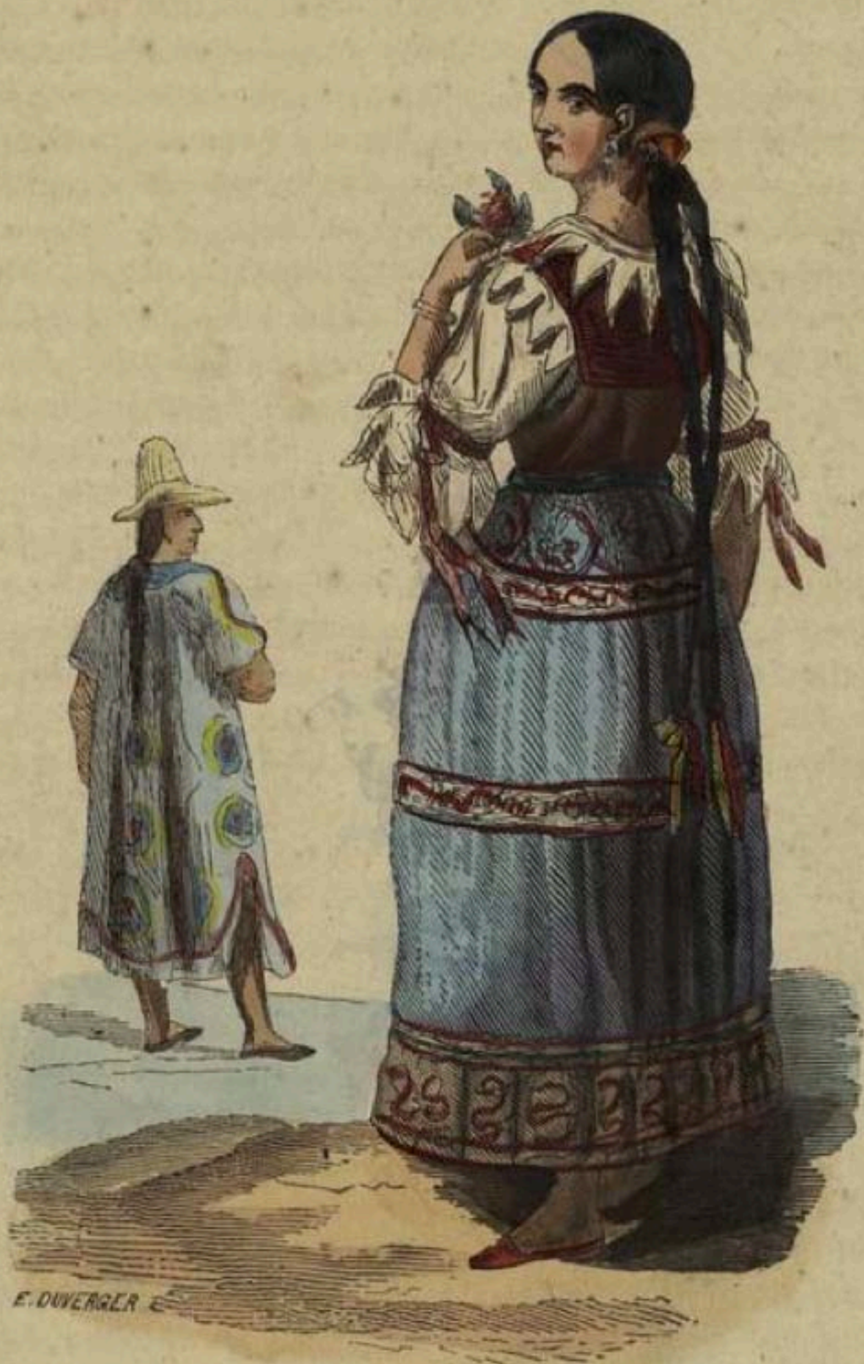
Uomo e donna di Bolivia (America del Sud)