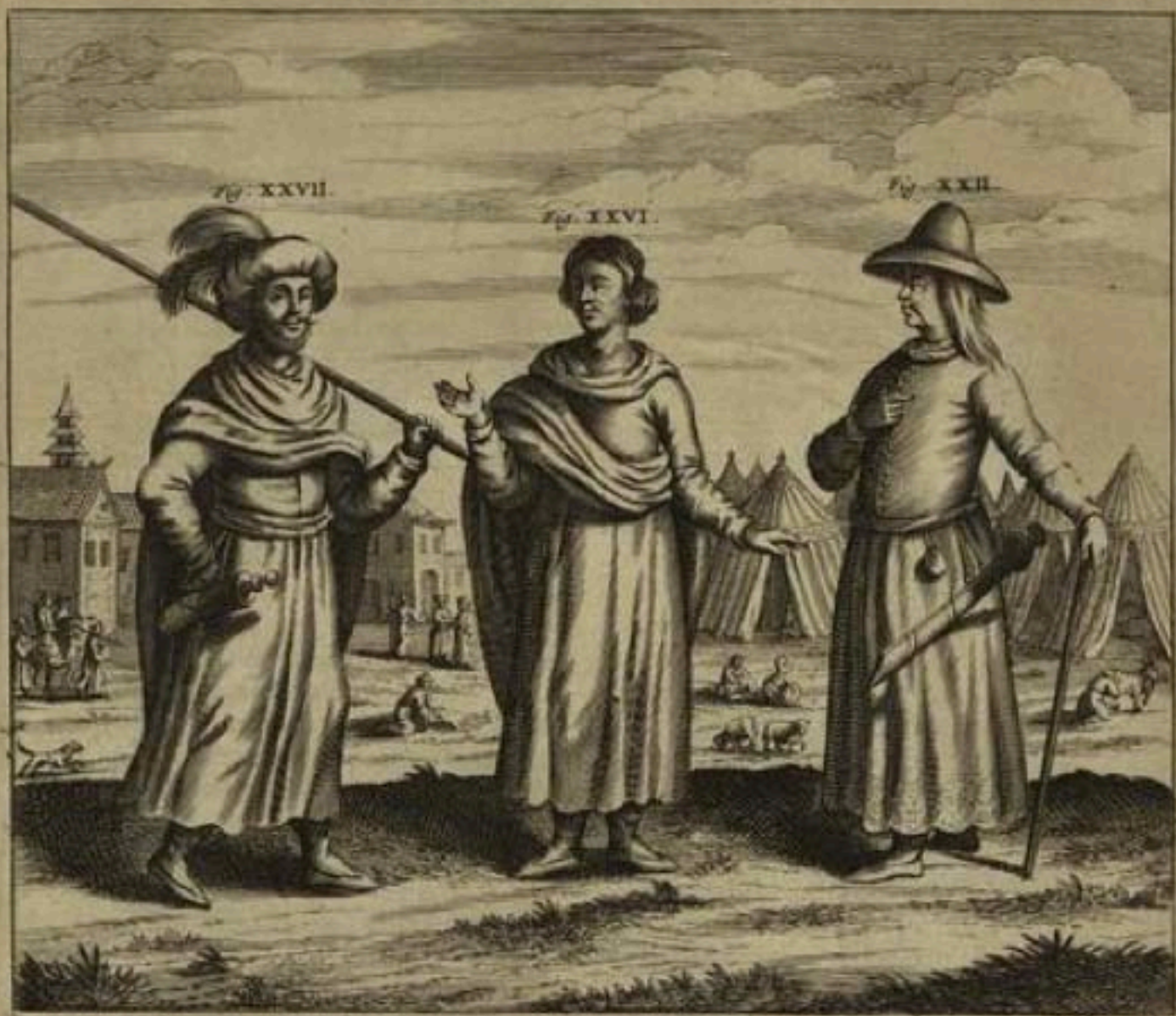
XXII. Tartari Septentrionalis.