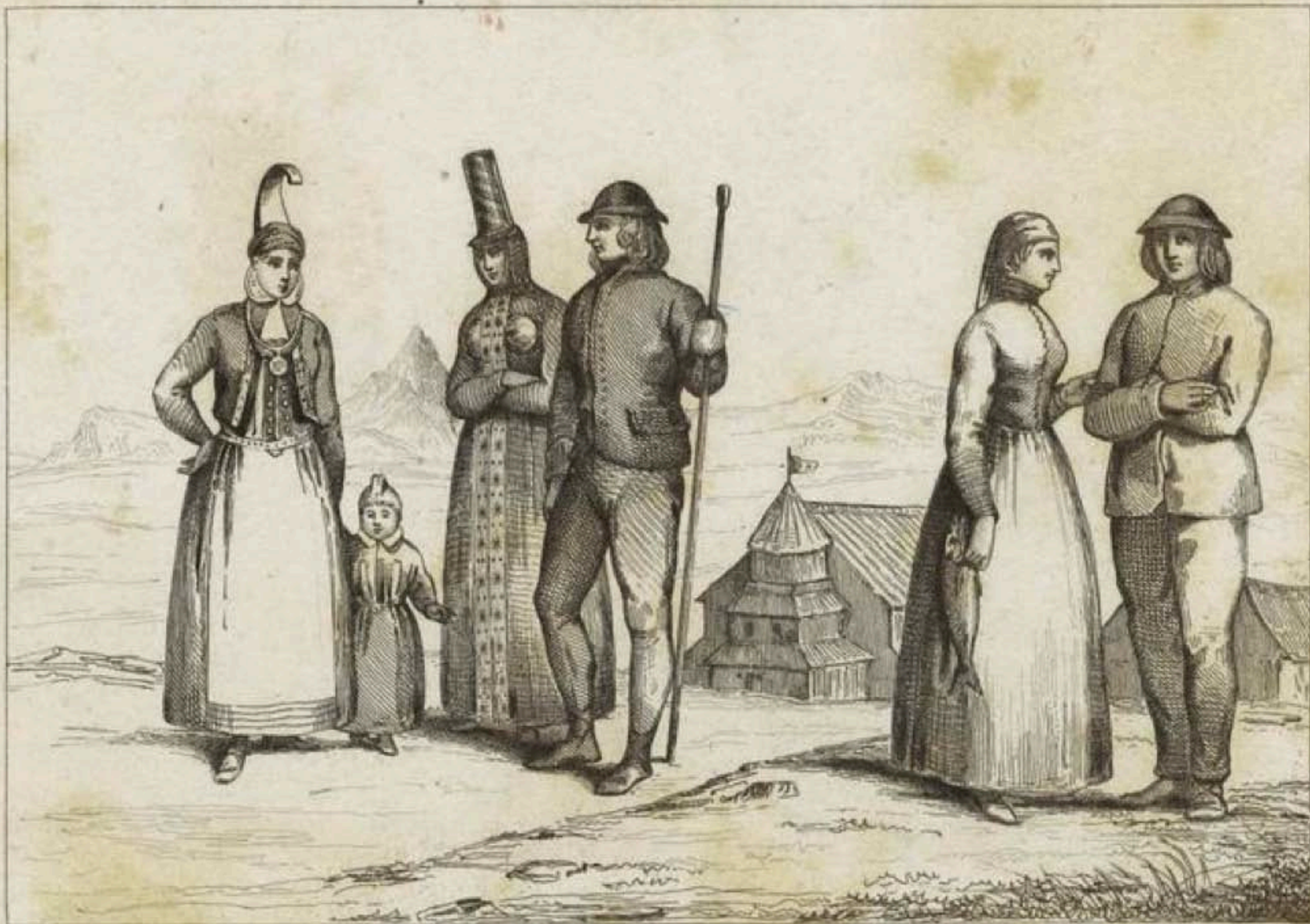
Costumes Islandais 1854