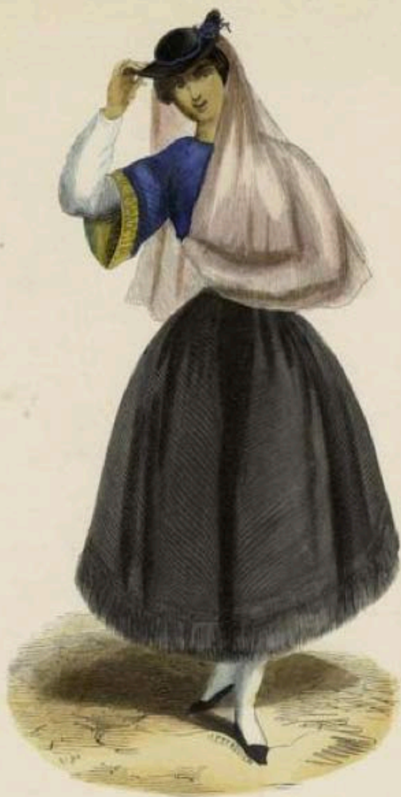
HISPANO-AMÉRICANÉDIN AUS BOGOTÁ 400, 660 (1853)