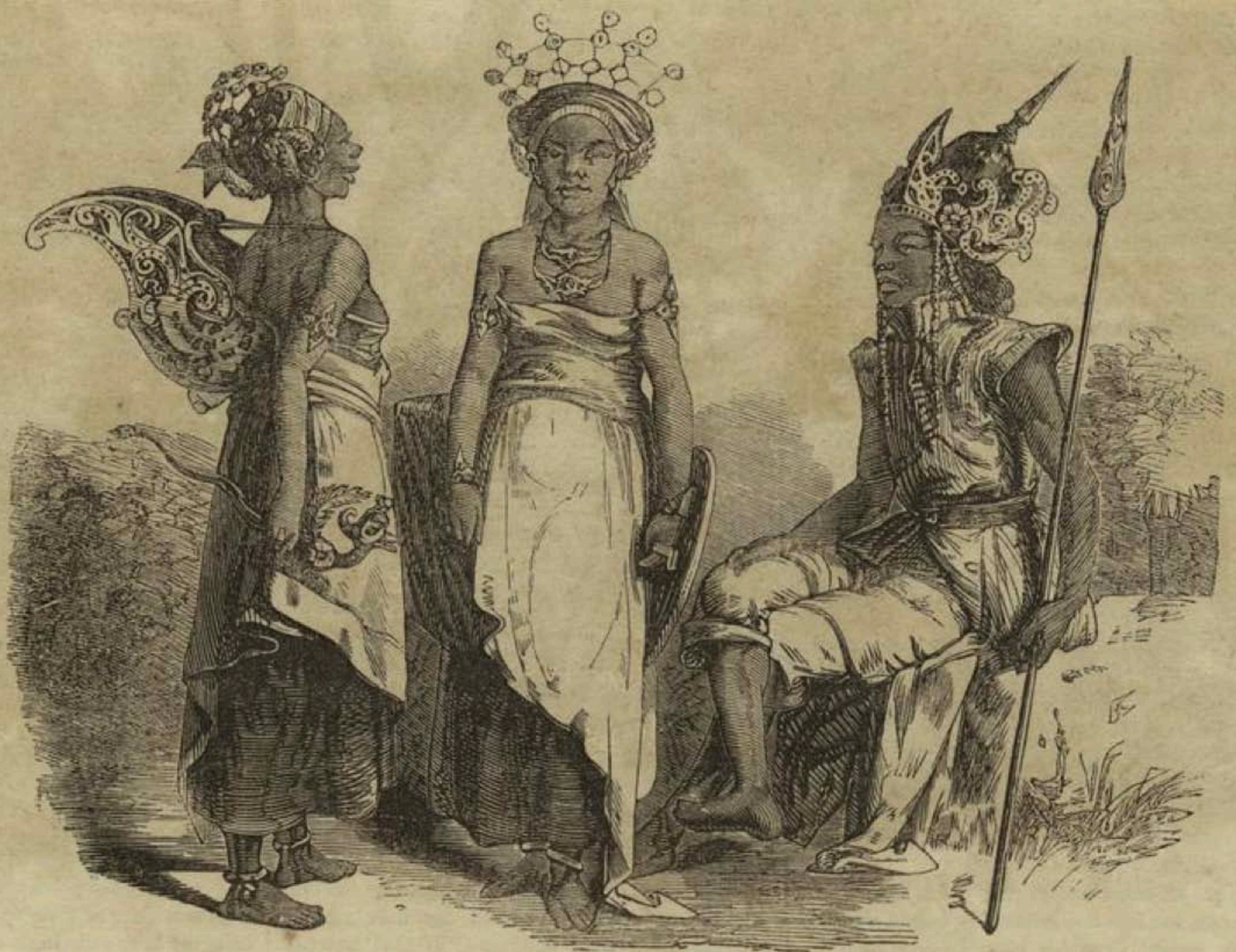
GAMBOUS, MIMIC DANSEUSE, AND BODY GUARD OF A JAVANESE CHIEF.