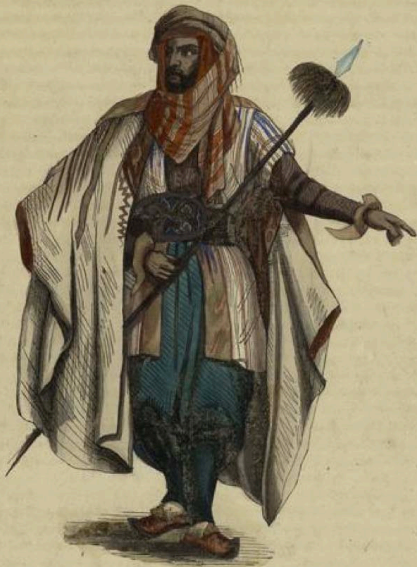
Abitante del monte Libano (Asia).