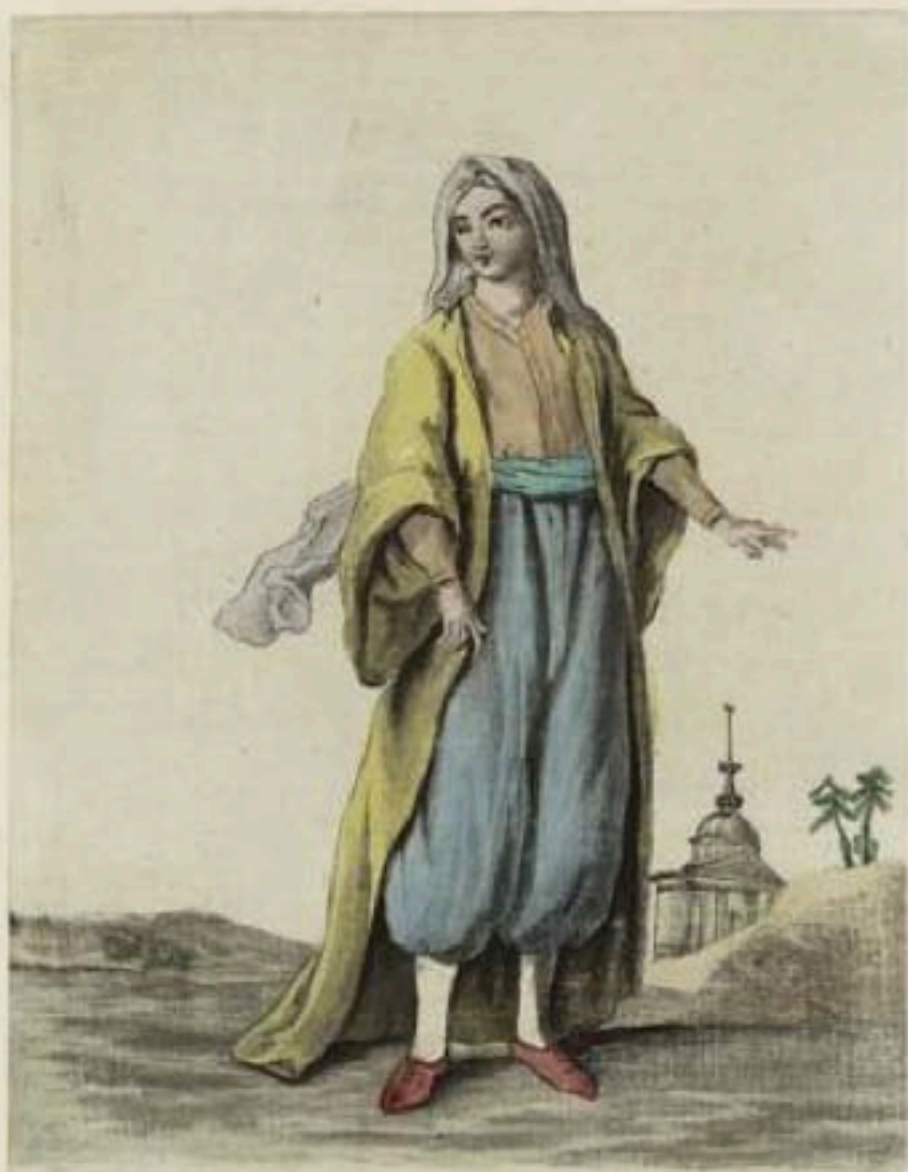
Femme de Jerusalem