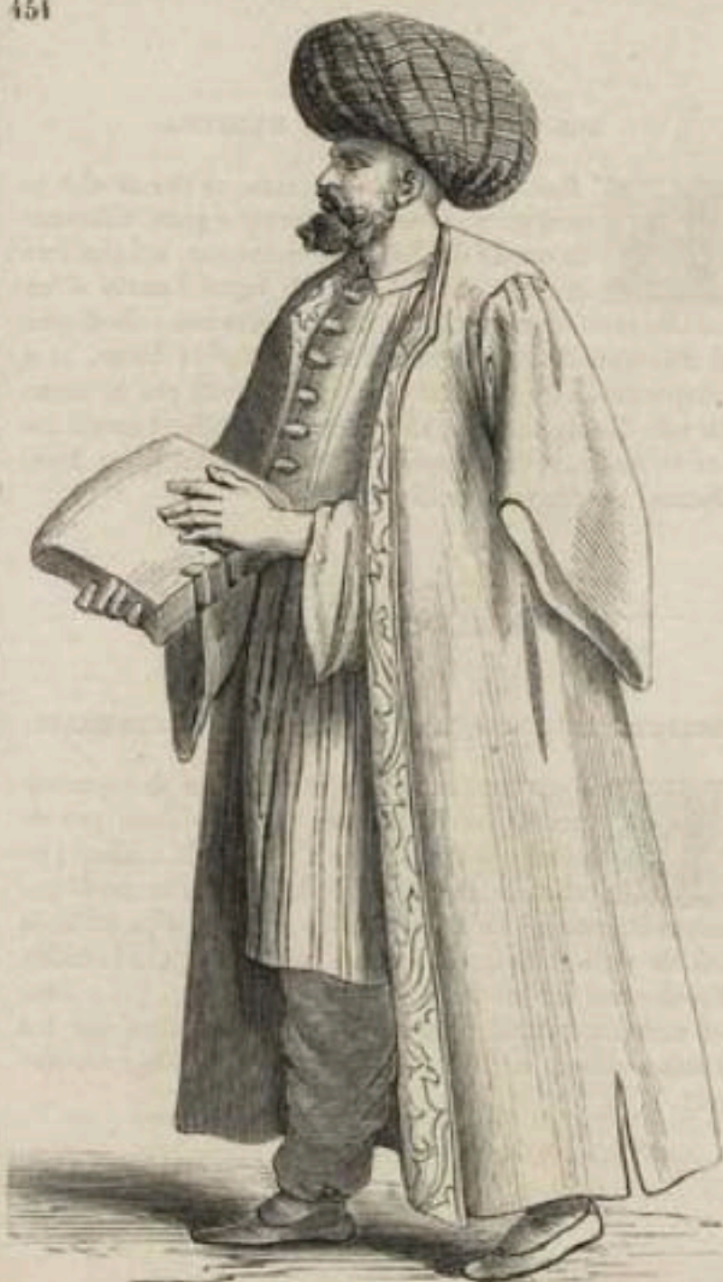
* 16 (1860) Armenian gentleman in Turkey 16 th Cen.