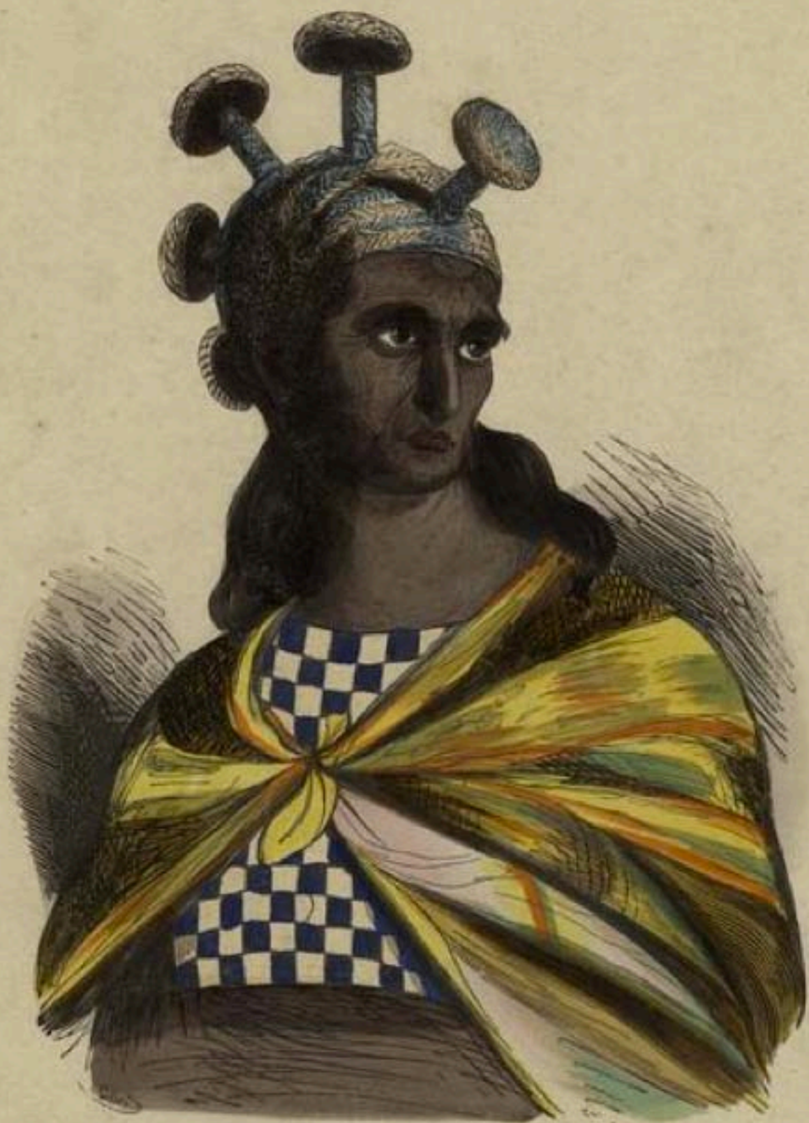
Guerriero delle isole Sandwich