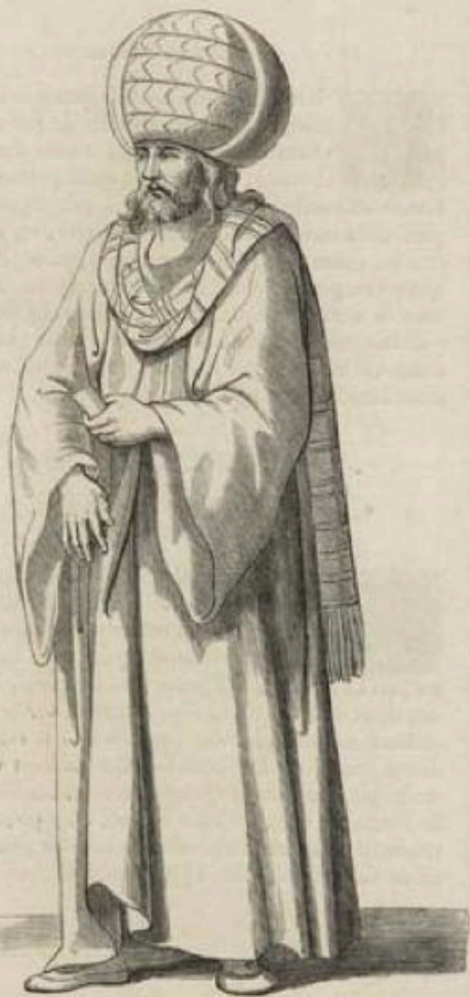
# 16 (1890) Armenian noble 16 th cen.