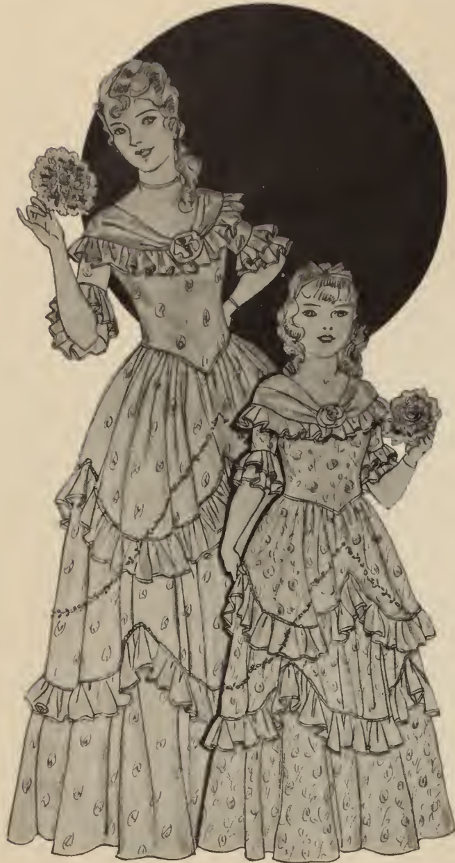
1. THE FULL, BROCADED SKIRT OF THIS COSTUME IS TRIMMED WITH CIRCULAR RUFFLES OF CONTRASTING MATERIAL. SMALL RUFFLES ON THE POINTED BODICE AND THE NECK AND SLEEVES.

up. The King was so pleased with the effect that all the women of the court began to wear ribbons tied around their heads with bows in front.