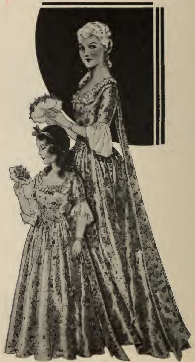
6. WATTEAU PLEATED GOWN, WORN BY WOMEN OF THE COLONIAL PERIOD AT COURT FUNCTIONS. THIS GRACEFUL PLEAT ALWAYS ENDED IN A VERY FULL TRAIN.

The beautiful laces of this period deserve special mention. Every one wore lace—it trimmed gowns, made