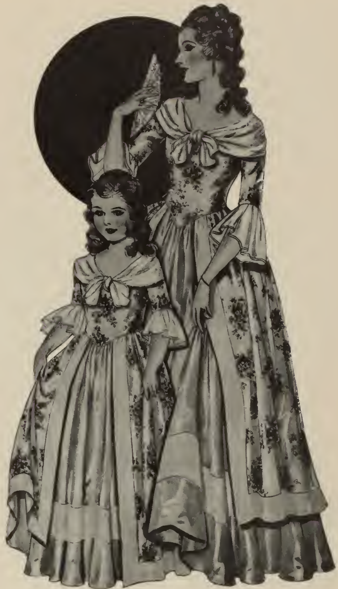
8. ANOTHER DAINTY FIGURED BROCADE GOWN OF THE PERIOD. THE EDGING OF THE PANNIER AND THE 'KERCHIEF, ENDING IN A SOFT BOW AT THE NECK, WERE OFTEN OF A CONTRASTING PLAIN COLOR.

were thin soled and quite unfit for wet weather. On such occasions, as well as for rough walking, women wore pattens or clogs, which raised the wearer clumsily from the ground.