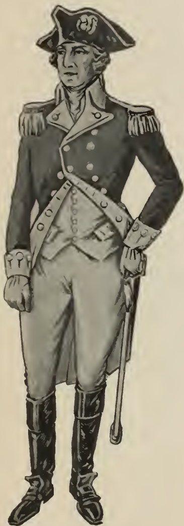
19. WASHINGTON'S UNIFORM.

in the form of a globe, the creneaux or head piece of which was composed of white satin, having a double wing, in large plaits, and trimmed with a wreath of artificial roses, falling from the left at the top to the right at the bottom, in front, and the reverse behind. The hair was dressed all over in detached curls, four of which, in two ranks, fell on each side* of the neck, and were relieved