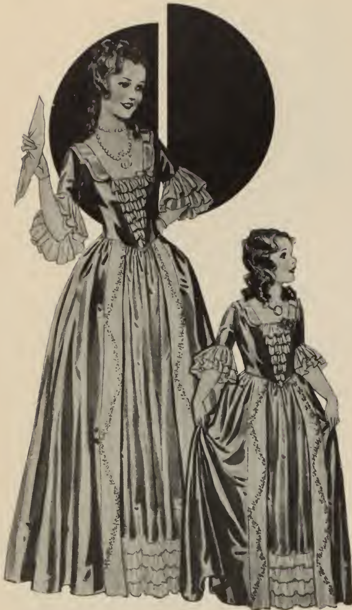
5. THIS EXAMPLE IS MADE WITH A FULL PLAIN EFFECT WITH LACE-EDGED PANNIER. SOFT SILK RUFFLES OF GRADUATING SIZE TRIM THE BOTTOM OF THE SKIRT AND THE BODICE.

made of cardinal wool. The "Capuchins" were patterned after the habit of the Capuchin friars, with two long points in front and a hood attached. A most fashionable style in the later eighteenth century was the pelisse, a garment made with or without sleeves, but when made with slits for the arms termed a cloak. Sometimes a pelisse had a broad collar, at other times a hood. Costly pelisses were trimmed with fur.