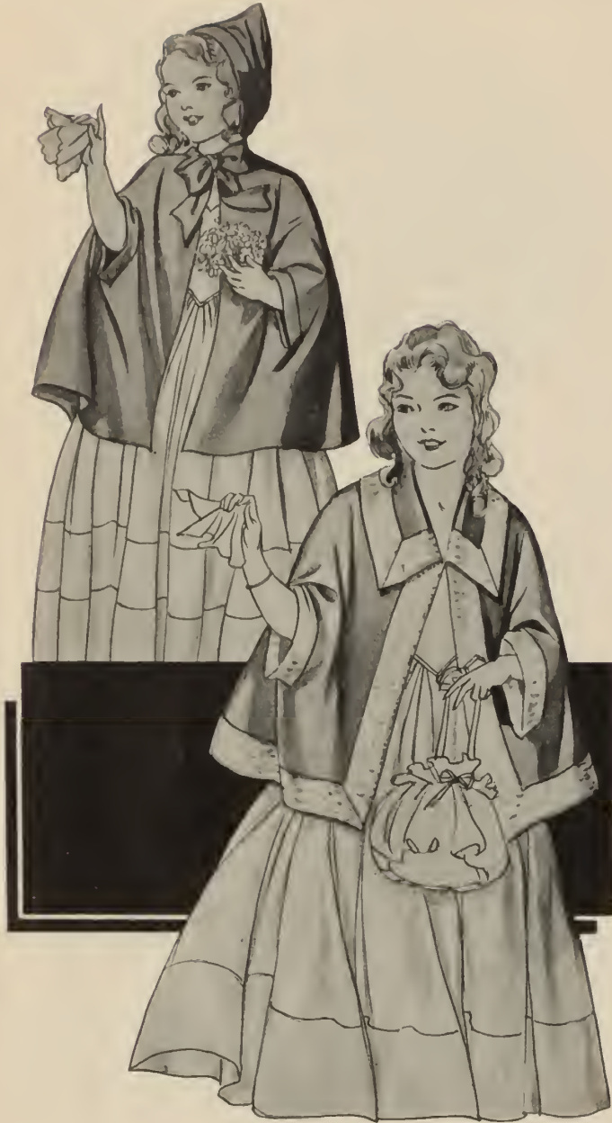
17. A FINE EXAMPLE OF OUTDOOR DRESS FOR GIRLS, WITH THE LOOSE WRAPS OF THE PERIOD.