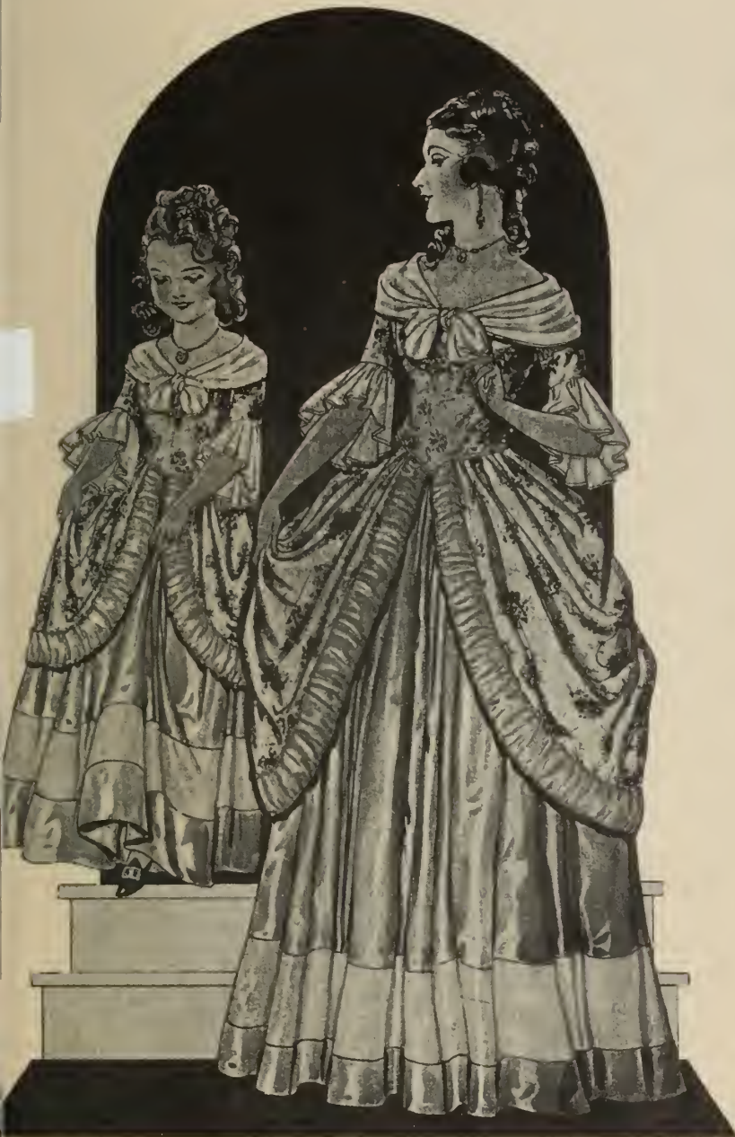
15. A PLAIN SATIN SKIRT MADE VERY FULL OVER A HOOP SKIRT; PANNIERS OF FLOWERED BROCADE, LOOPED HIGH OVER THE HIPS. BODICE, ALSO OF BROCADE, POINTED BOTH BACK AND FRONT, WITH ELBOW SLEEVES.

The little girl, as well as her dress, is the same. In Colonial days children were dressed in the same way as their parents, with every accessory in the same way, but even their play clothes were cut from the same patterns.