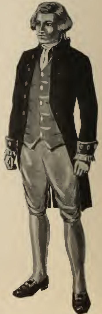
9. A COLONIAL GENTLEMAN.

A favorite material for gentlemen's coats was velvet or other fine cloth. Black was worn, although the two most fashionable shades were the far from somber claret and green. Waistcoats were frequently made of rich silks flowered in large patterns