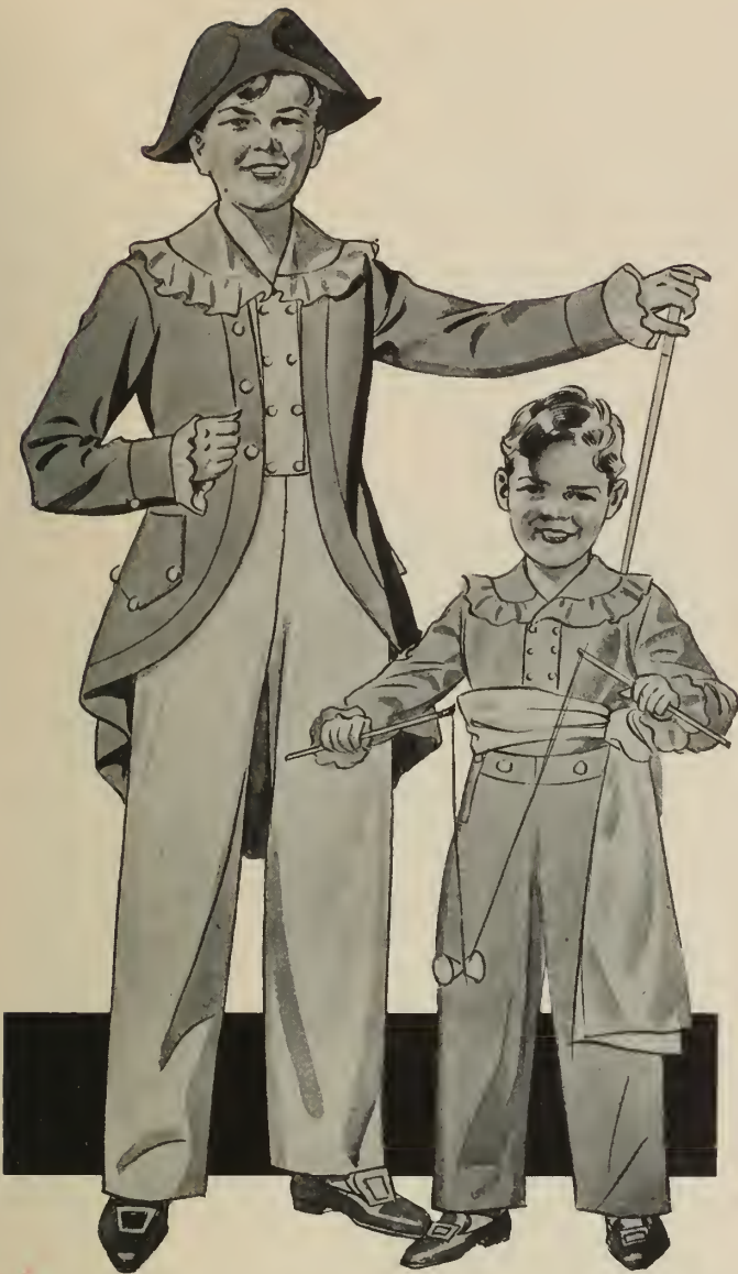
11. EVERY DAY CLOTHES FOR OUT-OF-DOOR WEAR, OF THE COLONIAL PERIOD.