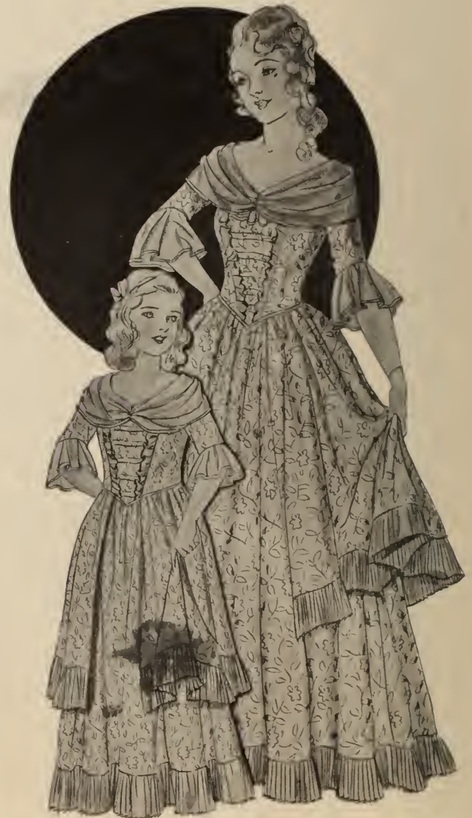
2. THIS UNUSUALLY BEAUTIFUL COLONIAL COSTUME, FOR EVENING WEAR, HAS ITS PANNIER AND SKIRT FINISHED IN A RUFFLE OF FINE PLEATING.

Bonnets also were worn during this period. Slat sun-bonnets were popular in the country and the calash, or bashful bonnet, was worn as early as 1765. This head-covering was usually made from green or brown silk, shirred over whalebones placed about two inches apart. It resembled a miniature hood or top to an old chaise or calash. The calash bonnet was extensible and could be worn either standing up at the back of the head or extended over the face.