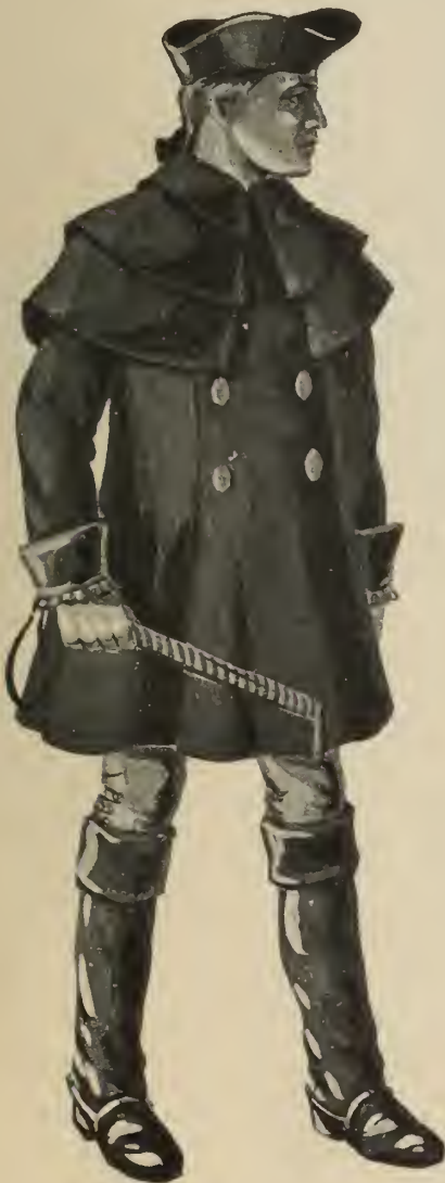
10. A COLONIAL TRAVELING COSTUME.

The "solitaire" was a black silk ribbon worn about the neck. In the back, it was attached to the wig-bag of the back hair and in front lost itself in the frills of the jabot or was caught by a broach. Sometimes the solitaire was tied in a bow knot under the chin. It added to the great charm of the Colonial gentleman's costume—ruffled jabot at the throat, jeweled stock buckle, powdered wig with bag and solitaire—these were very becoming fashions.