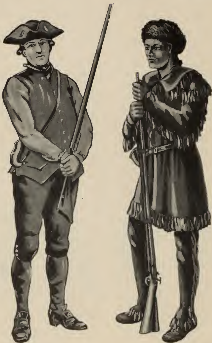
25. A MINUTE MAN.

There prevails, in the minds of most Americans, the erroneous belief that the blue coat faced or trimmed with buff was the regulation uniform coat of the Continental Armies. Red was the color most popular and was more generally in use for facings and the trimming of collars, cuffs and edgings. It is plain that but few troops ever wore the "blue and buff," and after General Washington's "uni-