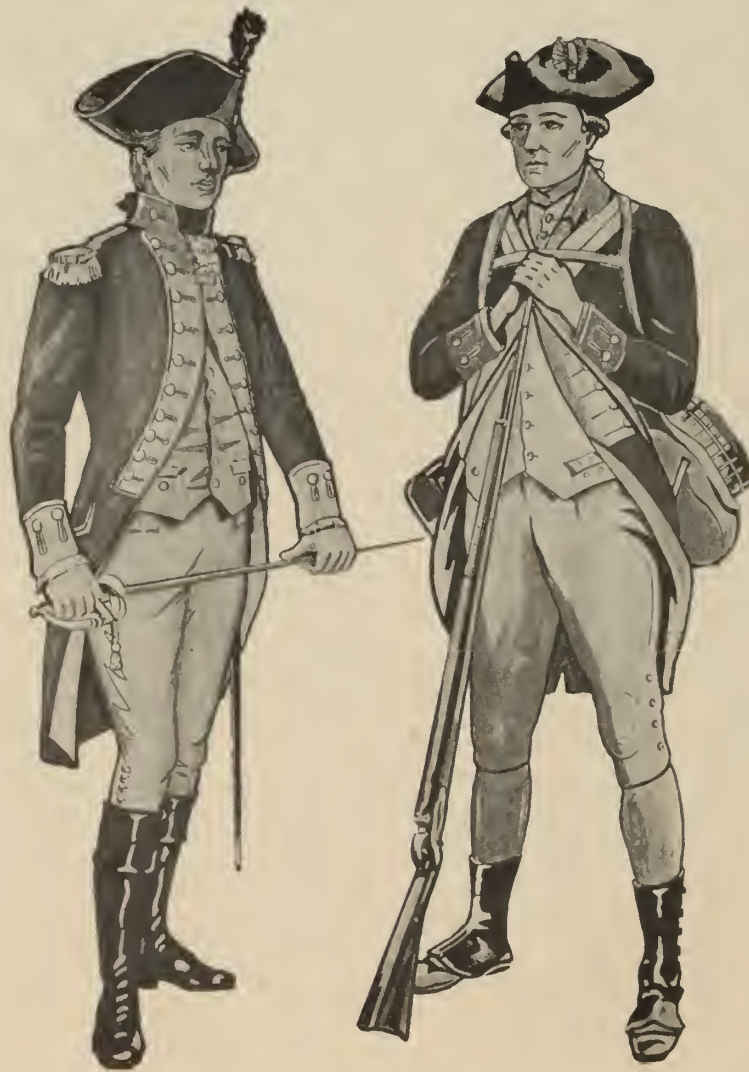
21. AMERICAN OFFICER. 22. AMERICAN PRIVATE.

Almost every kind of material was used in the making of the early uniforms, from broadcloth to canvas. The coats were of coarse, home-woven, woolen materials. Commissioned and non-commissioned officers' coats were often made of a finer grade of woolen than those of the privates. Waistcoats and breeches were fashioned from a variety of materials—