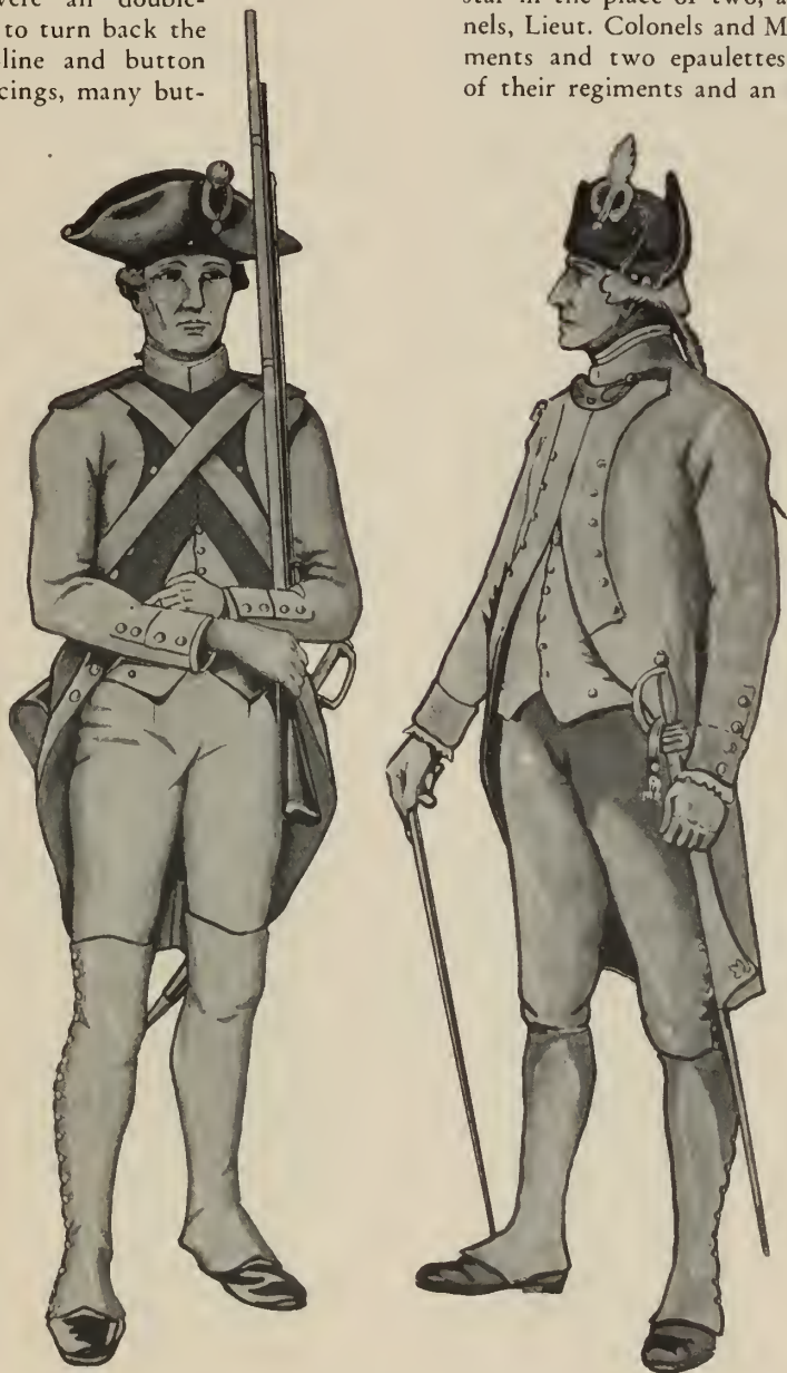
27. FRENCH PRIVATE. 28. FRENCH OFFICER.

The Subalterns, the uniform of their regiments and an epaulette on the left shoulder. The Aides-de-Camp, the uniform of their General officers. Those of the Major Generals and Brigadier Generals to have a green feather in the hat. Those of the Commander-in-Chief, a white and green. The Inspectors, as well Sub. as Brigade, the uniforms of their ranks and Corps, with a blue feather in the hat. The Corps of Engineers and that of Sappers and Miners, a blue coat with buff facings, red lining, buff underclothes, and the epaulettes of their respective ranks. Such of the Staff as have military rank to wear the uniform of their ranks, and of the Corps to which they belong in the line. Such as have no military rank to wear plain coats, with a cockade and sword. All officers, as well warrant as commissioned, to wear a cockade and side arms—either a sword or genteel bayonet. The General recommends it to the officers, as far as practicable, to provide themselves with the uniforms prescribed for their respective Corps by the regulations of Congress, published in General Orders, the 2d