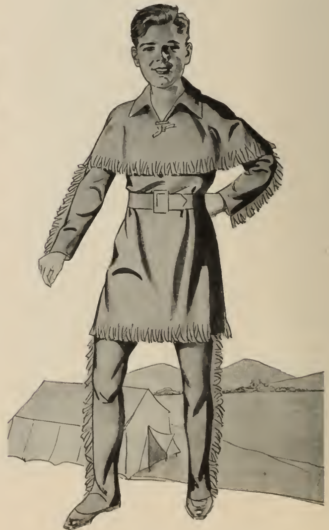
18. BOYS' HUNTING DRESS.

"And here Gentn. I cannot forbear ushering in a Complaint of the exorbitant prices of my Goods this year all of which are to come to hand. . . . For many Years I have Imported Goods from London as well as other Ports of Britain and can truly say I never had such a penny worth before. It would be a needless Task to innumerate every Article that I have cause to except against, let it suffice to say that Woolens, Linnens, Nails & ca. are mean in quality but not in price, for in this they excel indeed, far above any I have ever had."