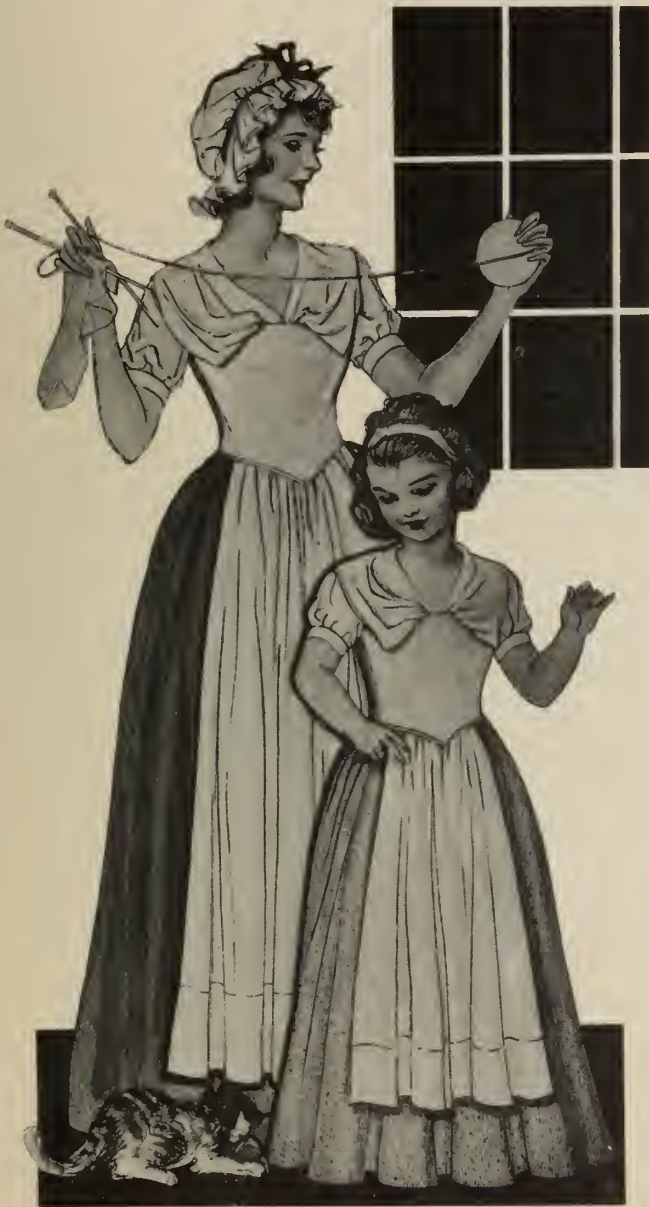
7. ANOTHER EXAMPLE OF THE MORNING DRESS OF THE COLONIAL PERIOD. THE APRON, AN EVERYDAY ACCESSORY FOR MORNING WEAR, IS MORE CLEARLY OUTLINED IN THIS PICTURE. THE 'KERCHIEF WAS FASTENED TO THE BODICE AND THE SLEEVES WERE WORN HALF WAY TO THE ELBOW.

The fashion of wearing red heeled shoes started in 1710. American women enthusiastically sponsored the vogue. By 1751 high heels were indispensable to well-dressed ladies. Various materials were used in making the shoes—"fine silk," "flowered russet," "white calamanco," "black shammy," "black velvet," "red morocco," etc. Most of the footwear bore the maker's name inside and the phrase, "Rips mended free." In 1790 heels disappeared completely and women wore sandal-like foot covering. The buckles of paste jewels were replaced by tiny bows or ribbon edging. But whatever else women's shoes were at this time, they