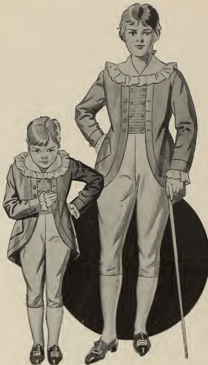
20. PARTY COSTUMES FOR BOYS, EDGED WITH EMBROIDERY. THIS WAS A PERIOD WHEN BOTH MEN AND BOYS WORE KNEE BREECHES FOR FULL DRESS.

behind by a floating chignon. Another beautiful dress was a perriot made of gray Indian taffeta, with dark stripes of the same color, having two collars, the one of yellow, and the other white, both trimmed with a blue silk fringe, and a reverse trimmed in the same manner. Under the perriot was worn a yellow corset or bodice, with large cross stripes of blue. Some of the ladies wore hats a l'Espagnole of white satin, with a band of the same material placed on the crown, like the wreath of flowers on the head-dress above mentioned. This hat, which, with a plume, was a very popular article of dress, was relieved on the left side, having two handsome cockades, one of which was at the top and the other at the bottom. On the neck was worn a very large plain gauze handkerchief, the ends of which were hid under the bodice."