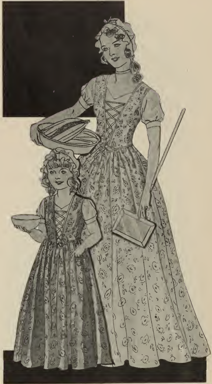
4. A SIMPLE HOME DRESS FOR INDOOR WEAR OF FLOWERED MATERIAL, MADE VERY PLAIN WITH FULL SKIRT.

fashion. Later, an extremely impractical broad-brimmed hat was worn for all except long distance traveling. While riding, a fan or parasol was often carried as a protection from the sun.