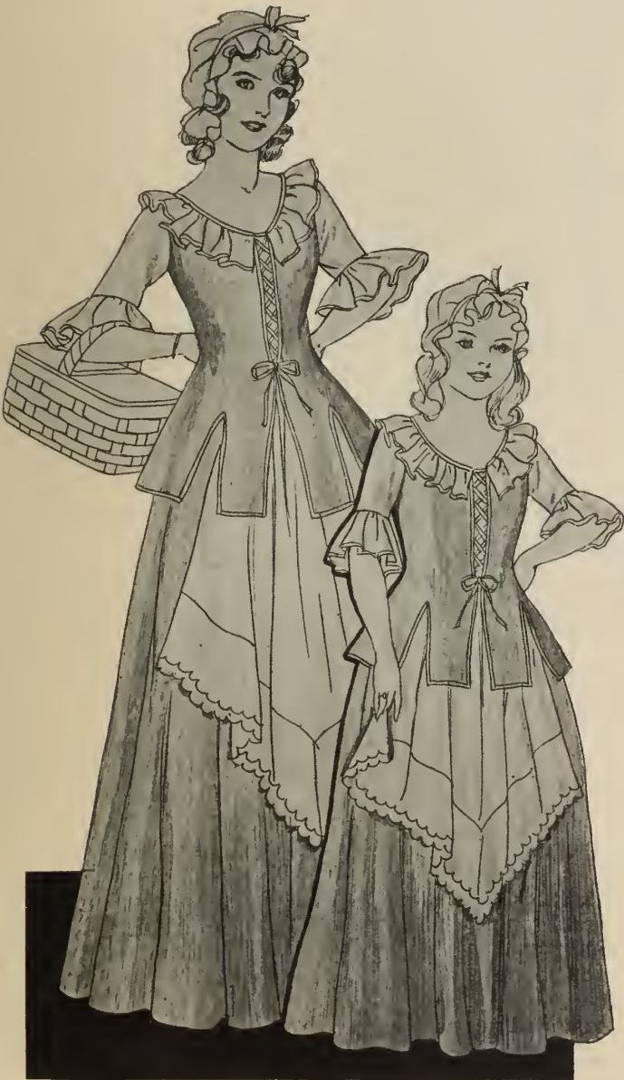
3. THIS EXAMPLE OF CALICO OR DIMITY WAS A FAVORITE MORNING DRESS. THE APRON WAS ALWAYS PART OF THE COSTUME AND WAS WORN BY BOTH WOMEN AND CHILDREN.

Riding habits generally consisted of a coat and a "safeguard," donned over the regular bodice and skirt to protect them against flying dust or mud. The safeguard, or riding petticoat as it was sometimes called, was made out of a sturdy linen or similar material. The coat was long (to the knee at first; in 1790, longer) and full-skirted, made to fit closely into the waist and fastened with buttons. At the throat the feminine rider favored a frill of lace or tailored cravat. Feathered cocked hats were the