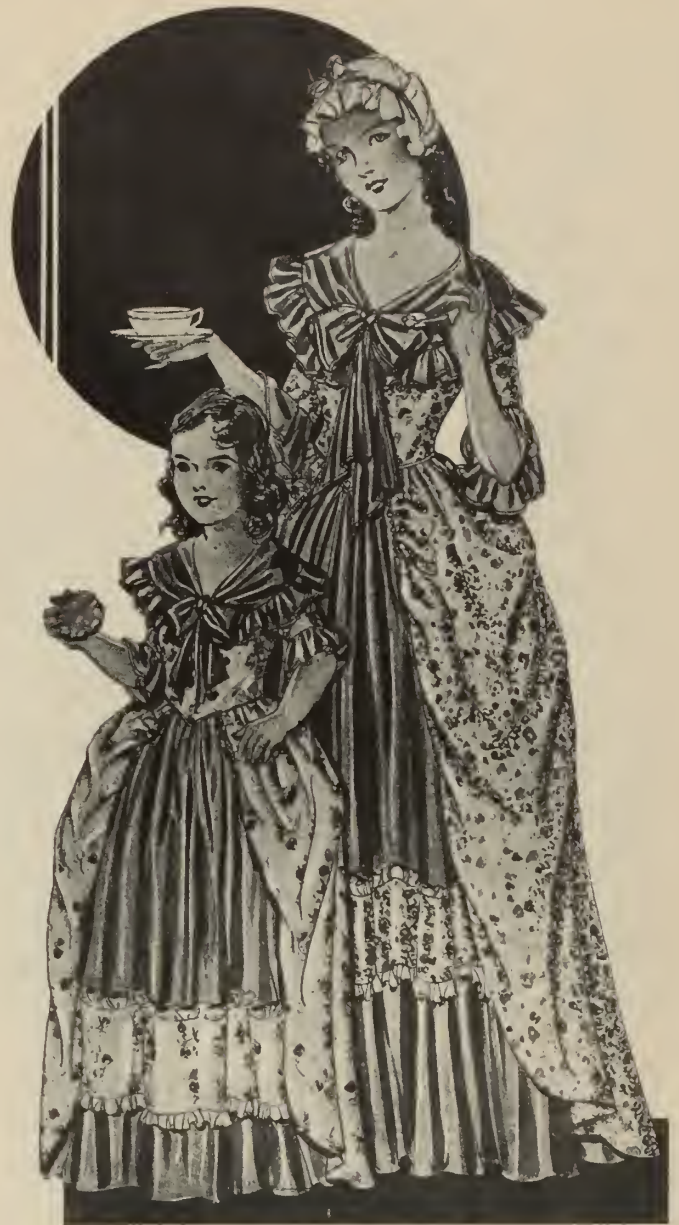
16. THE PANNIER EFFECT IN THIS FIGURE IS LONG AND FULL, GENERALLY ENDING IN A TRAIN. THE 'KERCHIEF' EFFECT AROUND THE POINTED BODICE WAS POPULAR.

Six thousand short whites. Six thousand cocking pins. One thousand hair pins."