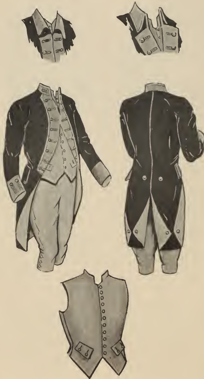
29. DETAILS OF COLONIAL UNIFORM.

The officers on campaign wore black leggings and in cold weather a cloak of white cloth with a cape six or