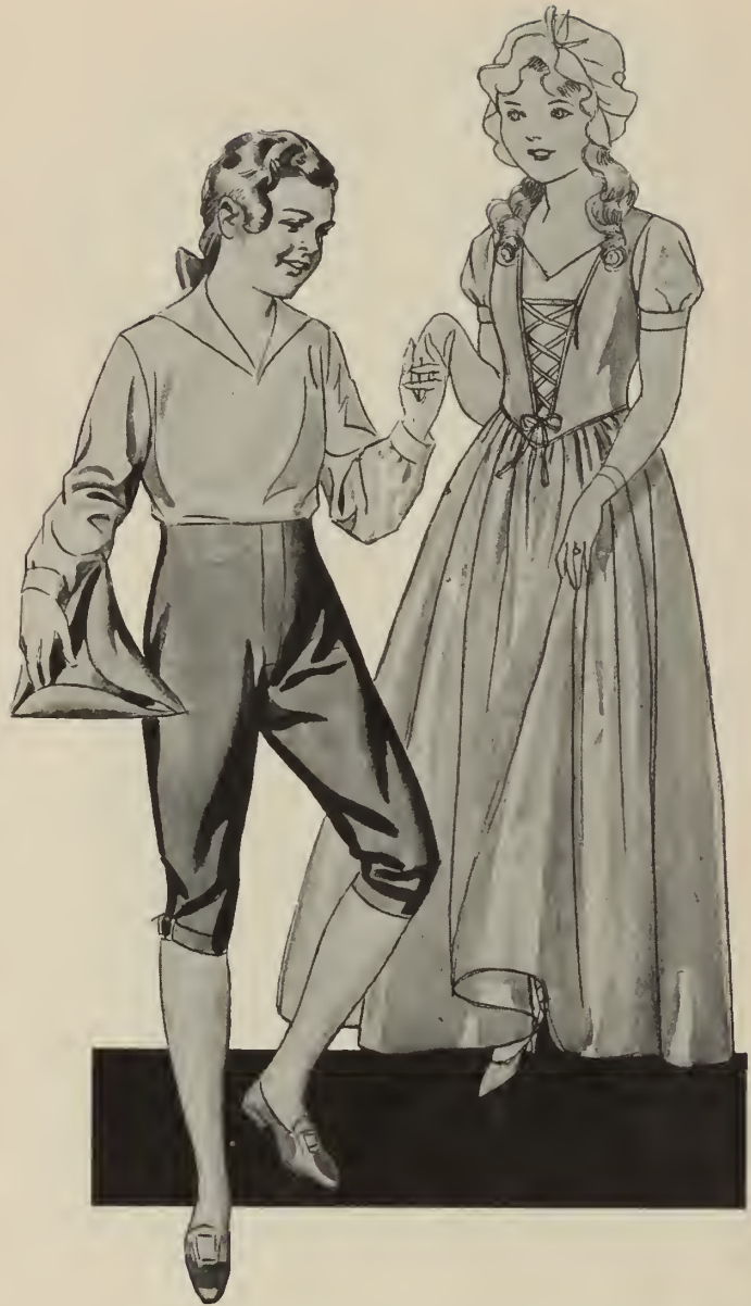
12. SIMPLE PLAY DRESS FOR BOYS AND GIRLS OF THE COLONIAL PERIOD.