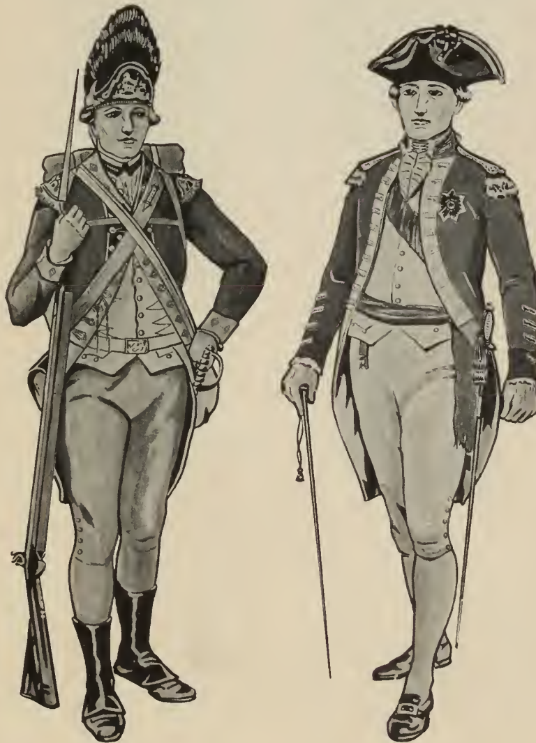
23. BRITISH PRIVATE. 24. BRITISH OFFICER.

knee length, a trifle short of the knee, or half-way between waist and knee. The longer length predominated. The linings of the coat were of various colors and when the tails were turned back and buttoned, as was the custom, the lining was prominently displayed. Practically all coats were double-breasted with lapels to the waist, having colored facings which showed as a decorative feature when buttoned back. A variety of collars and cuffs were used, the general favorite being a collar of generous proportions which could be turned up high for protection in cold weather or worn folded over. Later in the war, because of French influence, both American and British armies adopted the straight standing collar. The coats were provided with ample pockets, the opening at the waist line protected by a flap fashioned with buttonholes.