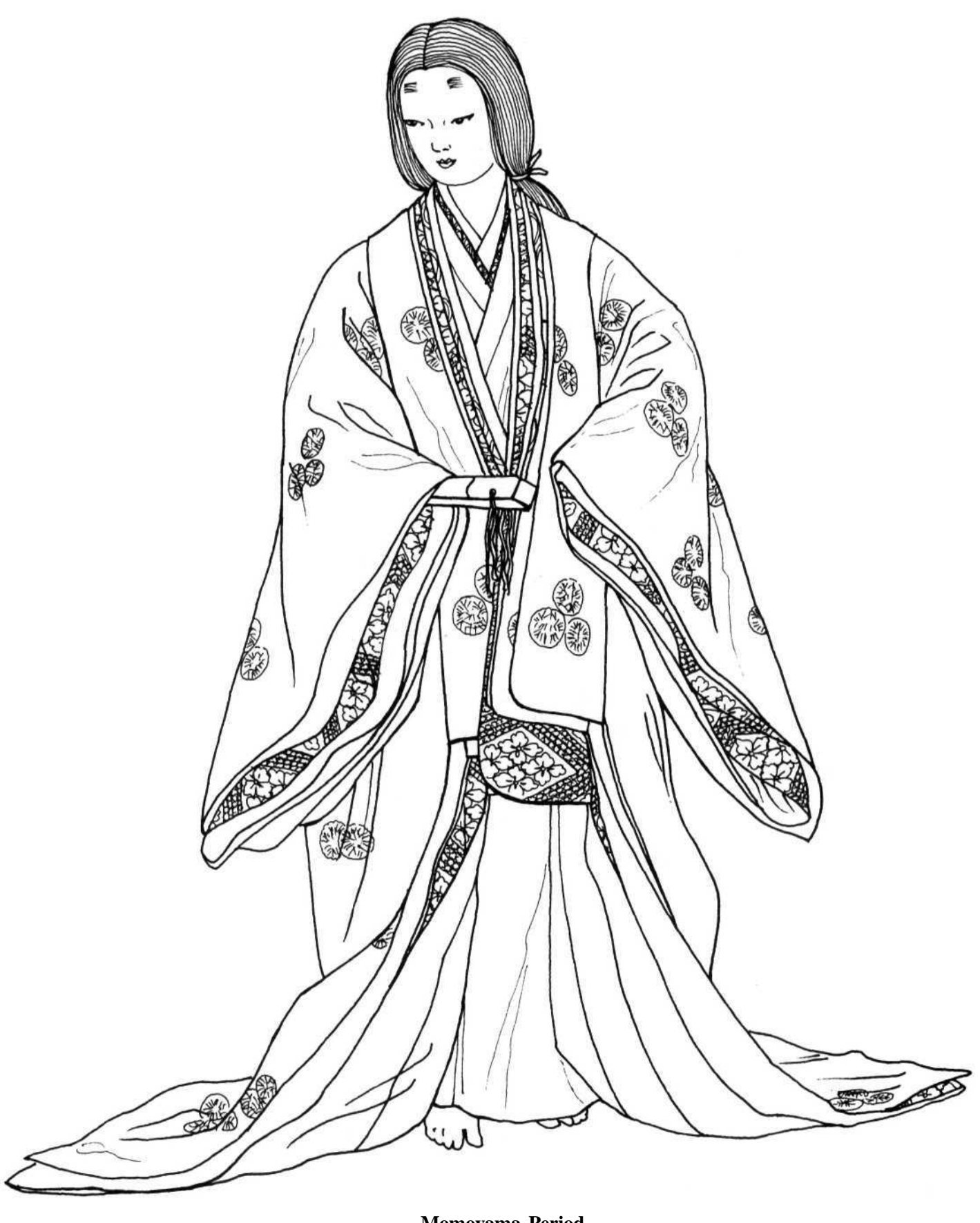
Momoyama Period In formal dress, this woman from the upper warrior class wears many layers of robes over kimonos .