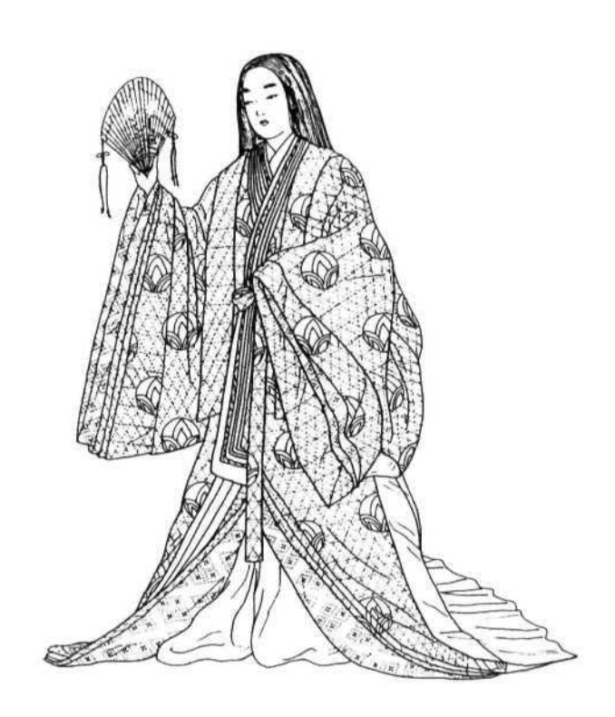
DOVER PUBLICATIONS, INC. Mineola, N.Y.