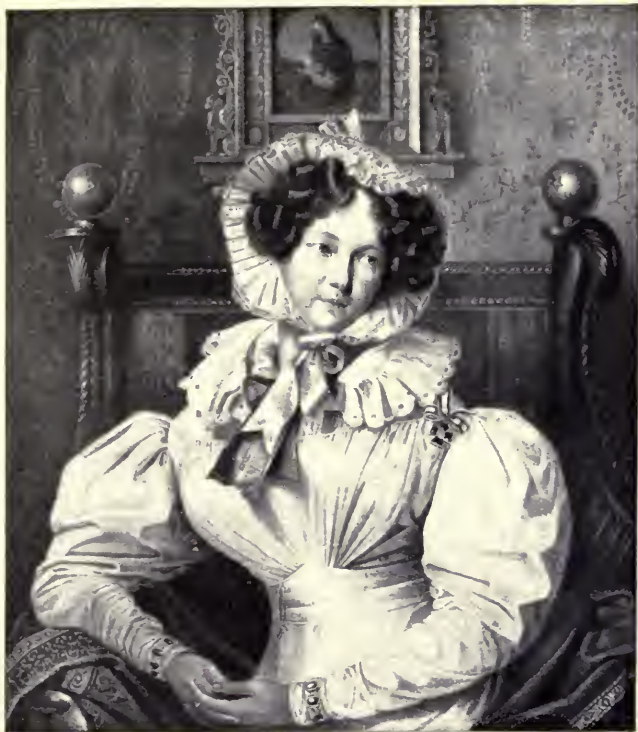
Gentile, after Krüger