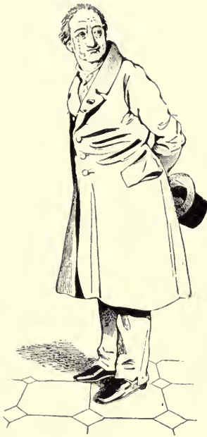
Maclise-Thackeray, after Stieler GOETHE