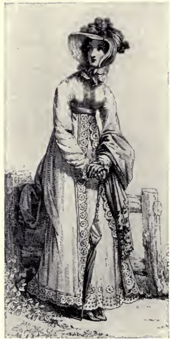
The Repository 1820: October

ing conditions by long years of imprisonment—the ruin, sometimes the loss of their lives—but only for ideas of freedom to take stronger hold of the hearts and head of the people. In Germany, as in France, the opponents were divided into two camps; on one side being the different governments with their aristocratic following and