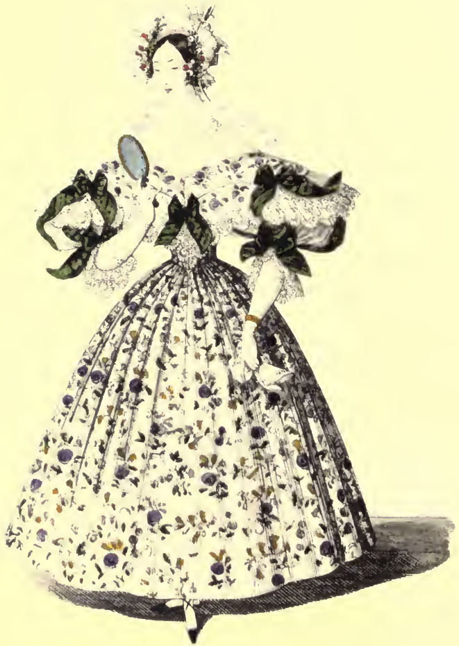
Wiener Zeitschrift, November 1835