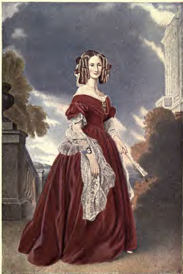
QUEEN OF THE BELGIANS

FRANZ XAVER WINTERHALTER Gallery, Versailles (about 1840)