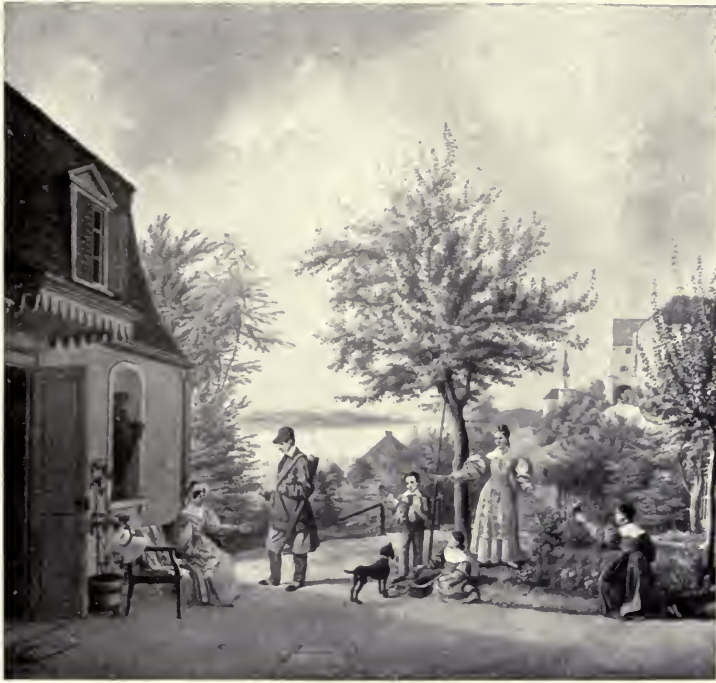
From "Family beside the Starnberg Lake"