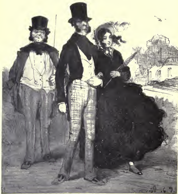
Casus belli, l'Angleterre jetant un regard de convoitise sur une conquête de l'Allemagne

From Beaumont's "L'Opera au XIX e siècle"