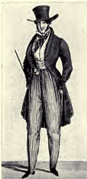
Journal des Dames 1823: May 20

by Joseph Gorrès, and of others not less ably conducted, such as Luden's Nemesis , Oken's Isis , &c. ; but the Carlsbad decrees of 1819, the direct result of Sand's crime, muzzled the periodic press of the country. The strict censorship prevented all free speaking and put a stop to all enterprise on the part of the editors, while enormous stamp-duties added to the expense of subscription and so lessened the circulation. And so although about twenty-two fresh papers appeared in Germany between 1823 and 1847, they could not compete either in circulation or in influence with those of France. Public opinion only gradually grew to be a power in Germany, while the new ideas acquired strength but slowly. When the