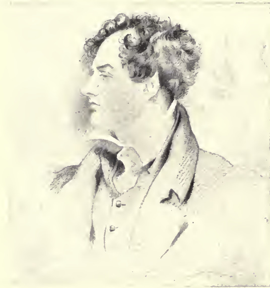
LORD BYRON

and energies to the improvement of the social condition of the working-classes. The Duc de la Rochefoucauld-Liancourt founded the first savings bank for the poor in 1818; England, from 1833 to 1844, was occupied with laws for the increase of the nation's well-being. In 1840 a large industrial undertaking was started in Val des Bois, in which the workers were to have an equal interest with the masters; philosophers were everywhere devoting themselves to the work of seeking new systems for the salvation of mankind. The years between 1830 and 1836 saw a veritable explosion of socialistic ideas. Socialism as preached by a St. Simon became the fashion; women became enthusiastic disciples of Père Enfantin, and by their exaggerations helped the extinction of his teaching.