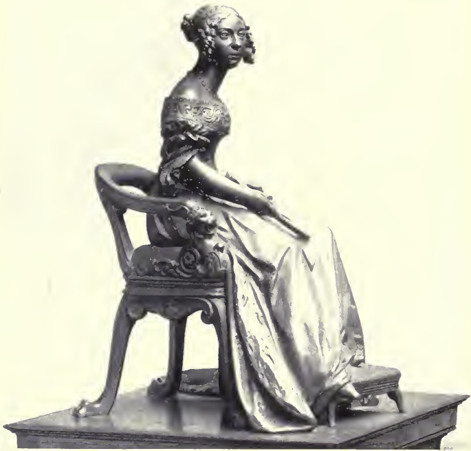
QUEEN ELISABETH OF PRUSSIA