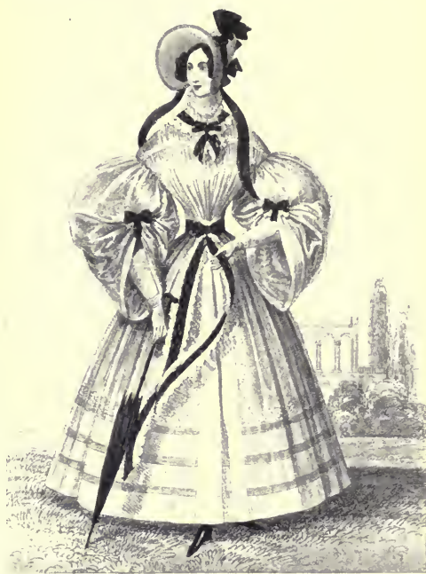
Wiener Zeitschrift 1835: April

The skirt of the dress grew gradually wider and fuller, but still left the feet free, and not till towards 1836-37 did it again reach the ground. For nearly twenty years the skirt remained untouched by fashion which found nothing to alter in its style, only trimming it more or less elaborately with puffs, flounces, folds, and furbelows, &c., so that it might devote itself to the bodice, for which it had a partiality, and more particularly to the sleeve. In 1816 the sleeve was still close-fitting, and came so far over the hand that only the fingers were seen. In 1818 short puffs were introduced, but from 1822 onwards fashion grew quite delirious over it, shapes and sizes of every description being worn which surpassed anything that had been seen in the