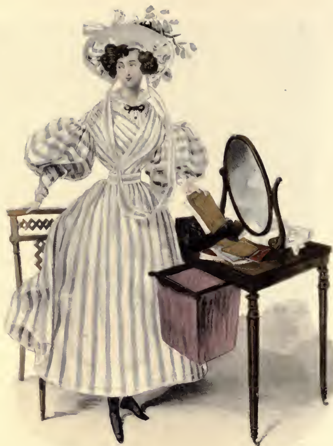
La Mode, Paris, 1830