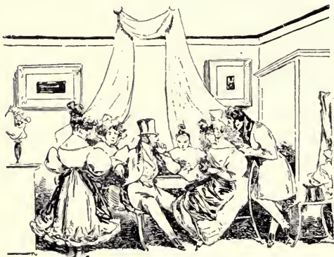
Monnier AT THE DRESSMAKER'S

At this time Scribe was busy with his skilful pen providing for the amusement of the decorous middle-class; his prolific talent enabled him to hold the command of all the European stages, his plays for years being more frequently performed than those of any other dramatist. Not till 1878 did a rival present herself in the