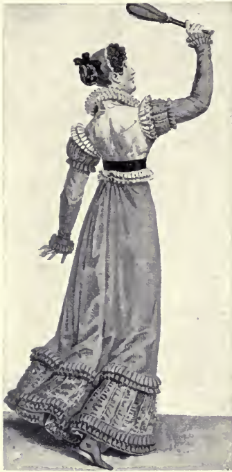
Journal des Dames 1820

burnt the Corporal's stick, stays, and other attributes of the reactionary party. The persecution which set in against those suspected as demagogues caused the death of numerous victims, among them many who were not of the worst. Who does not remember Fritz Reuter? These paid for their hopes and plans for the improvement of exist-