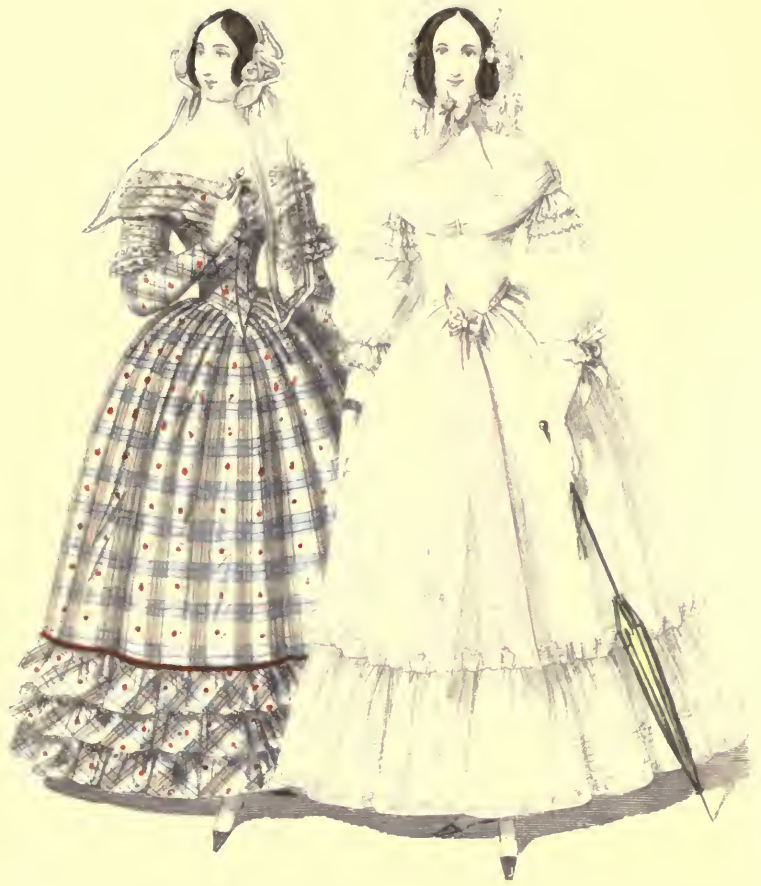
Wiener Zeitschrift, July 1840