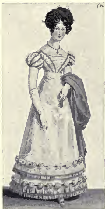
Journal des Dames 1821