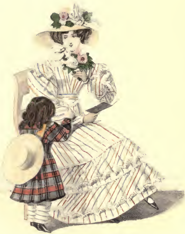
Wiener Zeitschrift, July 1826