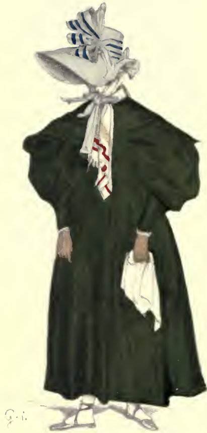
From Gavarni's "Physionomie de la population de Paris" 1832