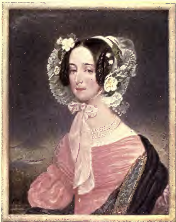
EMPRESS MARIANNE OF AUSTRIA