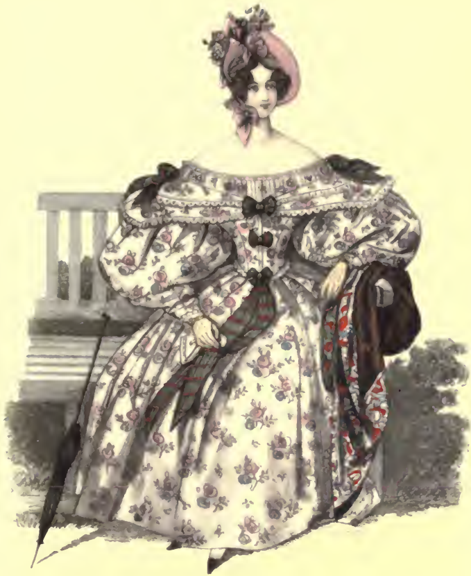
Wiener Zeitschrift, June 1834