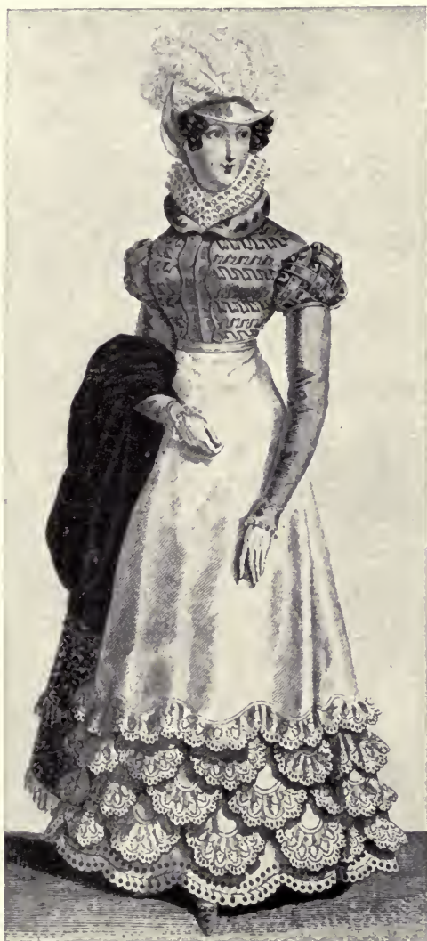
Journal des Dames 1822: January