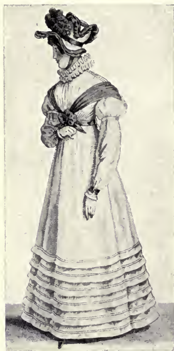
Journal des Dames