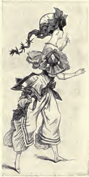
FANCY COSTUMES FROM La Mode , 1831

Themistocles, and Leonidas! The rebellion, which filled the reigning powers with fear and displeasure, was greeted with acclamations of joy by the people, and philhellenism became a religion with young and old.