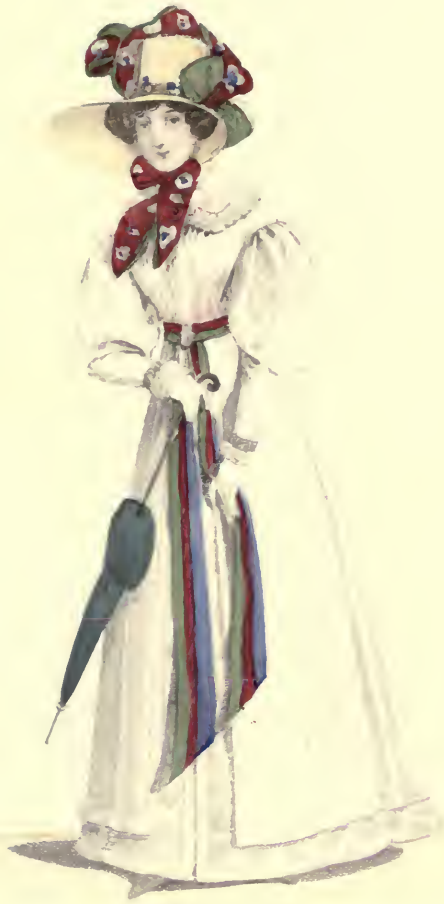
Wiener Zeitschrift, July 1825