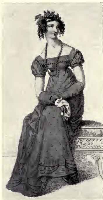
The Repository 1821

The improvement in the printing-machine, which made it possible to print off 2000 copies in an hour, gave a further opportunity for the use of the press as an organ of propaganda.