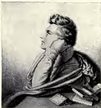
Grimm HEINRICH HEINE 1827

In 1825 a group of Russian officers banded themselves together to give their country a constitution; their efforts, however, failed miserably, not only for want of a proper leader, but quite as much on account of the ignorance of the people, who thought constitution meant the wife of the Grand Duke Constantine. In other countries besides Germany the progressive middle-classes were obliged to consign their sympathies and antipathies to inaction, and were forced to look on while the powers insisted on Greece, after it had fought for years to obtain its liberty, accepting the autocratic rule of a German prince; to look on while Poland, with the passive consent of Prussia, was crushed beneath the heel of the oppressor, and to suffer Belgium's efforts at self-deliverance to terminate to the advantage of a Coburg prince.