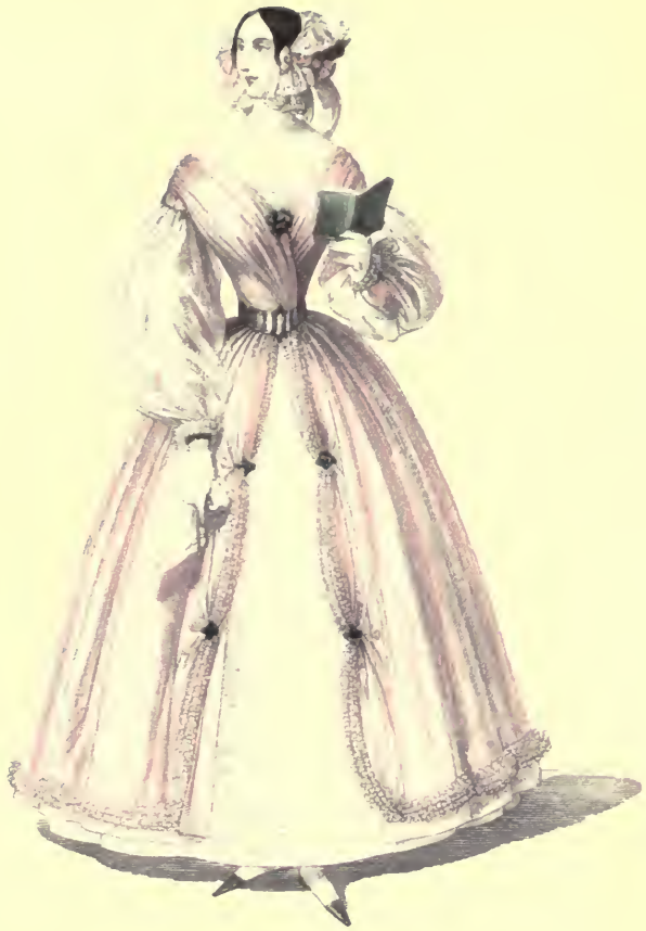
Wiener Zeitschrift, March 1840