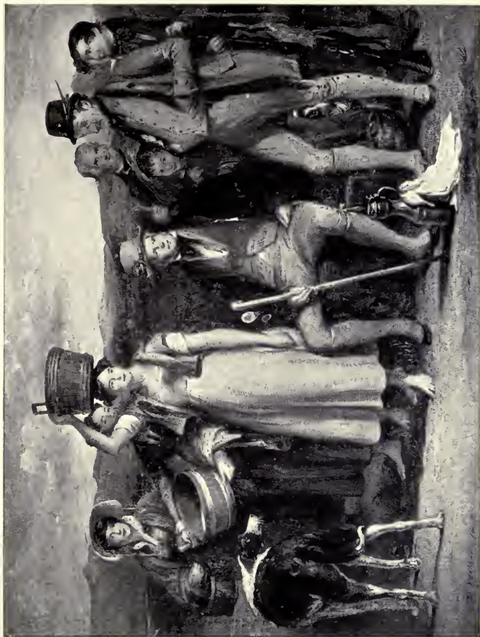
THE ABBOTSFORD FAMILY