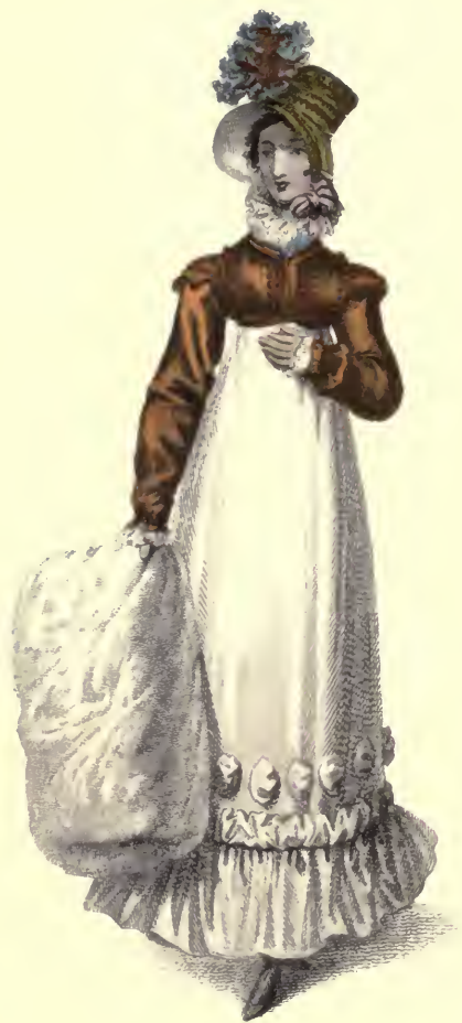
The Repository, London, December 1817