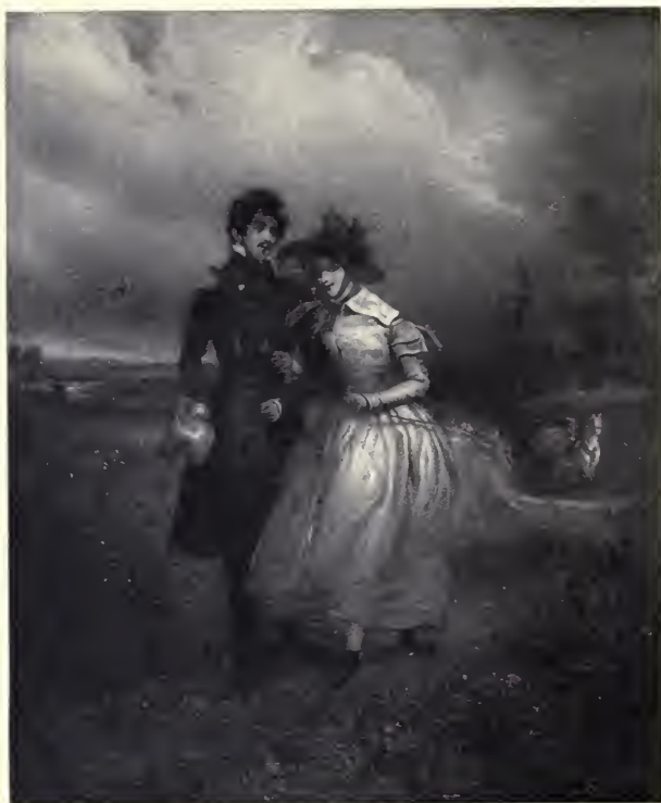
Noel, after Gavarni