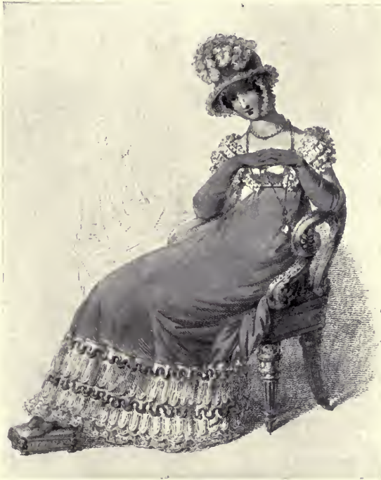
The Repository 1820: February

and against the universities. On the 13th February, 1810, the Duc de Berry fell a victim in the Opera-House in Paris to the dagger of a fanatic like Louvel. During the carnival of 1824 the Marquis Loulé, the Portuguese Minister, was murdered ;