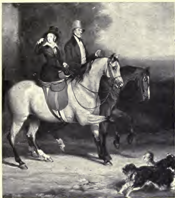
Grant QUEEN VICTORIA AND LORD MELBOURNE 1838 (From the Painting in Windsor Castle)

a pearl or such-like, was fastened to the middle of the forehead. The actual dress of those days was not very costly, but jewels were largely worn. The beautiful Madame Gros-Davillier, for instance, at a ball given in 1821, wore a white tulle dress which only cost 35 louis d'or, and 20 francs' worth of flowers, while her diamonds were worth a perfect fortune; and the jewels worn by the Baroness Rothschild in 1842 at a masked ball given by the Duc d'Orleans were valued at one and a half million francs.