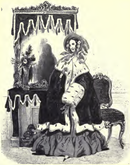
La Mode 1839: November

is more connection than we think between the thoughts and feelings of a period and the style in which people dress themselves; and that being granted we can easily trace that which existed between the romantic ideas that filled the smaller heads about 1830 and the costume of the day. The frills and flounces, the many colours and shapes of the dress and headgear, were fitting accompaniments, it would seem, for the medley of chivalry, romance, Weltschmerz, mediævalism, mesmerism, and God knows what else, which in 1830 were all in turn the chief subjects of interest; while half a generation later, when social questions were seriously occupying the public mind, women's dress, as if in sympathy with these graver matters, discarded all superfluities and