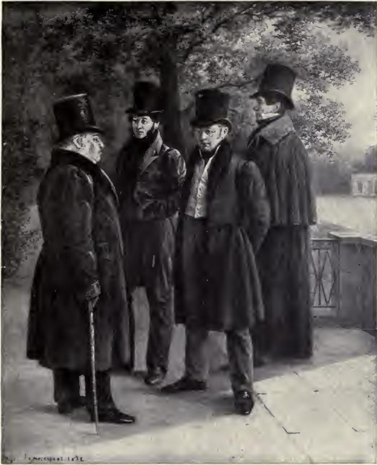
Tscherneloz Portraits: PUSCHKIN, KRYLOW, SCHUKOWSKI, GNEDITSCH