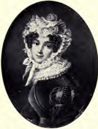
Mansion PORTRAIT MINIATURE (Wallace Collection, London)

These murders, which reached an incredible number in the course of a few years, give an idea of the political ferment of the time and of the discontent and excitement which no efforts on the part of governing bodies had power to suppress. Modern ideas of liberty were not to be stifled, and now an ally arose which the opponents of democracy might well nickname the "Hydra," for if the