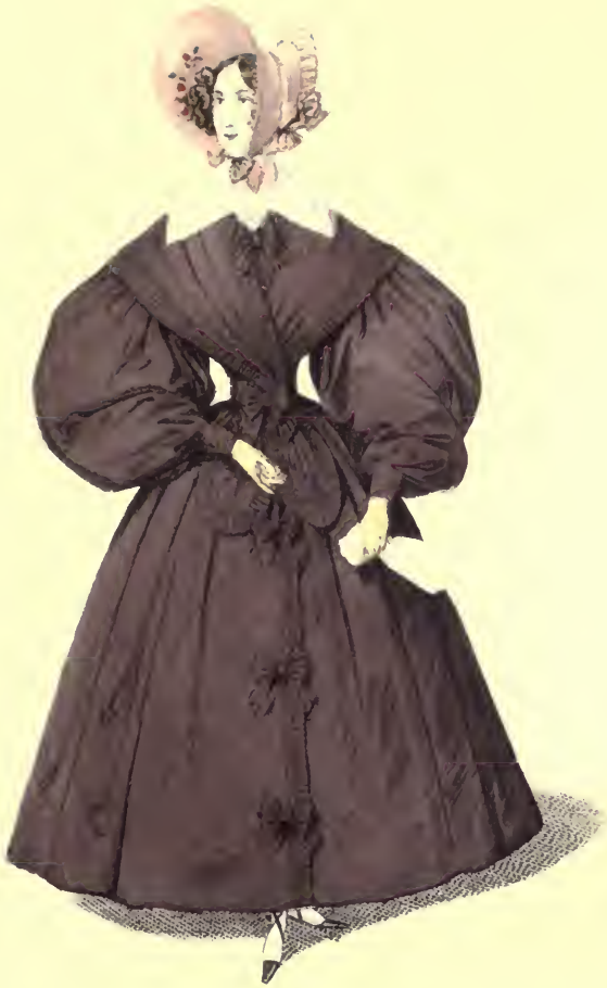
Wiener Zeitschrift, November 1835