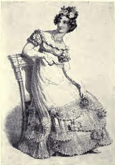
The Repository 1820: August

existed on the earth, attempts have from time to time been made upon their lives, but on the whole these acts of violence were rare before such periods of exceptional and passionate excitement as that of the religious wars of the sixteenth century,