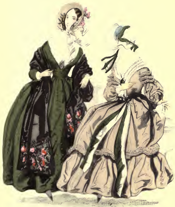
La Mode, Paris, June 1840