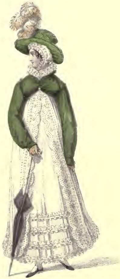
The Repository, London, May 1819